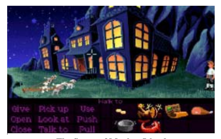
The Secret of Monkey Island

artwork was saved—guy.brush; the name stuck during production) is sent on three quests by the pirate elders of the town: he must find a buried treasure, defeat the swordmaster, and steal an idol