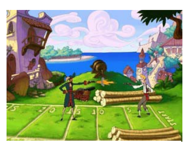
The Curse of Monkey Island