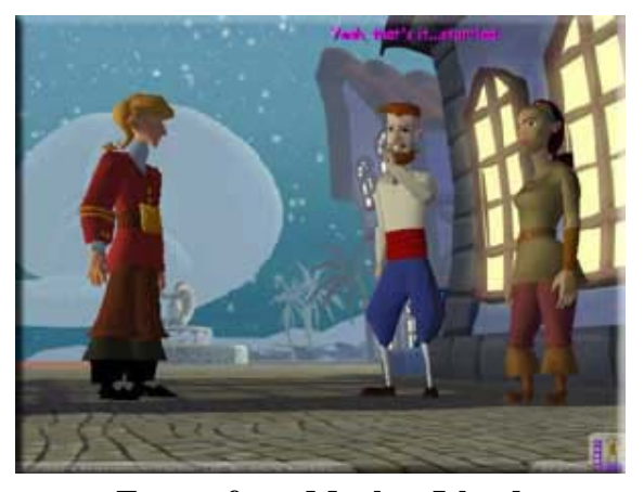
Escape from Monkey Island

The game sold a decent number of copies (as many as any previous Monkey