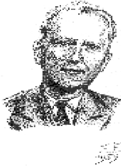
Figure 3: Eugène Ehrhart

in 1971. Ehrhart theory is now a central area of EAC with many applications and connections to other subjects.