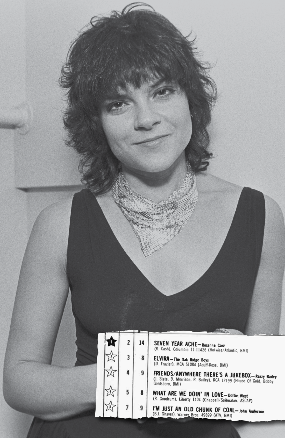
Cash in Chicago in 1981.

"Women my age still have a lot to say," she told Billboard in 2018. "That urgency and longing and righteous indignation and passion don't go away. They don't fade with time unless you let them."