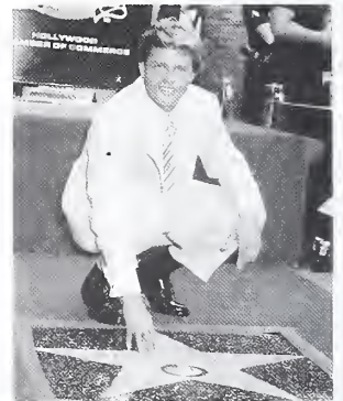
Luis Miguel touches his star on Hollywood Walk of Fame.

Afterward, a press conference at the Blossom Room at the Hollywood Roosevelt Hotel was held with over 250 members of the media in attendance. Said Luis Miguel, "For me, to have a star is one of the most beautiful experiences I could ever have in my career. This represents an important moment, not just for myself, but for all Latinos and all Spanish-speaking people." He went on to add that although his new album is entitled Nada Es Igual (Nothing Is The Same), he will always continue to be the same as before: a young individual who is ambitious, having many projects to look forward to. "There is nothing else that matters to me more than my career," he said. "I work 24 hours a day, it's what I enjoy, and that's how I am happy." Since this summer's release of Luis Miguel's new album, almost three million units have been sold on the international market.