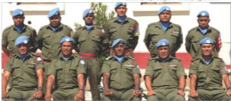
Fiji Battalion J Officers