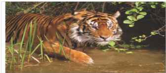
Tiger Hunting in Chitwan National Park

The third major tourist attraction in Nepal are the un-spoilt roaming forests. In addition to being known as "The land of the Gods", Nepal is also sometimes called "The Land of Forests". These forests are full of a vast myriad of wild flora and fauna, some which cannot be seen anywhere else on Earth. There are all together 850 species of birds in Nepal. Amazingly, half of these birds can be seen in and around the Kathmandu valley alone. Rare species of bird, such as the red-headed trogon, are found only in Nepal. There are many varieties of beautiful flowers in Nepal, including the national flower, the Rhododendron, which when it blooms in spring transforms the jungle into a paradise.