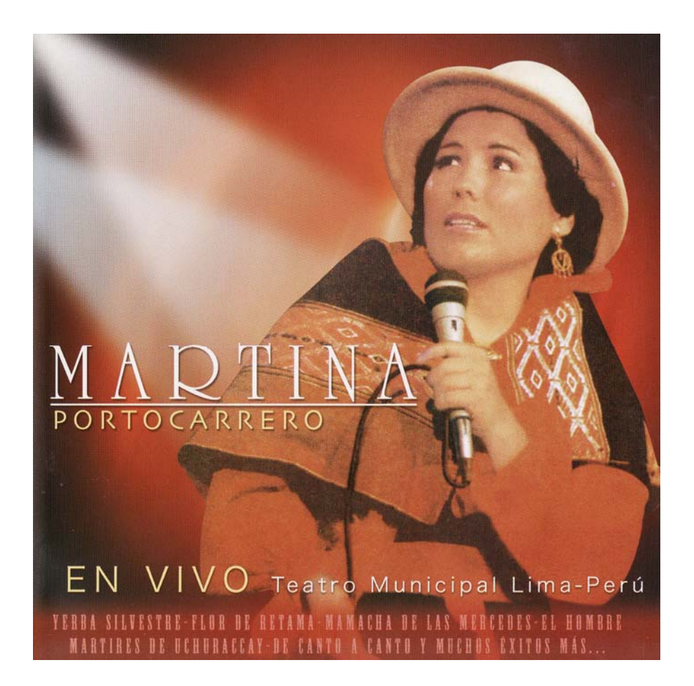
Figure 1: CD cover of Dolly J.R. Producciones' 2005 re-release of Martina Portocarrero's live recording from a 1987 concert in Lima's Teatro Municipal

J.R. Producciones—one of the most successful and important labels to emerge in the 1980s, in large part due to its promotion of the Ayacuchan cancion testimonial repertoire—to invest in re-mastering the original recording and re-release it on CD (see Figure 1) offers some indication not only of the concert's historic importance as an event during the war, but also of the continued popularity and broad demand for testimonial song recordings well after the period of violence, a point to which I will return in a moment.<sup>22</sup>