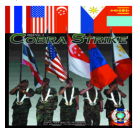
FIGURE 6 EXERCISE COBRA COLD

The United States Quadrennial defense Review Report pointed out "It requires that U.S. Forces train and operate with allies and friends in peacetime as they would operate in war. This includes enhancing interoperability and peacetime preparations for coalition operations, as well as increasing allied participation in activities such as joint and combined training and experimentation."<sup>8</sup> US engagement in the Asia-Pacific region is sustained by an intensive program of combined exercises.