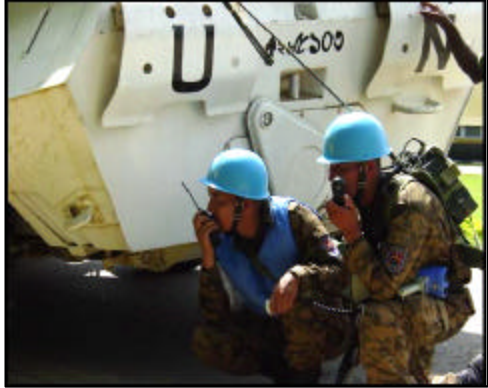
FIGURE 8 EXERCISE SHANTEE DOOT