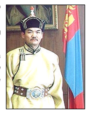
FIGURE 2 PRESIDENT N. BAGABANDI

As a result of the President's direct order, the General Staff of the Mongolian Armed Forces (GSMAF) established a new office within the General Staff structure, called "Peacekeeping Operations Office (PKOO)." The main objective of this office was to develop peace operations capacity building plan and to create a resource of trained professionals in the peacekeeping area. The foundation of the peace operations capacity building plan is the Basis of State Military Policy of Mongolia and Law on Armed Forces. The Peace Operations capacity building plan provided the General Staff of Armed Forces with the authority to create peacekeeping force and take the necessary actions to develop the Peace Operations capability for the next 5 years (2000-2005).