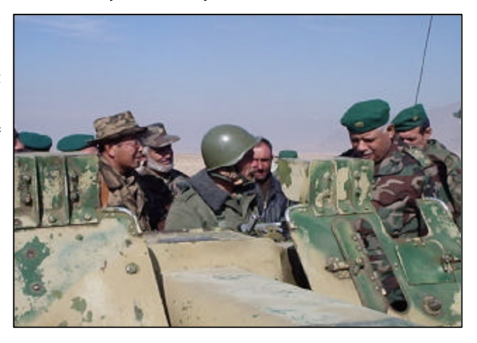
FIGURE 14 MOBILE TRAINING TEAM IN AFGHANISTAN

mission and trained 15 officers, 63 non-commissioned officers, and 123 soldiers to be core cadre for the first artillery battery of the Afghan National Army. The next rotation of Mongolian Mobile Training Team deployed from October 26, 2004 till February 1, 2005. The third rotation of Mobile Training Team was consisted of eight instructors for howitzers and eight instructors for mortars and they trained nine Afghan officers as instructors and