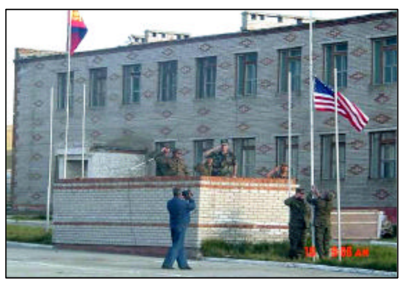
FIGURE 17 OPENING CEREMONY OF THE "KHAAN QUEST" EXERCISE AT THE FIVE HILLS TRAINING CENTER

The Mongolian military commitment to develop the ability to fully participate in International Peace and Stability operations forms one pillar of the Armed Forces mission to defend This Mongolia's sovereignty. commitment also includes developing the Tavan Tolgoi (Five Hills) Training Center into a fully functional training facility for both national and regional armed forces. The Five Hills training 30 center located miles from