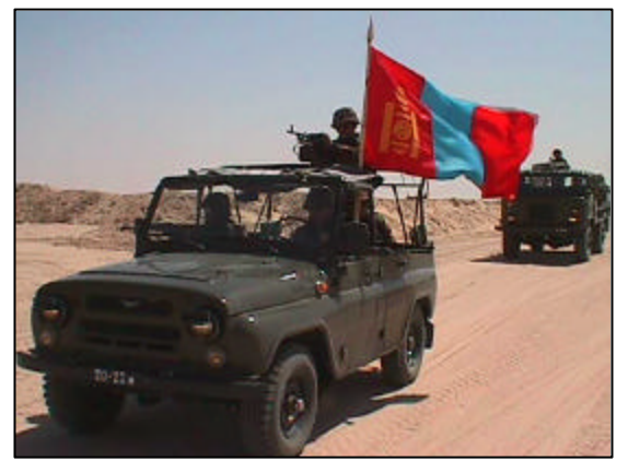
FIGURE 11 MONGOLIAN CONTINGENT IN IRAQ

The last time a Mongol army entered Iraq, it way led by Genghis Khan's grandson, Hulagu. During that