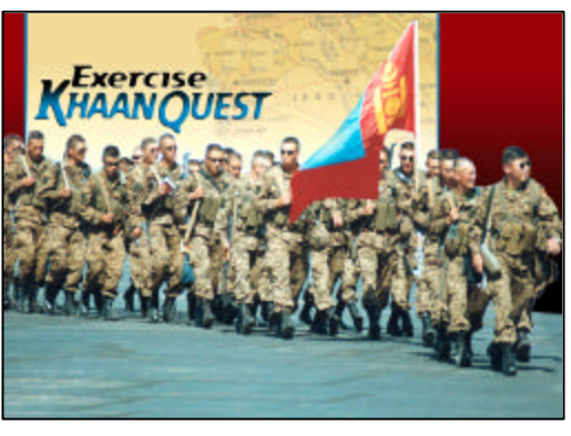
FIGURE 9 EXERCISE KHAAN QUEST 03

In addition to participating in a number of multinational exercises, Mongolia also cohosted and co-sponsored several multinational peacekeeping operations exercises in its home country facilitated by great support from the United States Pacific Command (USPACOM) (Table 3). Exercises such as BALANCE MAGIC, KHAAN QUEST, and the Multinational Peacekeeping Operations exercises are excellent training opportunity for the Mongolian military, and develop key skills and capabilities