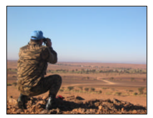
FIGURE 3 MILITARY OBSERVER IN THE WESTERN SAHARA

Prior to the adoption of the law on Mongolian military and police personnel participation in the UN Peacekeeping and other international operations, Mongolia trained 12 officers at United Nations military observer courses in Ireland, Germany, Switzerland, Iran, Canada and India. Based on agreements between Mongolia and the United Nations and by authorization of the law, Mongolia sent its first two military observers to the United Nations mission in the Democratic Republic of Congo (MONUC) in August 2002. Later in December 2002, another three officers started their military observer mission in the Western Sahara (MINURSO). By February 2004, Mongolia had sent nine military observers and five other observers are currently serving in those two missions.