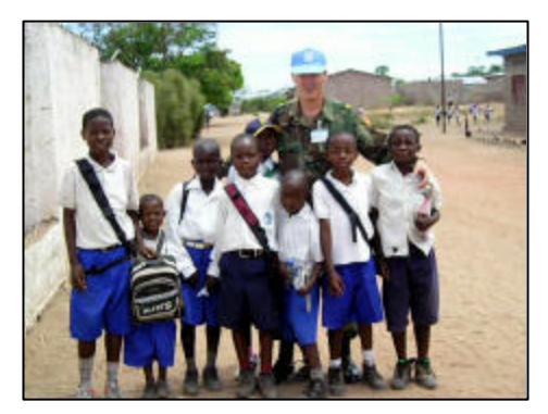
FIGURE 4 MILITARY OBSERVER IN THE DEMOCRATIC REPUBLIC OF CONGO

In 2003, The General Staff of the Armed Forces identified peacekeeping as a primary mission for Armed Forces in peacetime and expanded the PKOO into Department of Peacekeeping Operations (DPKO). DPKO continues implementing the peace operations capacity building plan and remains concentrated on involvement of international peace operations activities. Mongolia is actively involved in Asia Pacific peace activities and with United States sponsored programs such as the Asia Pacific Peace Operations Capacity Building Program, the Enhanced International Peacekeeping Capabilities (EIPC) program, the Multinational Planning Augmentation Team (MPAT) program, the International Military Education and Training (IMET) program, and remains heavily engaged in Multinational peace