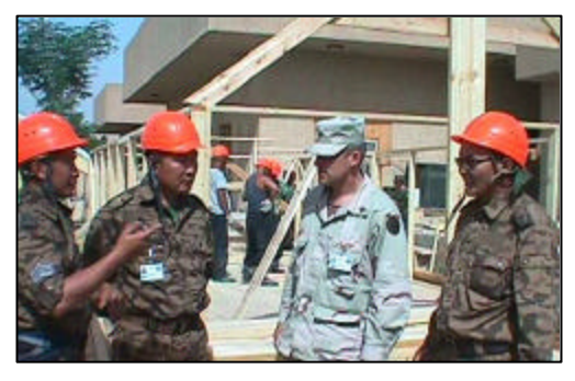
FIGURE 13 MONGOLIAN CONSTRUCTION TEAM IN IRAQ

The Mongolian Liaison Team at the Coalition Coordination Center (CCC) at the Coalition Village at MacDill Air Force Base in Tampa was and remains the primary coordination team between US Central Command (USCENTCOM), General Staff of Mongolian Armed Forces and the Mongolian contingent in Iraq and Afghanistan. The liaison team's role is to report their activities to the General Staff of Armed Forces, to provide USCENTCOM with necessary information regarding Mongolian troop's issues, and to coordinate the efforts of all parties.