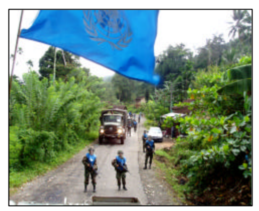
FIGURE 7 EXERCISE SAMA GAMANA

British Peace Support operations doctrine stated that "Peace Operations require high standards individual skills, discipline, and morale. The training is vital to deliver these standards and credible force. In order to offer guidance on most appropriate techniques for accomplishment of the mission and degree of restraint that will need to be exercised."<sup>9</sup> Exercises are an important part of the training and exercise events provide essential opportunities to develop peace and stability operations skills.