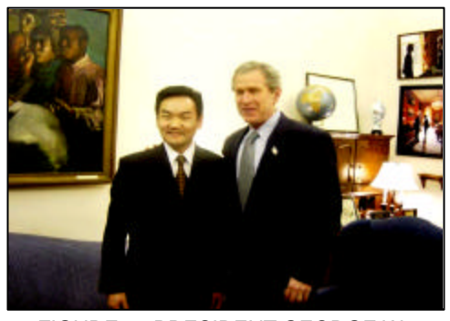
FIGURE 18 PRESIDENT GEORGE W. BUSH AND PRESIDENT N. BAGABANDI

Bagabandi declared a new era of cooperation and comprehensive partnership between two democratic countries based on shared values and common strategic interests in July 15, 2004. welcomed President Bush Mongolia's commitment to combat international terrorism and applauded Mongolia's participation in the stabilization and reconstruction of Afghanistan and Iraq, including its peacekeeping commitment to the Multinational Force in Iraq. The United States and Mongolia agreed to