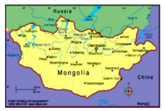
FIGURE 1 MAP OF MONGOLIA

Mongolia has developed its own approaches to National Security by adopting a new Constitution in 1992 and the basic concept of National Security and Foreign Policy in 1994. The new Constitution of Mongolia states that "Mongolia shall have armed forces for self defense"<sup>1</sup> and established a legal basis for reforming state defense policy and modernization of the armed forces. By the presidential decree in the Policy and Directions of Military Modernization in 1997, the Government was tasked to develop the Armed Forces into a compact, professionally-oriented, and capable force.