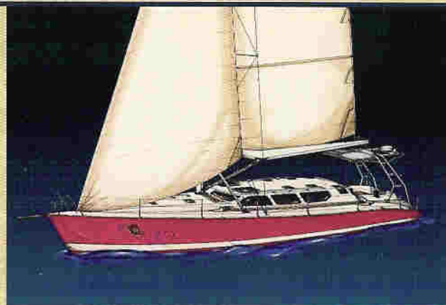
The New HC50