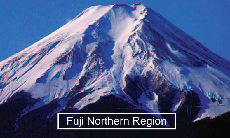
Fuji Northern Region

~ Being Prepared for a Possible Eruption ~