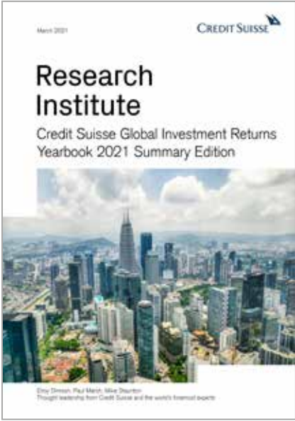
Summary Edition Global Investment Returns Yearbook 2021 March 2021