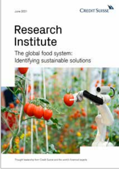
The global food system: Identifying sustainable solutions June 2021