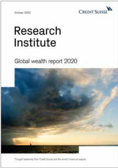
Global wealth report 2020 October 2020