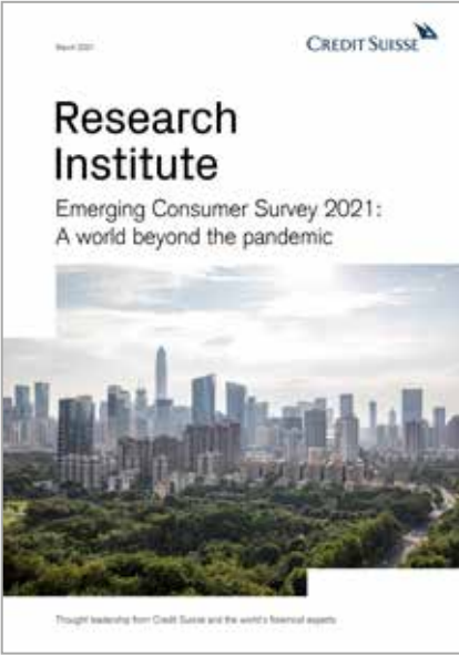
Emerging Consumer Survey 2021: A world beyond the pandemic March 2021