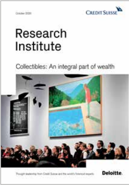
Collectibles: An integral part of wealth October 2020