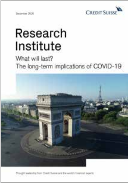
What will last? The long-term implications of COVID-19 December 2020