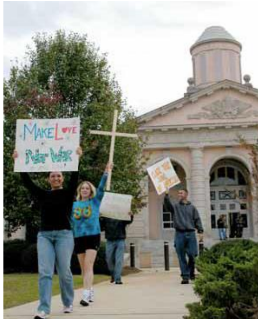
Figure 3. WHINSEC staffers prepare a mock protest to get ready for protest weekend as reported in WHINSEC's newsletter.

The combination of framing with other forms of noncooperation and intervention remain vital in this and other cases. Framers must learn to frame beyond the potential for counterframes and in accordance with other solid and promising strategies for noncooperation and intervention of the injustices they protest.