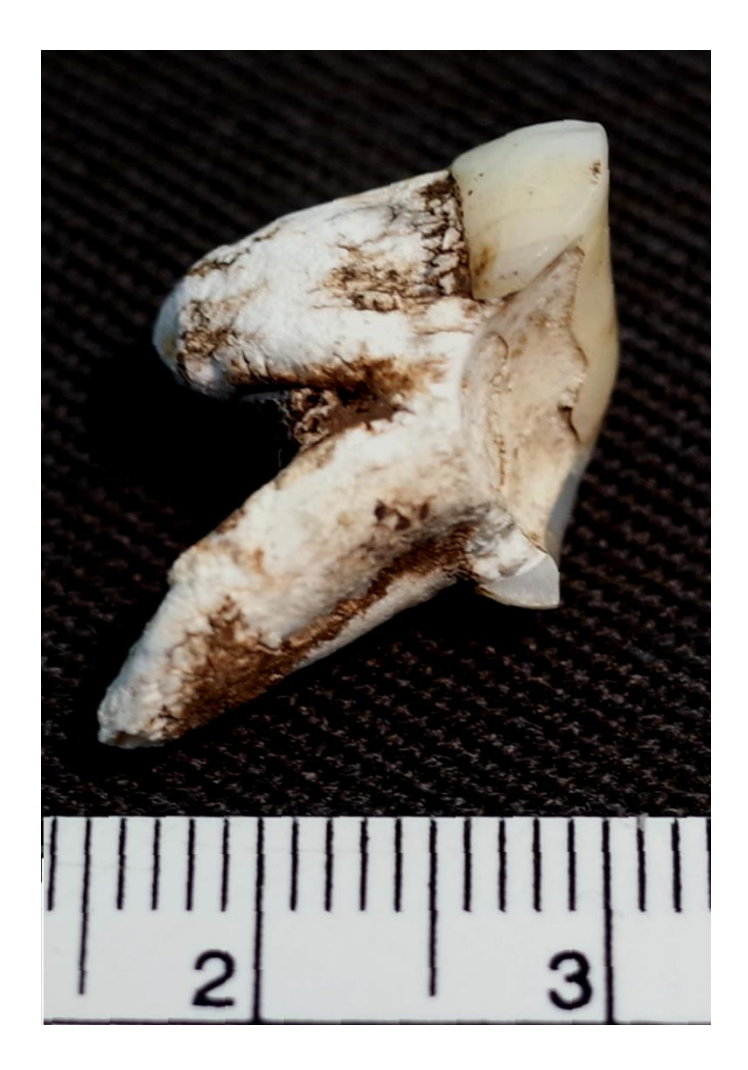
Figure 3. Steeply-angled wear on an upper left second molar (U.W. 101-528).