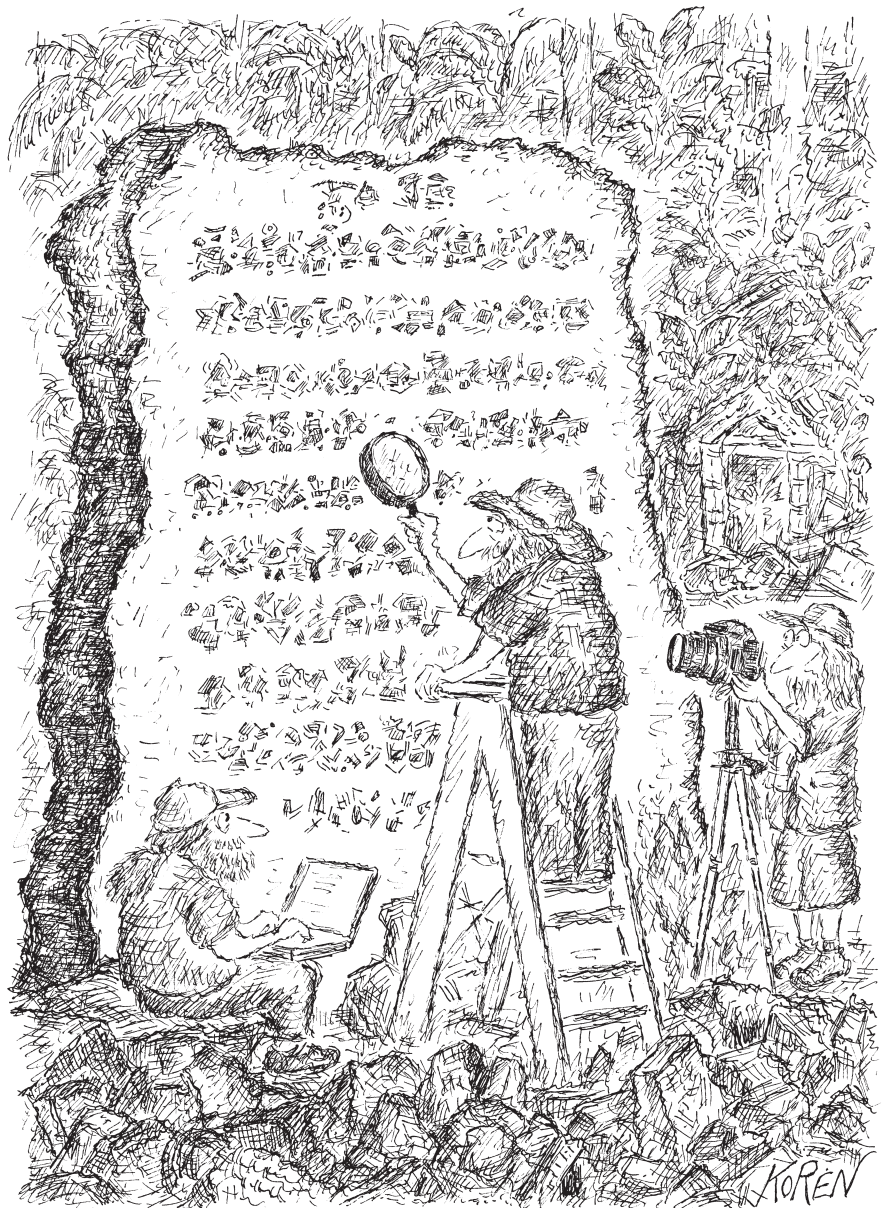
“Mow lawn, take out garbage, water plants, weed garden.”