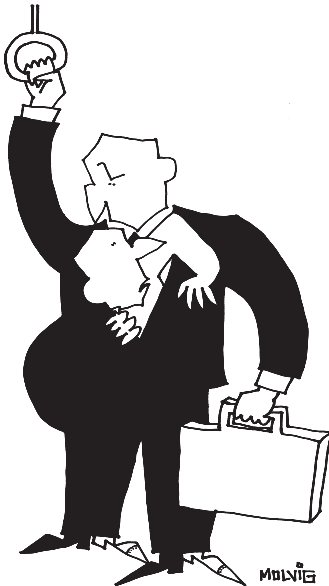
“Terribly sorry, I thought this was my Brooks Brothers.”