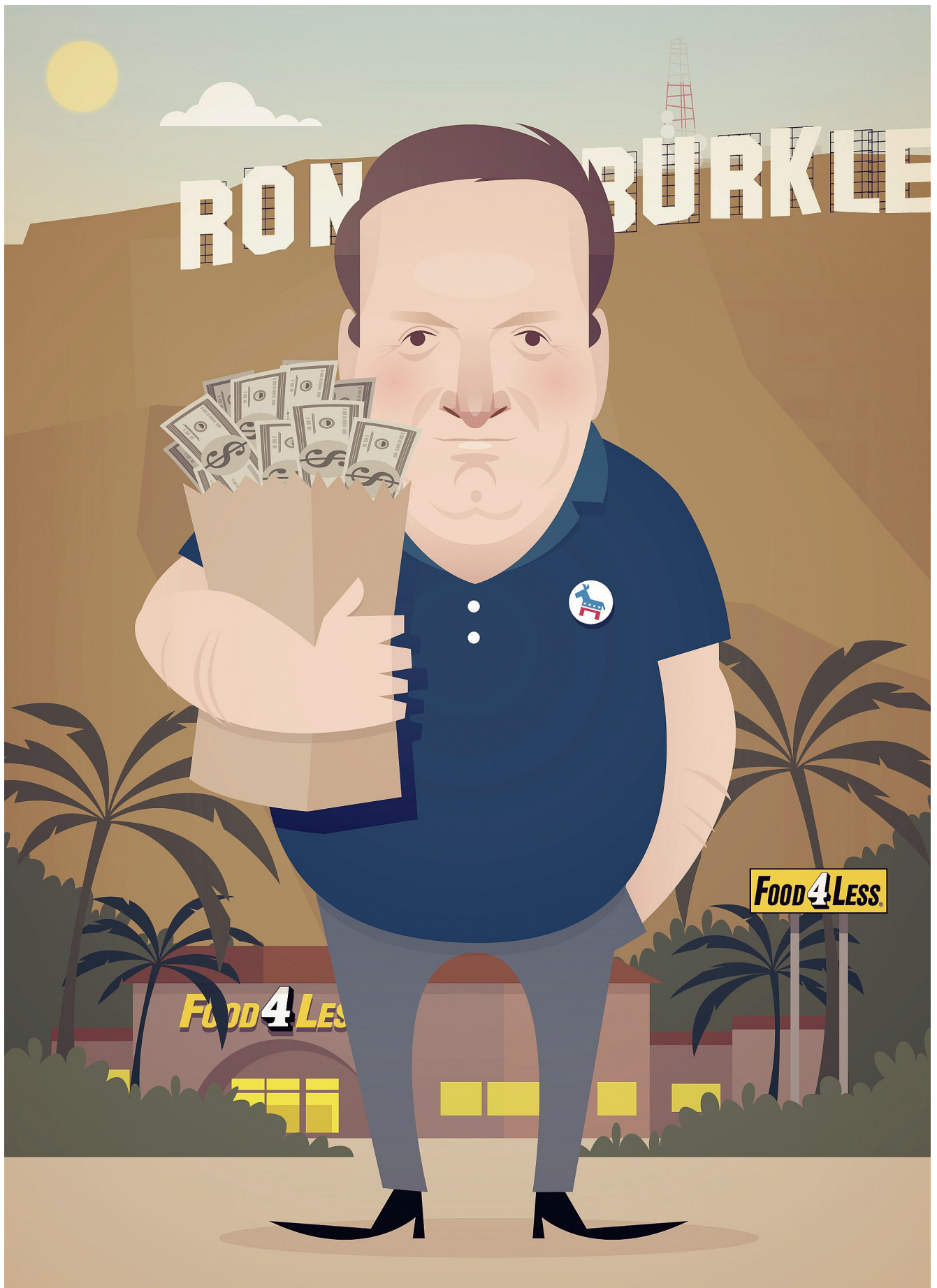
Burkle knows the pitfalls: "The more fun something is, the sexier something is, the more idiots there are chasing it."