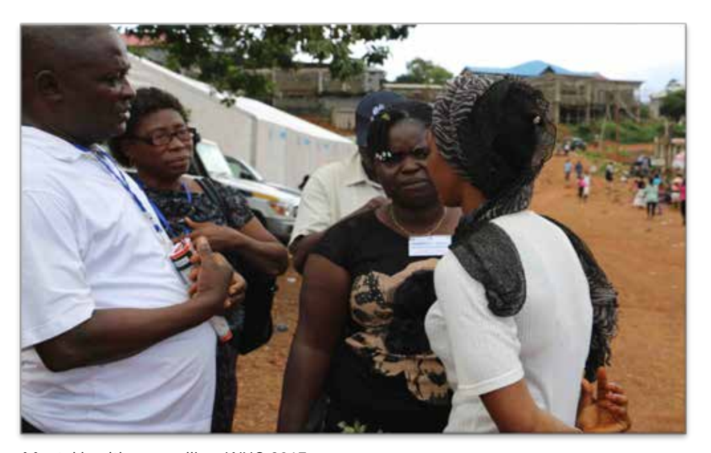
Mental health counselling. WHO 2017

WHO is supporting Mental Health Nurses in all affected areas providing psychosocial first aid to affected people. Trauma and grief are commonly reported among affected populations. Referrals are being provided for more complex cases and WHO is also advising on medicines provision and availability. To date, nearly 1000 people have been reached through this psychosocial support which is also supported by the Red Cross and CARE (In Kaningo).