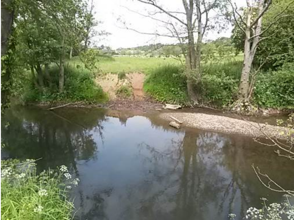
Photo 19 A livestock access/crossing point that will fall within one of the planned fenced headlands.