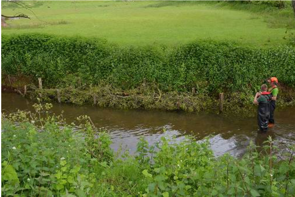
Photo 23 Brushwood bank revetment installed on the River Leadon. This can be used to protect the toe of the bank from erosion.