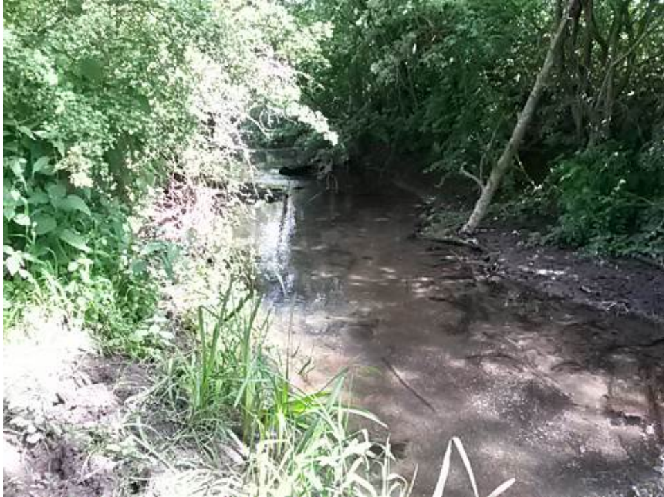
Photo 3 The mill leat channel showing the very low residual flow when river levels are low. The substrate is dominated by fine sediment.