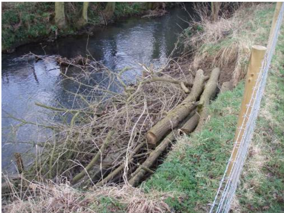
Photo 24 Brushwood revetment wired and staked in place, in combination with fencing.