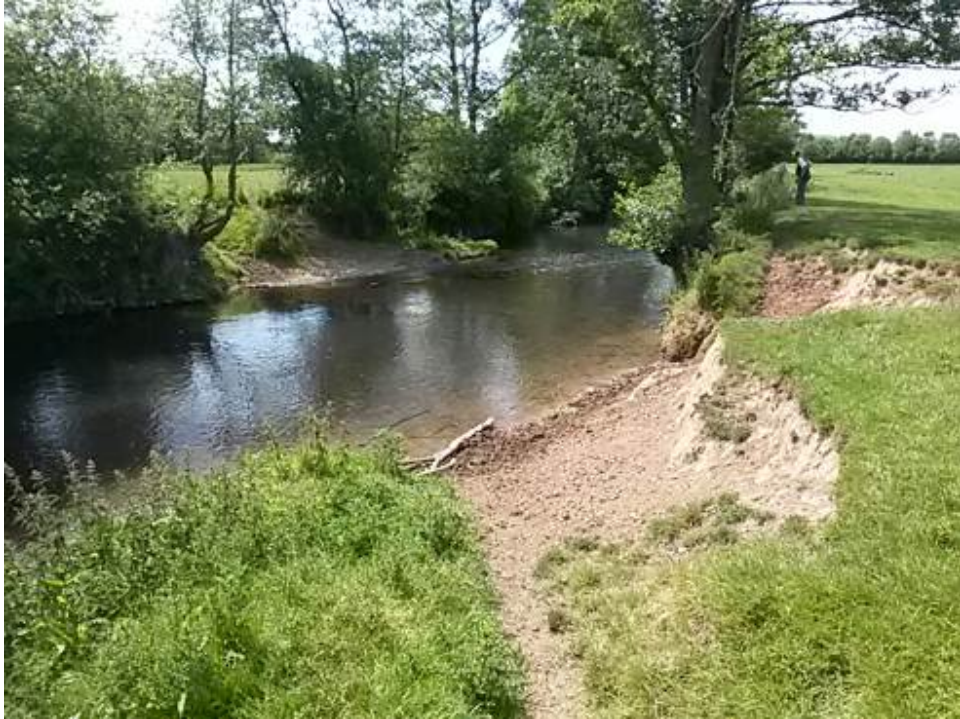
Photo 7 In some areas livestock can access and cross the river. Fencing would prevent this and reduce fine sediment inputs to the river (Pool 2).