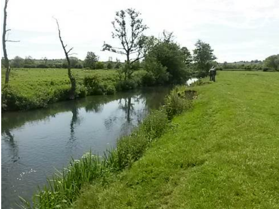
Photo 11 Alder disease has denuded tree cover in some areas. Fencing to allow tree succession is recommended here. Tree kickers (hawthorn) could be introduced along the toe of the left (far) bank. Dead wood should be left standing as habitat for woodpeckers, etc. (Pool 4).