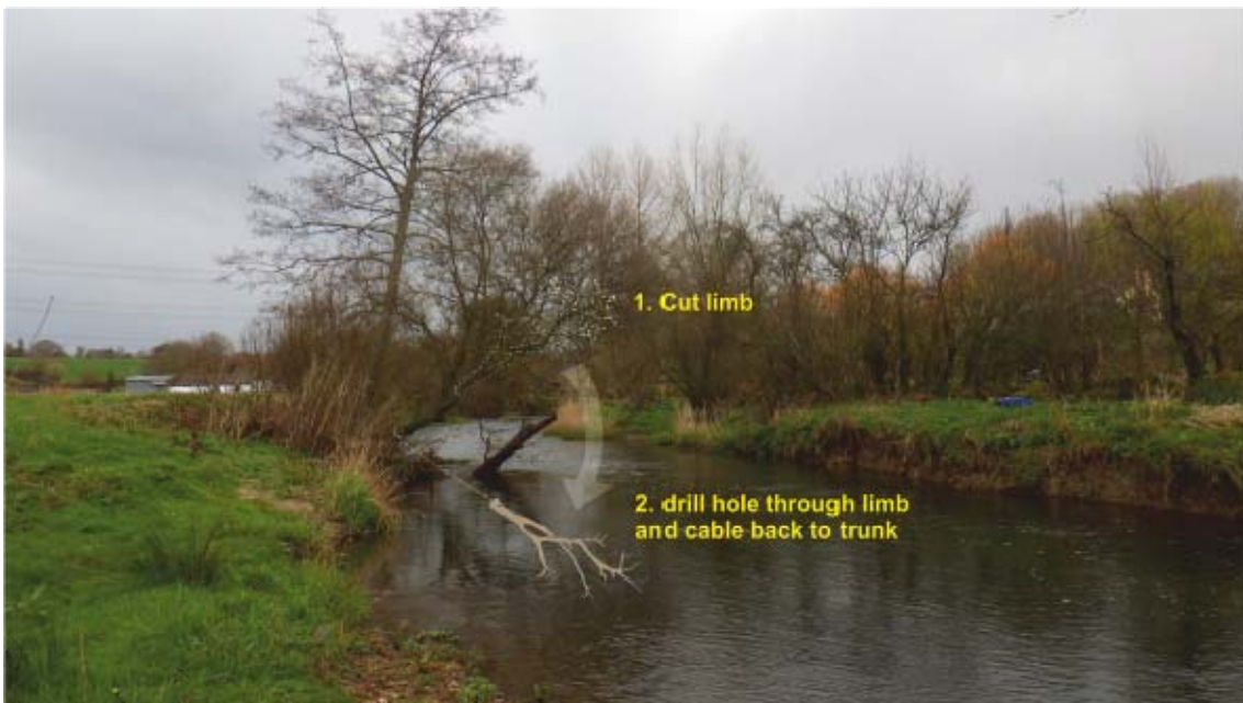
Photo 22 Example of a tree kicker. A shorter cable can be used to restrict movement. The kicker rises and falls with water level, providing bank protection at all water levels.