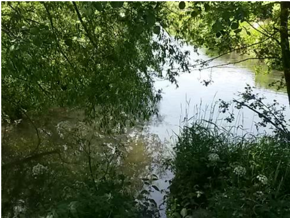
Photo 4 Confluence of the mill leat and the main river – a good high-water refuge area.