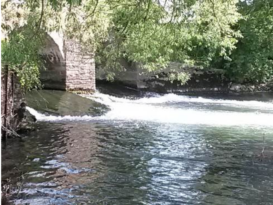
Photo 1 Weir at Eaton Hall bridge.