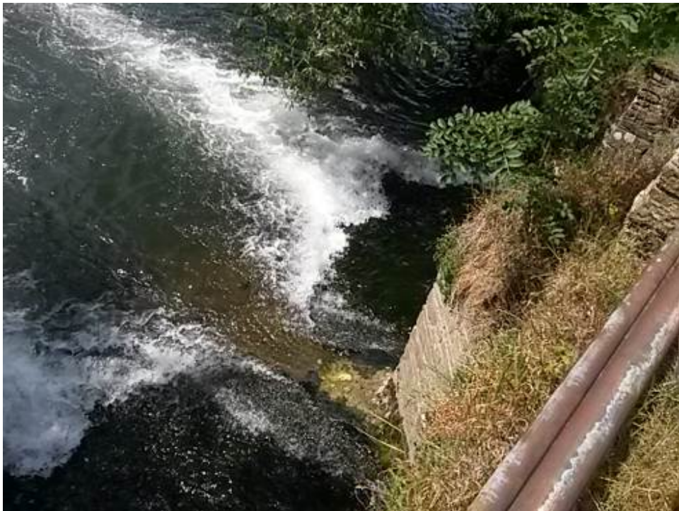
Photo 2 Slack water alongside the flumes of the weir give stronger swimming species a point from which to leap onto the face of the weir and use burst-speed swimming to ascend. However, the high velocity and shallow depth remain a significant obstacle.