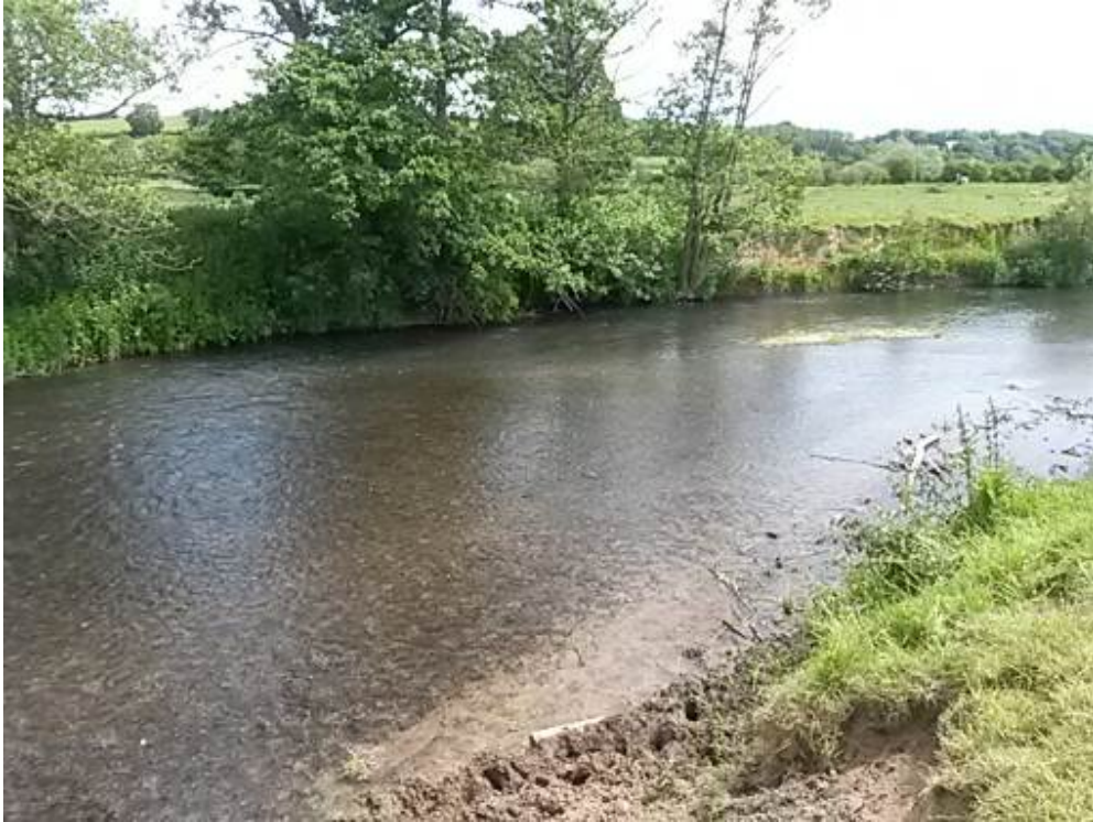
Photo 13 A wide shallow riffle which falls within a headland which has been earmarked for fencing. This will prevent livestock access here and lead to natural recolonization with marginal plants and beneficial narrowing of the channel. This process could be speeded up by installing a brushwood “mattress” in the near margin (Area 6A).