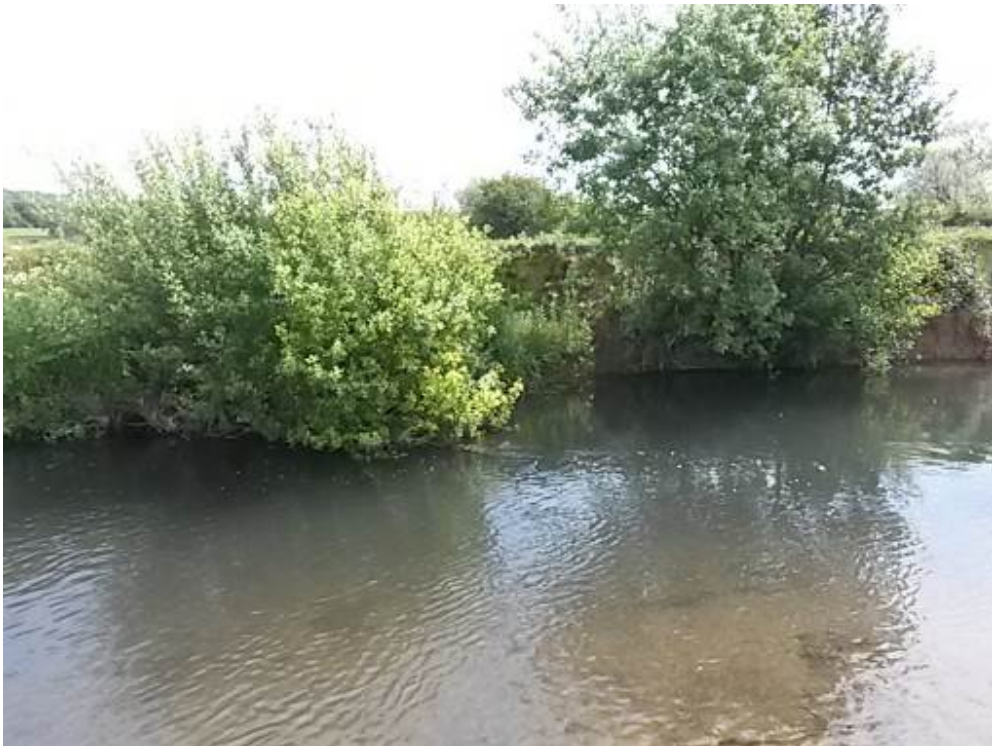
Photo 14 Low cover over the water provides excellent holding lies for fish and should be retained (Area 6A / 6B).