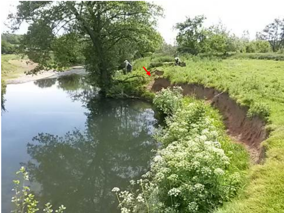
Photo 12 Another example of bank erosion on the outside of a bend being exacerbated by livestock access. Although the toe of the bank is currently stable and vegetated, sheep pathways leave a line of bare earth which is easily eroded at higher flows, in this case threatening to outflank and undermine the mature tree (arrow). Fencing is recommended here (Pool 5).