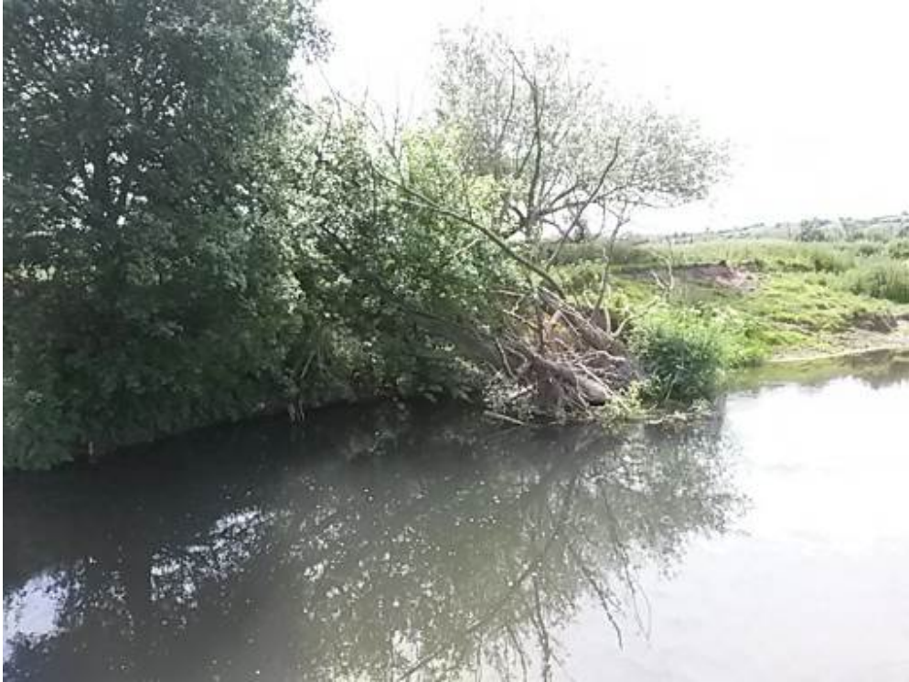
Photo 15 Woody debris in the river is also excellent habitat, providing cover, refuge from predators (such as otters and fish-eating birds), and increasing the production of invertebrates. Leave it in place (Area 6B).