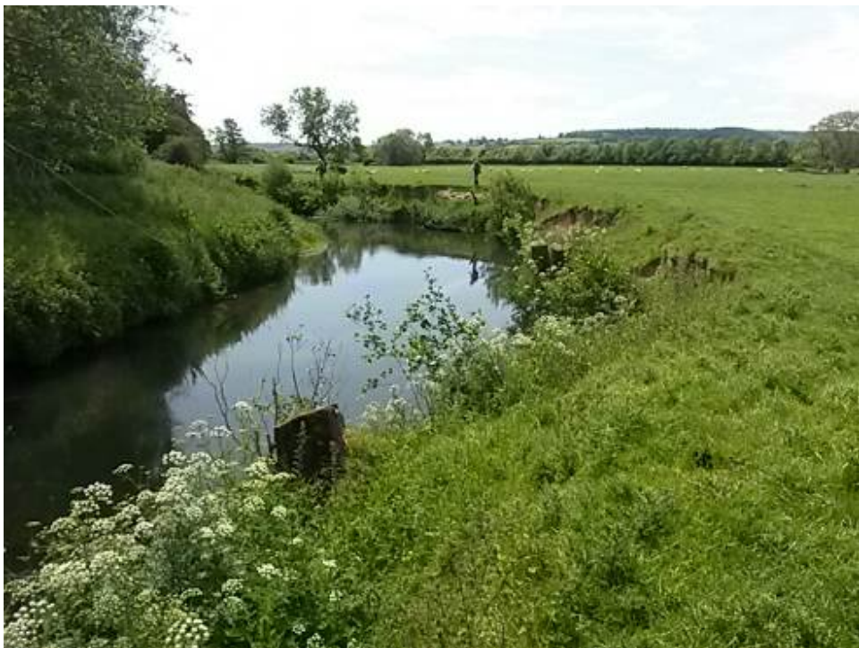
Photo 6 In contrast, the right bank has fewer trees and livestock have unrestricted access. The steep bank profile prevents grazing to the very edge of the river, but such areas would benefit from fencing to allow tree succession (Pool 3).