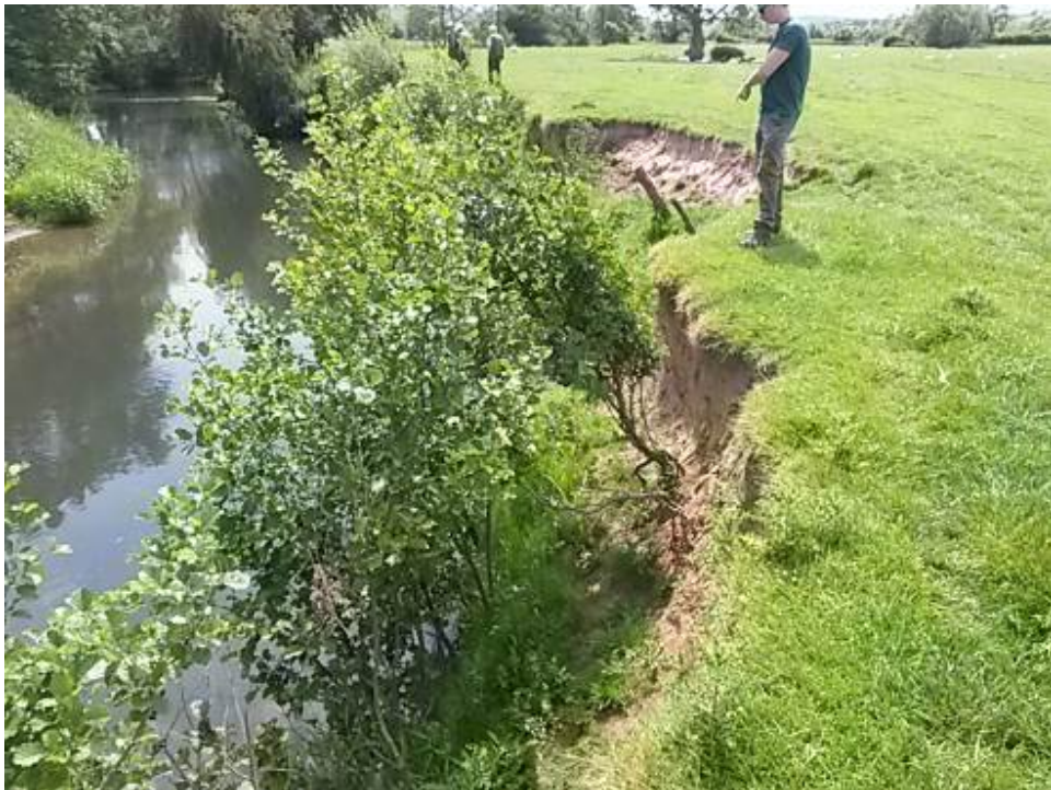
Photo 8 Trees are colonising the right bank away from grazing pressure at the toe of the steep banks. However, these small alders are vulnerable to washout and sheep are making pathways behind them, grazing off lower leaves and undermining the roots. Protecting the trees will protect the bank from accelerated erosion (Pool 3).