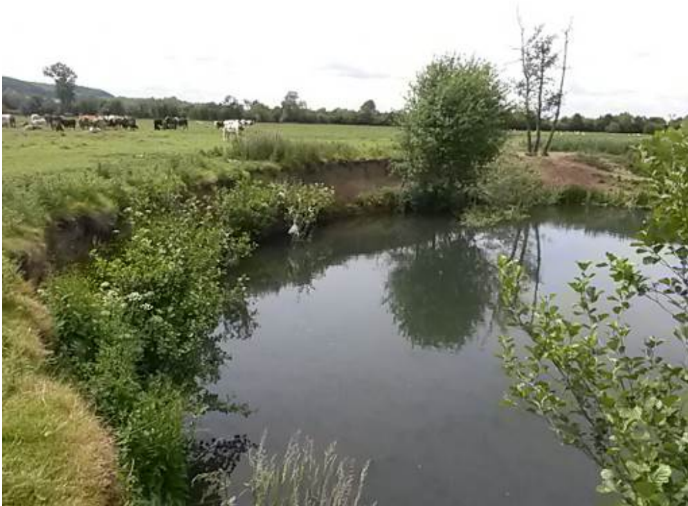
Photo 18 A further example of vegetation establishing at the toe of the bank, but being restricted beyond there by grazing. Fencing back from the fall of bank would help increase bank resilience here (Area 8).