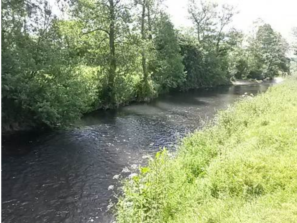
Photo 5 Good tree cover along the left (far) bank provides good bank stability, shade and low cover over the water (Pool 1B / 2).