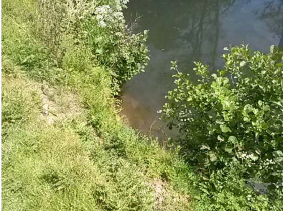
Photo 9 Areas of bank in-between the alders in the previous photo could be protected with brushwood revetment which would reduce erosion rates whilst vegetation established behind a new fence line (Pool 3).