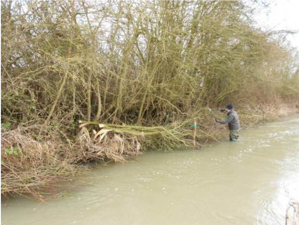
Photo 21 Hinging and laying small trees to provide low marginal cover for fish.