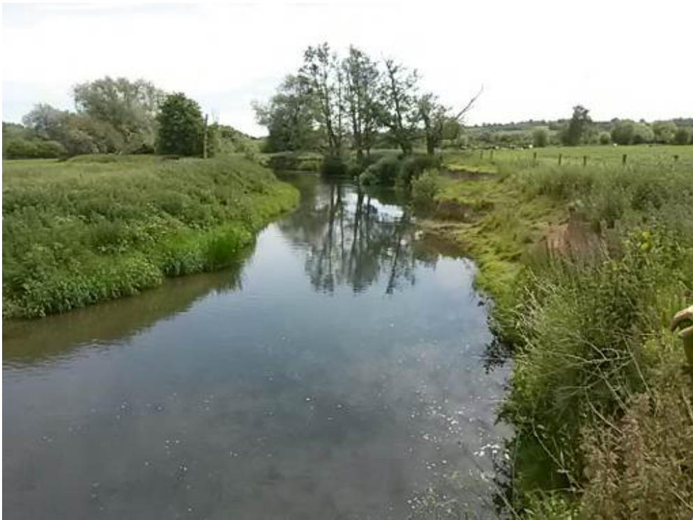
Photo 16 Re-instating the fence at the top of the right bank here would benefit the marginal habitat and improve bank stability (Area 6B).