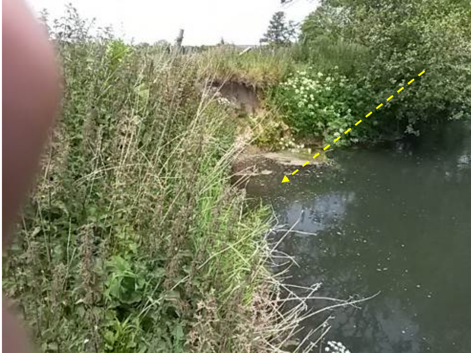
Photo 17 Hinging and staking the tree into this back eddy as indicated would reduce the erosion currently occurring (Area 6B).