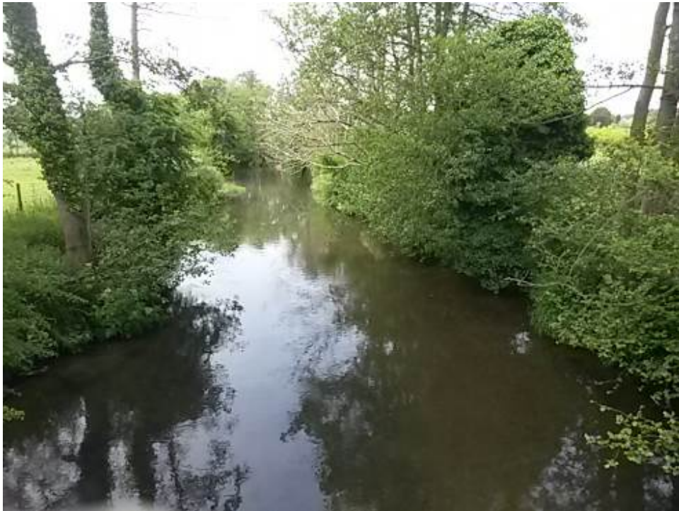
Photo 20 View upstream from Volka Bridge.