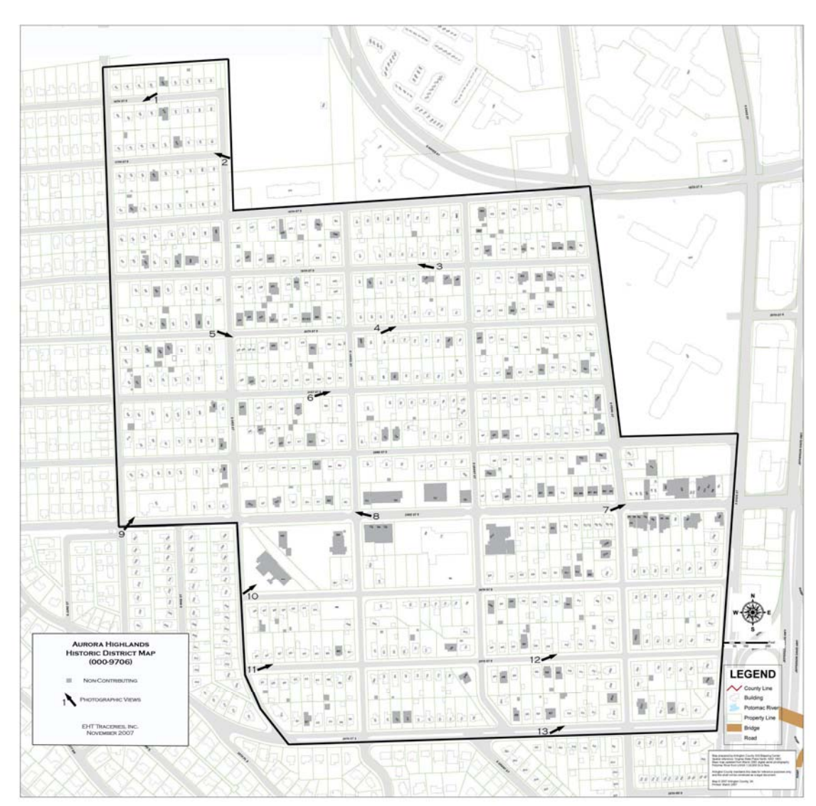
Figure 1: Aurora Highlands Historic District Map

Aurora Highlands Historic District Arlington County, Virginia