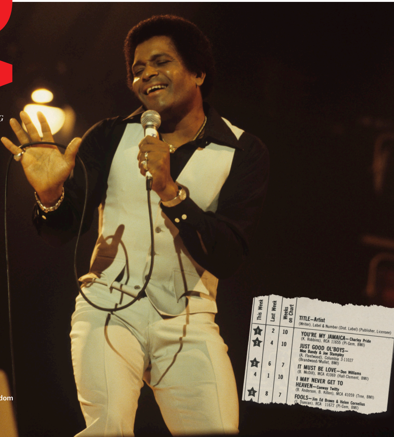
Pride onstage in the United Kingdom in 1978.

Pride signed with RCA Records in 1966 and became the first African-American singer to break through in country. During his career, he has charted 29 Hot Country Songs No. 1s among 52 top 10s. Pride entered the Country Music Hall of Fame in 2000 and, in his 80s, still tours. —JIM ASKER