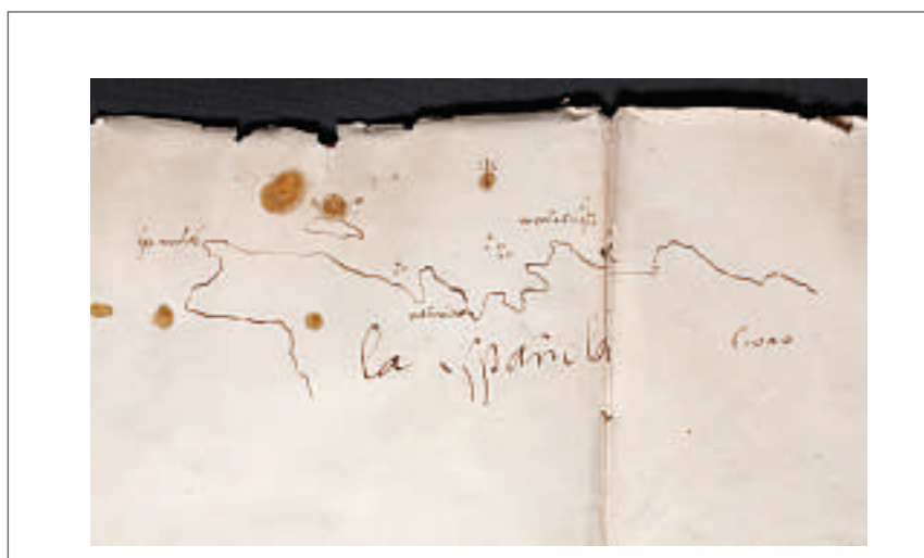
1492. Map of La Española. Paper, covered in parchment. Colección Duques de Alba.