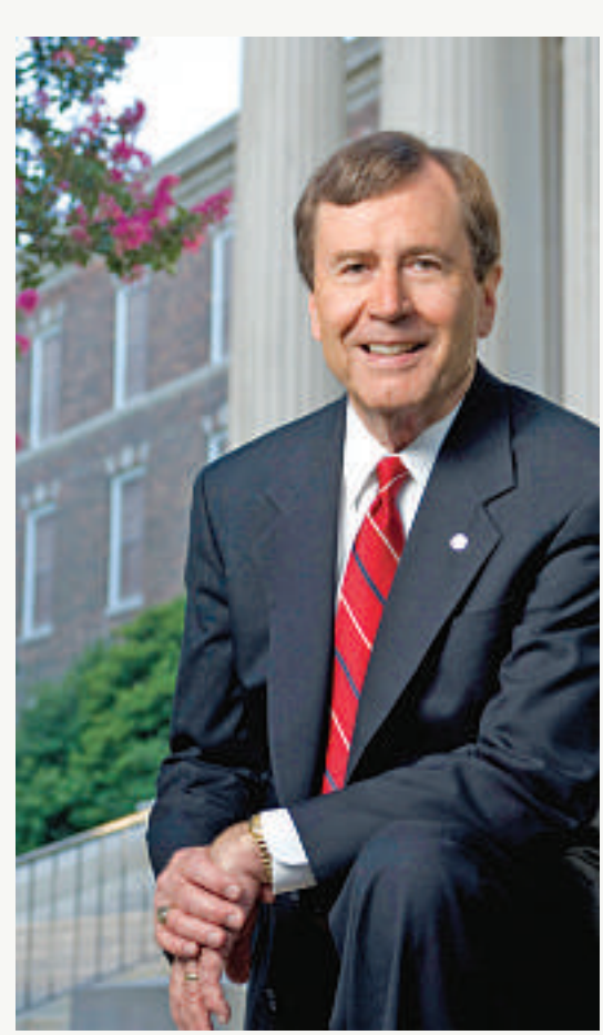
R. GERALD TURNER, SMU PRESIDENT

Our intersection of milestones is indeed something to celebrate, not only for SMU, but also for the region we have served and strengthened since we welcomed our first students in 1915.