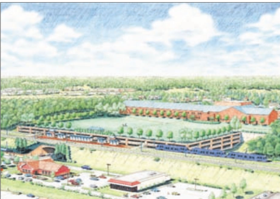
Rendering of light rail station near Sterling Elementary School

CATS' rapid transit development made significant progress during fiscal year 2002. Following the 2025 Integrated Transit/Land Use Plan and the 2010 Center City Vision Plan, CATS is bringing Charlotte's City Center and Corridor vision to life through the development of a five-corridor rapid transit system. This system is an integral part of the regional transit network that will tie together Mecklenburg County, Charlotte's Center City and the region.