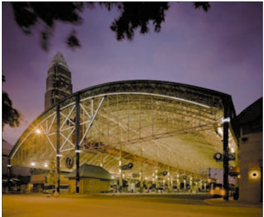
Charlotte Transportation Center