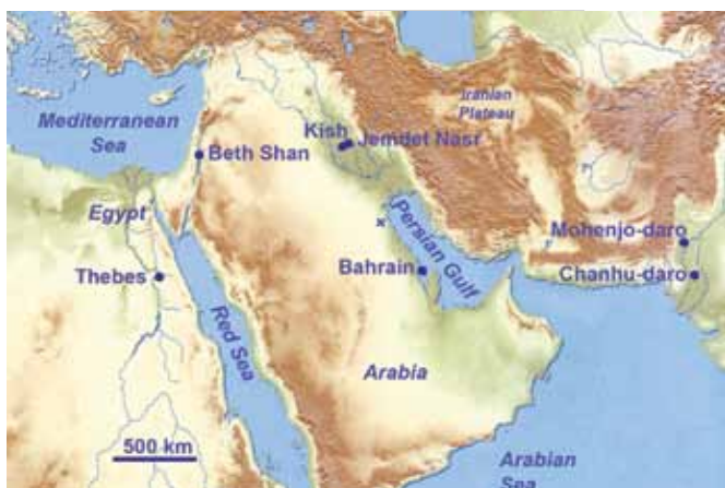
Sites mentioned in the text.

story of a well-trained scholar with a mid-career setback, who became a respected and productive archaeologist.