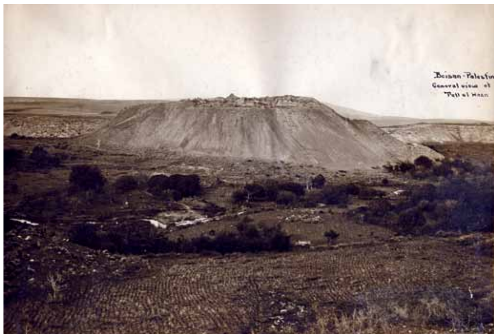
General view of the site of Beth Shan (Scythopolis), at the end of the 1928 excavation season.