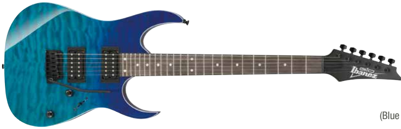
BGD (Blue Gradation)