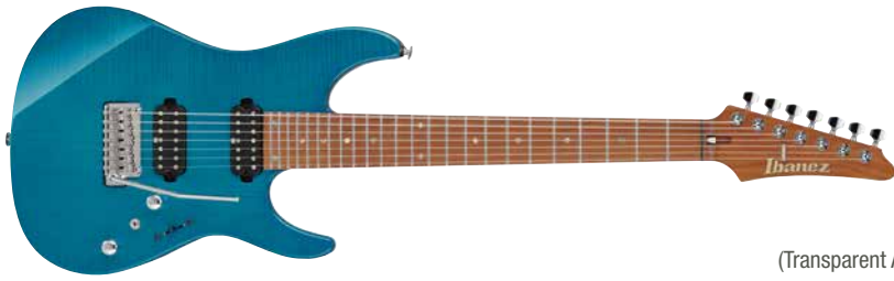
TAB (Transparent Aqua Blue)