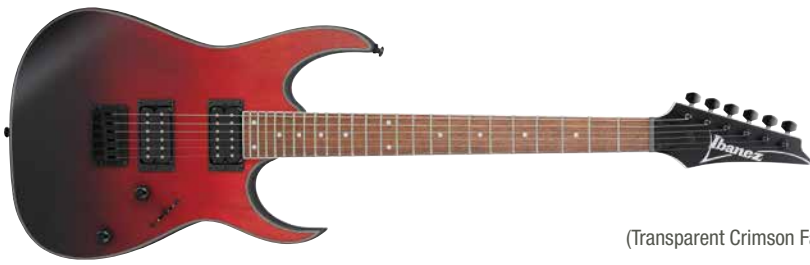
TCM (Transparent Crimson Fade Matte)