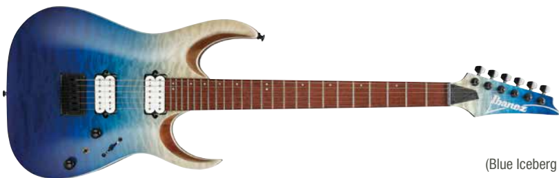
BIG (Blue Iceberg Gradation)