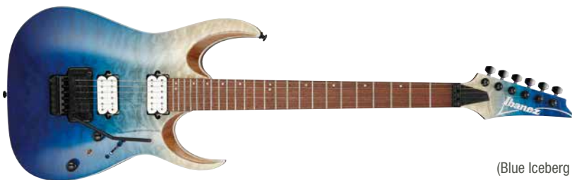
BIG (Blue Iceberg Gradation)