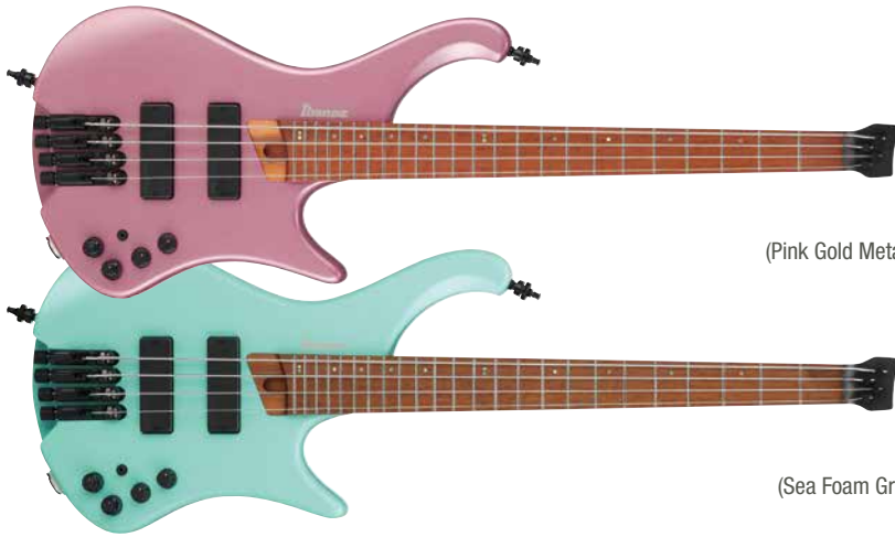
PMM (Pink Gold Metallic Matte)