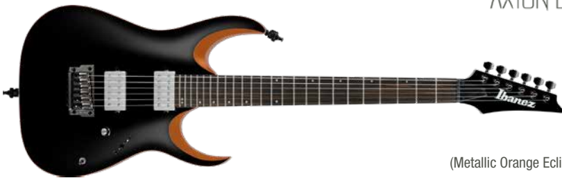
AXION LABEL OEM (Metallic Orange Eclipse Matte)