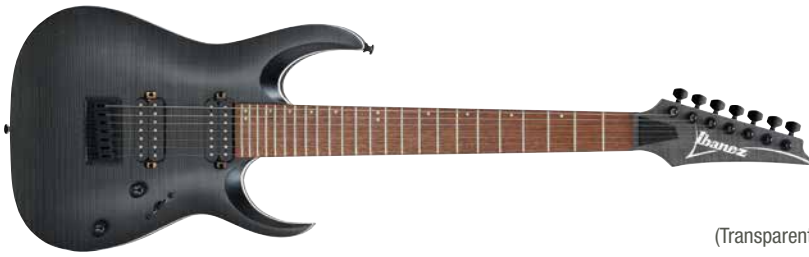
TGF (Transparent Gray Flat)