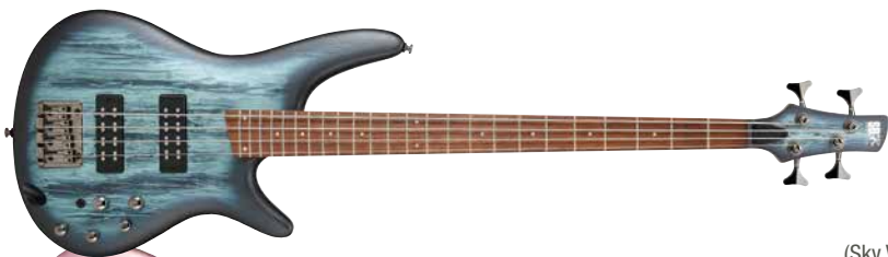
SVM (Sky Veil Matte)