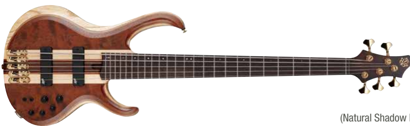
NDL (Natural Shadow Low Gloss)