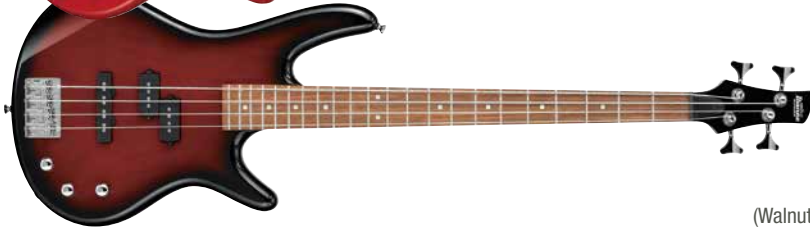
WNS (Walnut Sunburst)