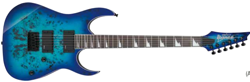
AQB (Aqua Burst)