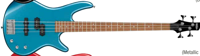
MLB (Metallic Light Blue)