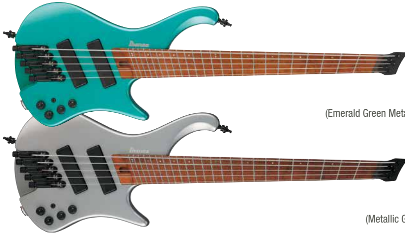
EMM (Emerald Green Metallic Matte)