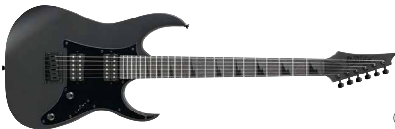
BKF (Black Flat)