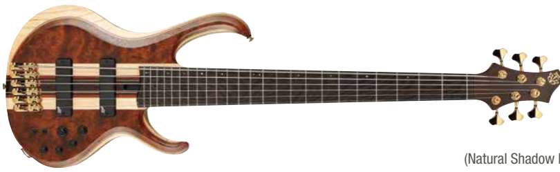
NDL (Natural Shadow Low Gloss)