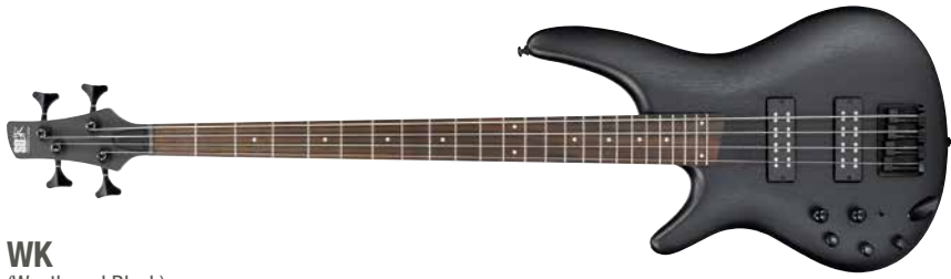
WK (Weathered Black)