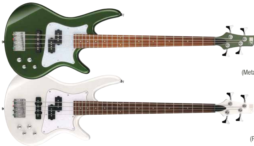
MFT (Metallic Forest)