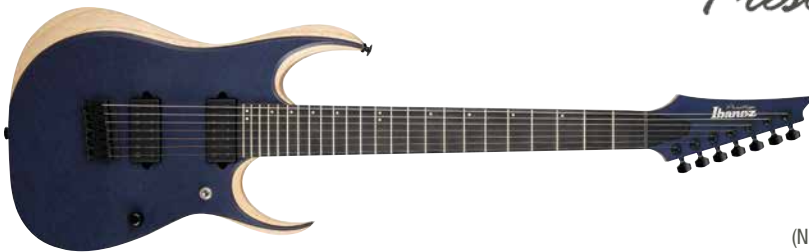
Prestige NTF (Natural Flat)