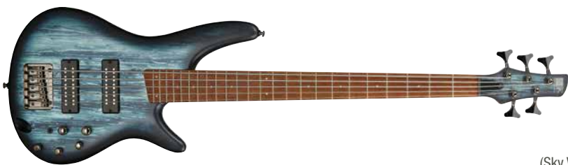
SVM (Sky Veil Matte)