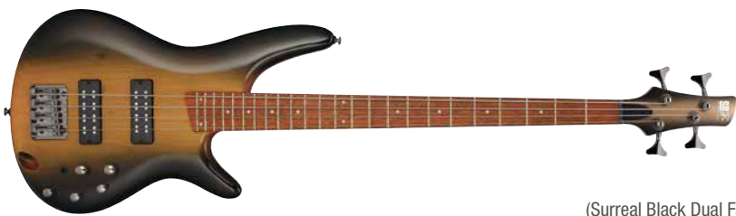
SBG (Surreal Black Dual Fade Gloss)