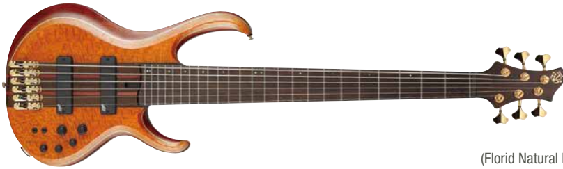
FNL (Florid Natural Low Gloss)