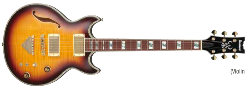
VLS (Violin Sunburst)