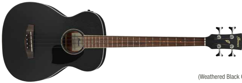
WK (Weathered Black Open Pore)