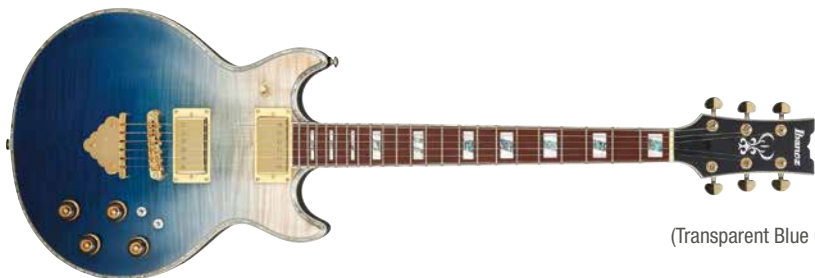
TBG (Transparent Blue Gradation)