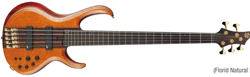
FNL (Florid Natural Low Gloss)