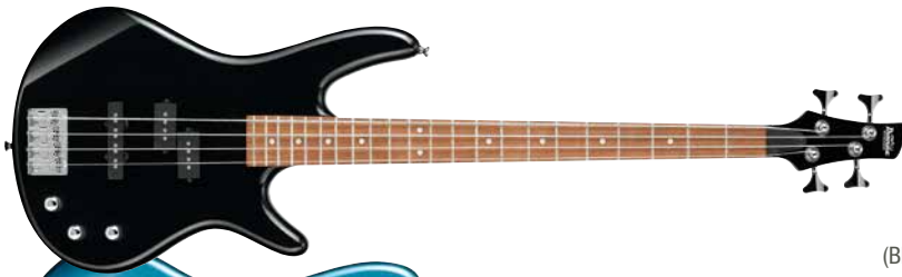
BKN (Black Night)