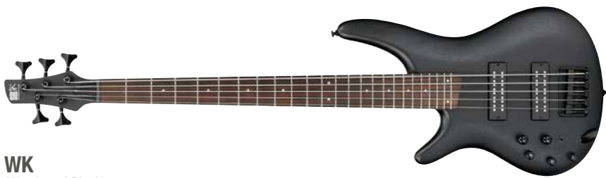
WK (Weathered Black)