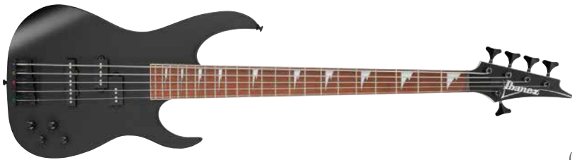
BKF (Black Flat)