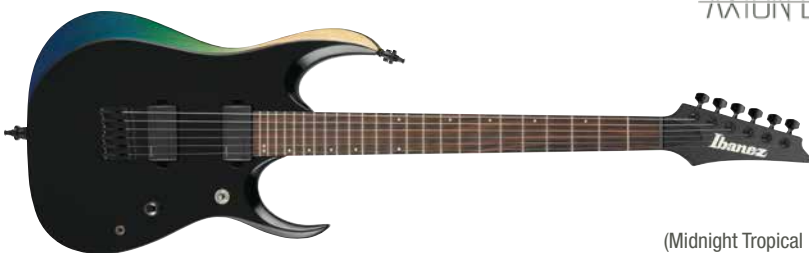
AXION LABEL MTR (Midnight Tropical Rainforest)