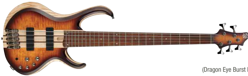
DEL (Dragon Eye Burst Low Gloss)