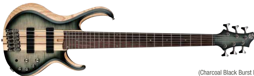
CKL (Charcoal Black Burst Low Gloss)