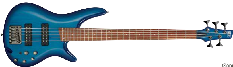
SPB (Sapphire Blue)