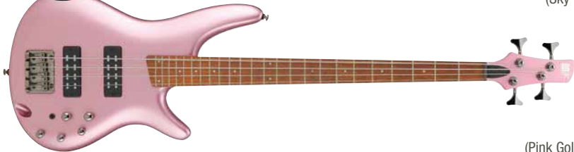
PGM (Pink Gold Metallic)