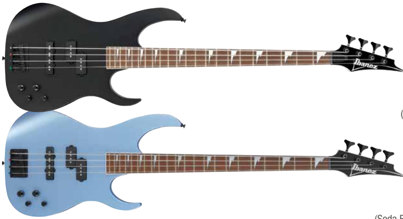
BKF (Black Flat)