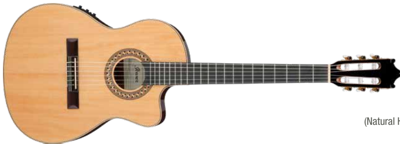
NT (Natural High Gloss)