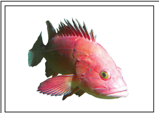
A yelloweye rockfish, one of the groundfish species in serious decline along the Pacific Coast of the United States

While many advocacy media projects strive to persuade “the middle”—those who are undecided on an issue or don't yet see its relevance to their lives—the filmmakers believed this project needed to go even a step farther.