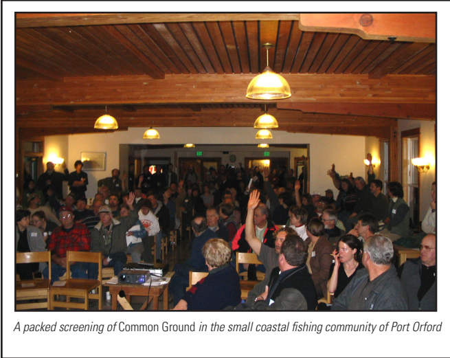
A packed screening of Common Ground in the small coastal fishing community of Port Orford

Just a few months after the Common Ground premieres, the governor appointed new members to OPAC and instructed them to move forward on the issue of marine reserves. This move was met with great optimism though OPAC has been slow in taking action.