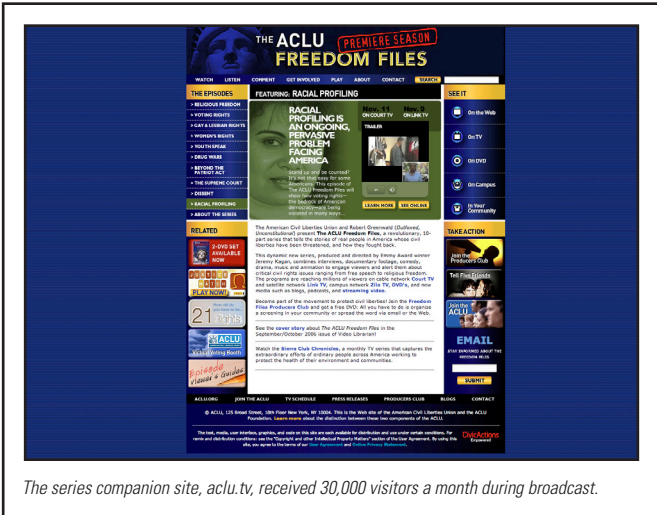
The series companion site, aclu.tv , received 30,000 visitors a month during broadcast.

In the process of creating and distributing Season One, ACLU leaders have learned that they want more than viewers. They want to re-tool the organization’s model in a way that makes it easier for affiliates and partners to move audiences to action.