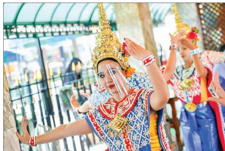
Thai dancers wearing face shields perform at the Erawan Shrine in Bangkok, Thailand, May 4, 2020.

The central bank said manufacturing production declined slightly from the previous month as production in automotive, petroleum, and construction materials dropped in line with the