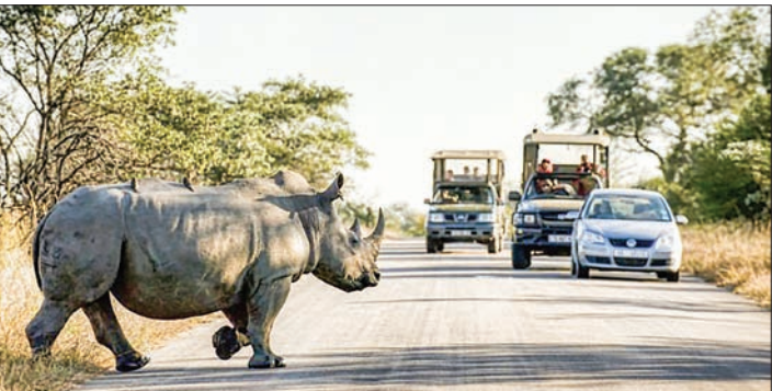
A rhinoceros crosses a road inside Kruger National Park, some 60 km from Nelspruit in South Africa on June 13, 2010.

“It is clear that the multi-disciplinary, integrated approach to investigating illegal wildlife trade is bearing fruit and that effective collaboration with critical role players remains key to our success,” said Creecy. — Xinhua ■