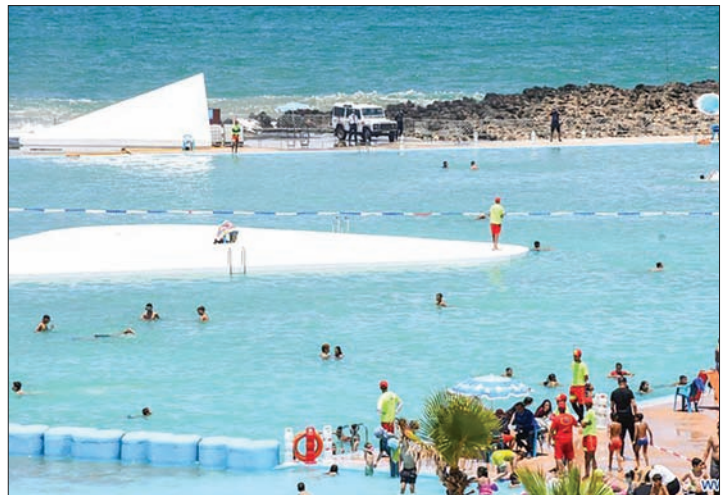
People enjoy summer time at the municipal swimming pool in Rabat, Morocco, on June 22, 2021. The municipal swimming pool of Rabat reopened recently.

The report added that Morocco should tackle some problems that affect the competitiveness of its economy, such as unfair competition, tax evasion, unprofitable subsidies as well as corruption. — Xinhua ■