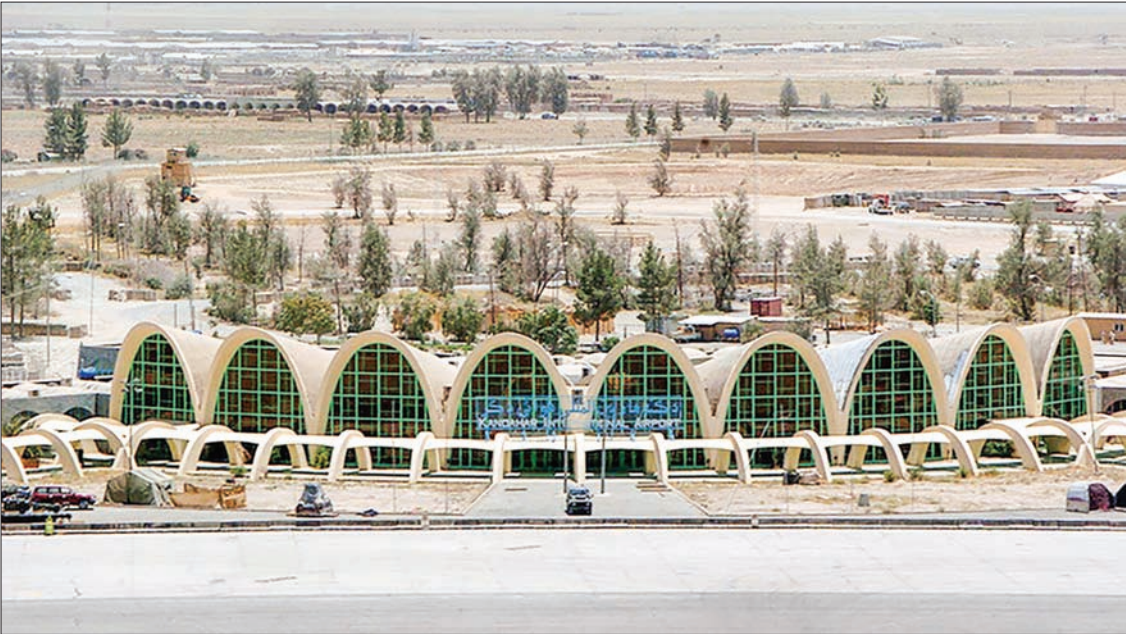
At least three rockets struck Kandahar airport in southern Afghanistan overnight, an official told AFP on Sunday, as the Taliban pressed on with their sweeping offensive across the country.

AT least three rockets struck Kandahar airport in southern Afghanistan overnight, an official told AFP on Sunday, as the Taliban pressed on with their sweeping offensive across the country.