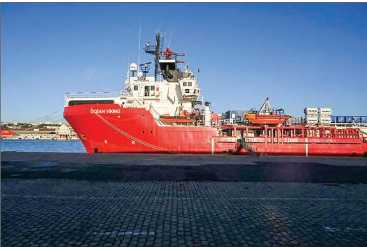
The Ocean Viking on Saturday rescued 196 migrants off Libya, the humanitarian ship’s operator said.

THE Ocean Viking on Saturday rescued 196 migrants off Libya, the humanitarian ship’s operator said.