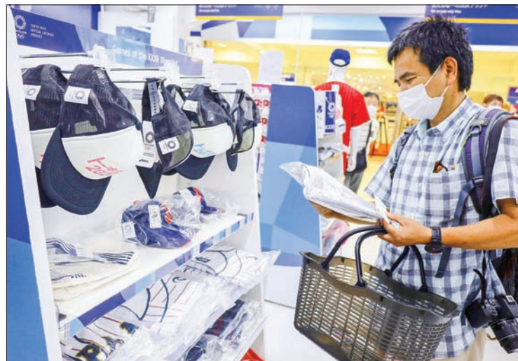
A man picks up a t-shirt at an official shop in Tokyo, July 26, 2021.

AS Japan's impressive medal haul grows, sales of official Tokyo Olympics merchandise such as badges and keyrings have been surging, with fans queuing outside stores to buy them despite mounting COVID-19 infections.