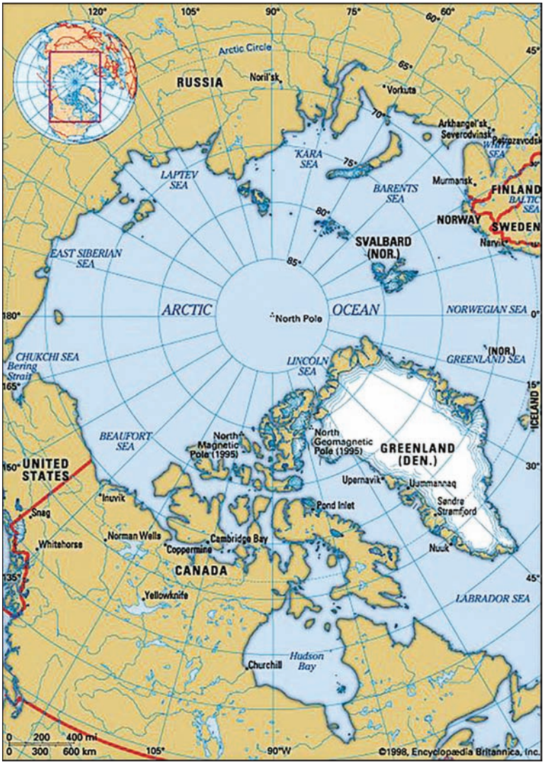
Arctic Ocean