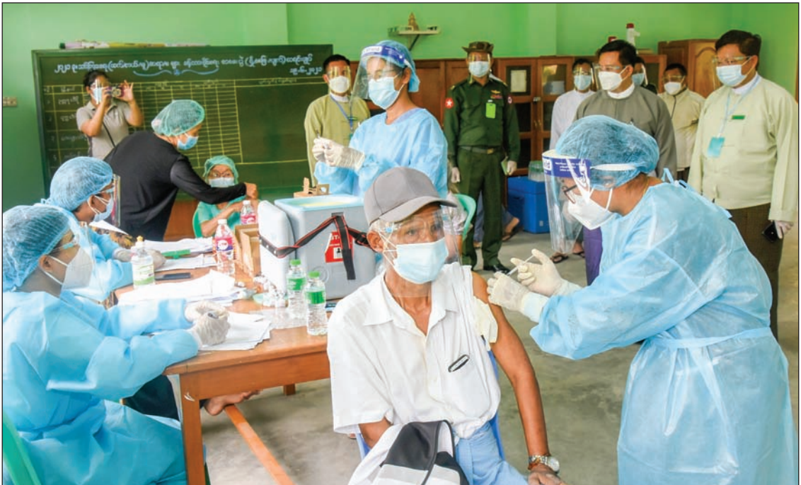
An inoculation programme is launched in Nay Pyi Taw Union Territory.

ple to receive the vaccines was also available at the vaccination areas. In addition, the Myanmar Police Force provided security for the safety of the people. The COVID-19 vaccination is scheduled from 1 to 4 August and will continue to be given to priority groups, although the vaccination period is determined by the population census in each township and the available quotas. The Ministry of Health and Sports is implementing the COVID-19 vaccination drive to reduce the incidence and mortality of COVID-19 in Myanmar as well as to prevent the spread of the disease and reduce impacts on the country's economy due to the outbreak. — MNA