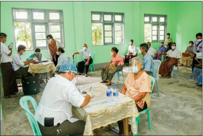
Regions/ States-wise inoculation programme includes senior citizens, including monks and nuns, service personnel and prison inmates. The vaccination was undertaken by the Tatmadaw medical teams, in collaboration with doctors and medical workers from the public hospitals and volunteers.