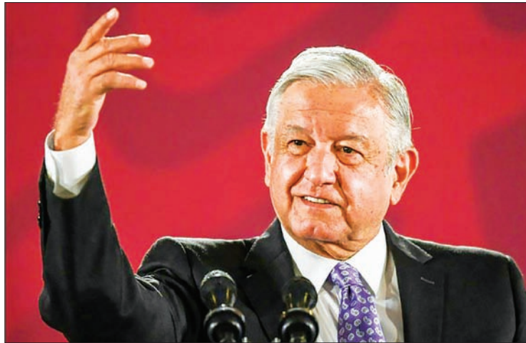
Mexican President Andres Manuel Lopez Obrador has used his daily news conferences to highlight allegations against his predecessors.

MEXICANS vote Sunday in a national referendum promoted by President Andres Manuel Lopez Obrador on whether to investigate and prosecute his predecessors for alleged corruption.