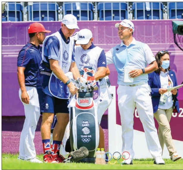
Japan's Hideki Matsuyama (2nd from R) and Xander Schauffele (far L) of the United States exchange words before starting the final round of the Tokyo Olympic men's golf tournament on 1 Aug 2021, at Kasumigaseki Country Club in Kawagoe, Saitama Prefecture, near Tokyo.

Schauffele shot a 67 on Sunday at Kasumigaseki Country Club with five birdies and a single bogey while Sabbatini made two bogeys but still shot an Olympic record 61 to soar 15 places up