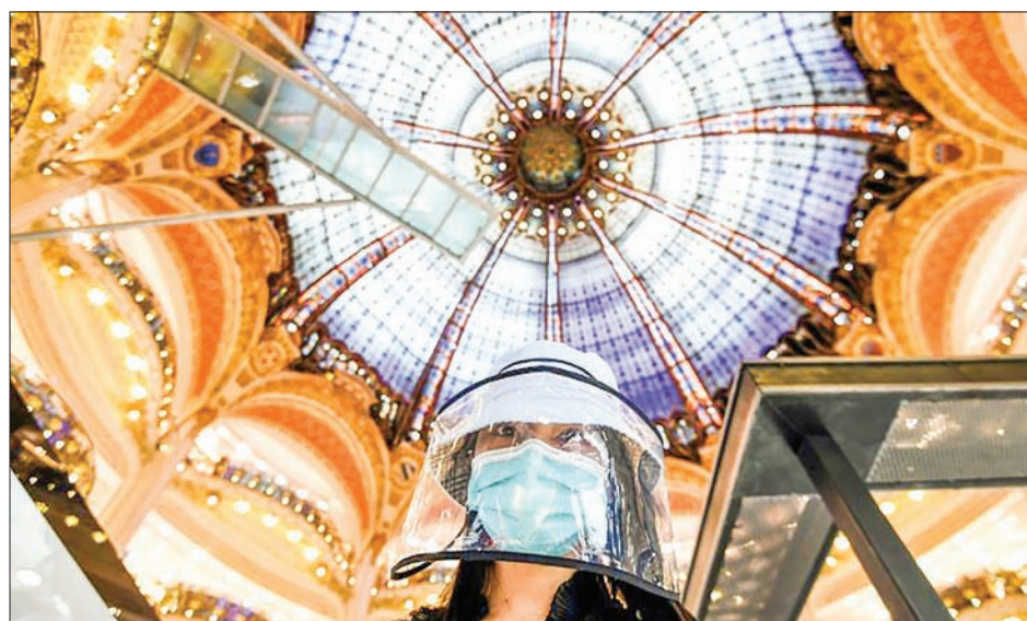
It is the “upper middle class, the rich and ultra-rich untouched by the crisis” who could not travel and instead bought luxury goods, said Arnaud Cadart at Flornoy.

THE luxury sector has flashed back from the Covid-19 pandemic but the crisis is still putting a crimp in travel, a key part of the market.