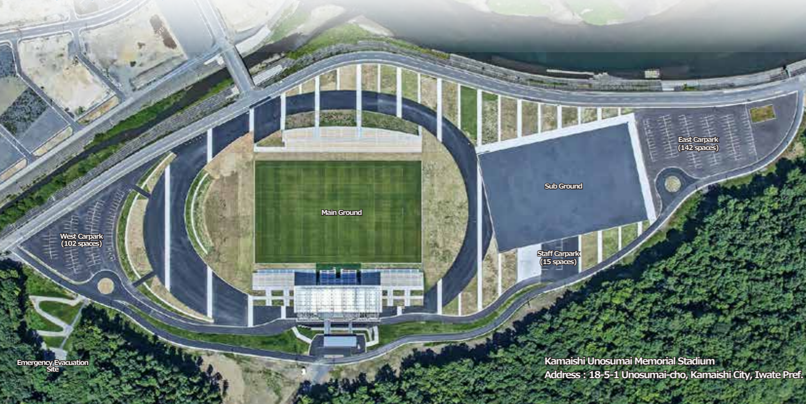
Kamaishi Unosumai Memorial Stadium Address : 18-5-1 Unosumai-cho, Kamaishi City, Iwate Pref.