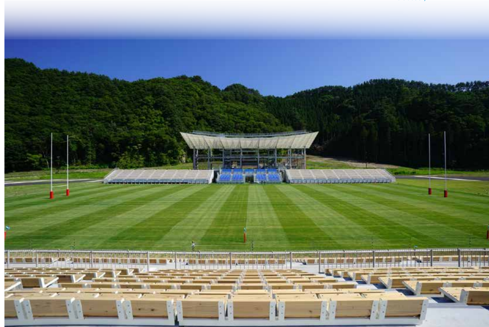
Kamaishi Unosumai Memorial Stadium

この釜石鶴住居復興スタジアムは、スポーツ振興くじ助成金を受けて整備されたものです