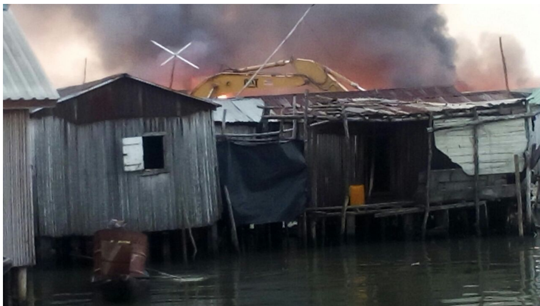
Bulldozer and fire demolishing homes in Otodo-Gbame on 10 November 2016.

Amnesty International saw three videos and 38 photos taken by residents and eyewitnesses on 9 and 10 November 2016 which showed burnt property, burning structures as well as evictees stranded with their salvaged possessions in canoes on the lagoon. One of the videos taken on the morning of Thursday 10 November, showed a bulldozer demolishing a house, fire and smoke could also be seen in the background, while evictees in canoes on the lagoon watched. 82