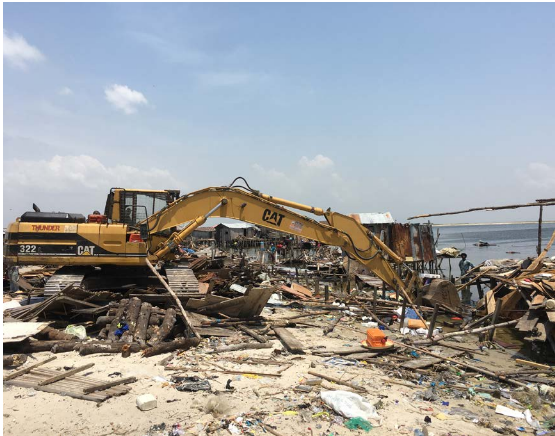
A bulldozer demolishing homes in Otodo-Gbame, during a forced eviction on 17 March 2017.