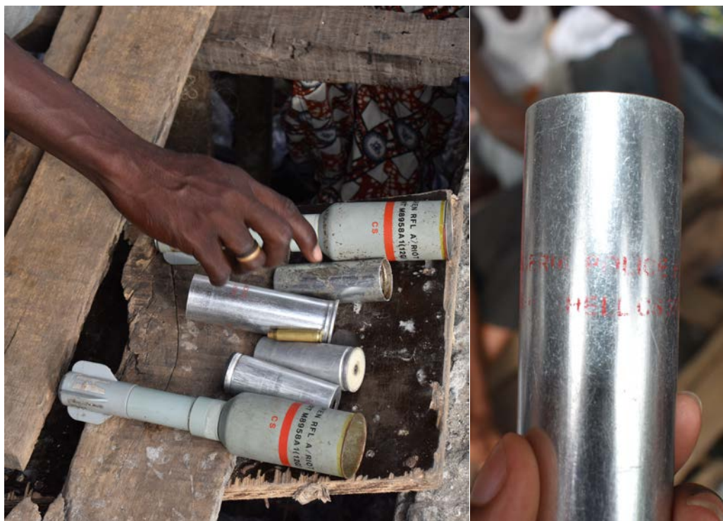
Left: Teargas canisters and a bullet casing found in Otodo-Gbame by evictees, following the March 2017 forced evictions. 27 March 2017