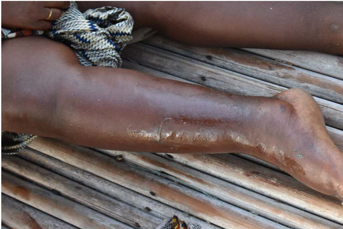
A woman's injured and swollen leg. She told Amnesty International that she sustained the injury when a police officer threw a stick at her leg during the protest against the demolition of Otodo-Gbame on 26 March 2017.

“police beat me with batons on my legs and back. I was beaten till I could no longer walk. The police carried me into their van and took me away. When I was released later in the evening, I still could not walk, someone carried me on his back from the car to my place.” He was walking with the aid of a stick at the time of the interview two days later. 206