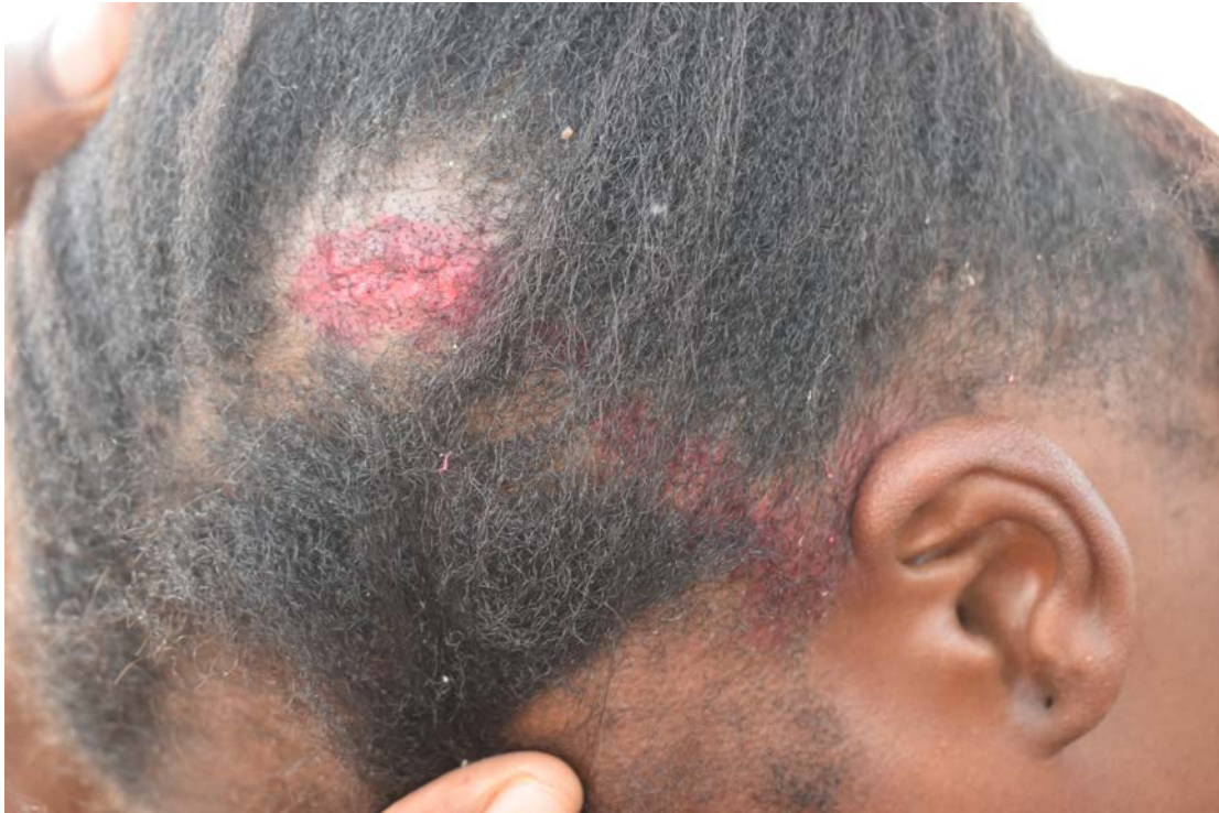
Head injury sustained by a woman resident. She told Amnesty International that a policeman threw a stone at her head on 26 March 2016, during the protest against the demolition of Otodo-Gbame. 28 March 2017

Amnesty International documented 12 cases of assaults of residents by police officers. The majority of the assaulted residents said they were beaten, while a few others said objects were thrown at them, resulting in injuries. Such treatment amounts to excessive use of force which should be punishable as a criminal offence. The residents were protesting to prevent the demolition of their homes.