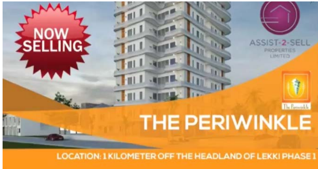
Advertisement for an elite real estate project on Otodo-Gbame land. Screenshot from a marketing video for The Periwinkle estate. 138