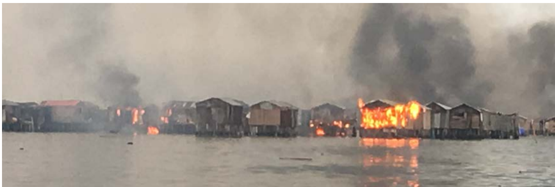
Houses in Otodo-Gbame set on fire during the forced eviction on 9 April 2017.

“My house was burnt on the morning of 9 November, around 8 or 9am. When I heard the noise, I tried to pack my children out into the canoe, so I went back to get some of our things, but three policemen were by my house and it was already burning. They had 25 litres keg of [liquid assumed to be] petrol, a lighter and their guns. I could not take a thing.”