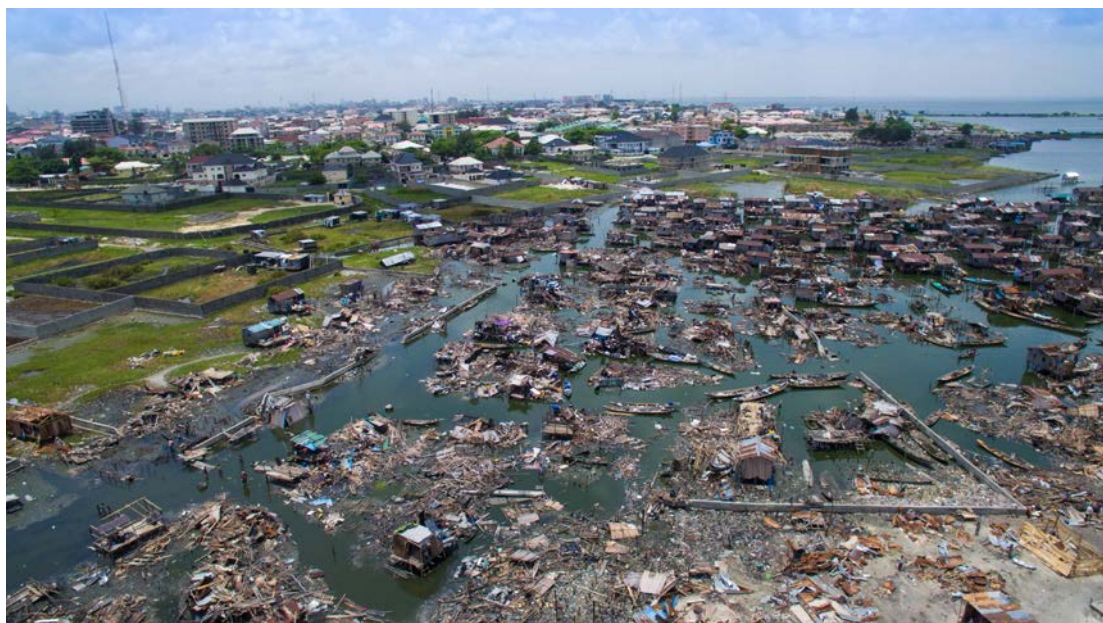
A section of Otodo-Gbame littered with demolition debris, while some houses remain intact. This picture was taken on 23 March 2017, after the forced evictions on 17 and 21 March 2017.