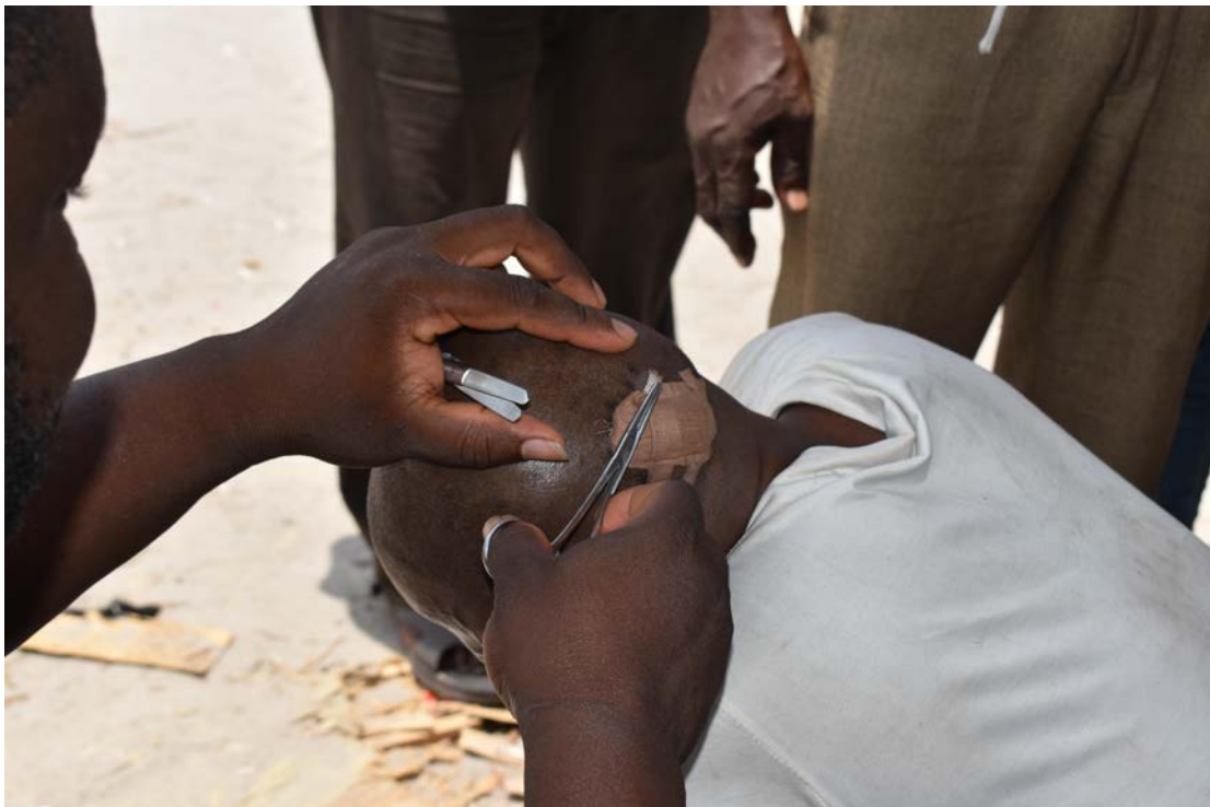
A volunteer aid worker dressing a head injury of a woman in Otodo-Gbame Community, 28 March 2017

A volunteer aid worker provided medical aid to Otodo-Gbame evictees who sustained injuries during the evictions and attacks because the community's hospital was demolished in November 2016, depriving them of access to healthcare. 303