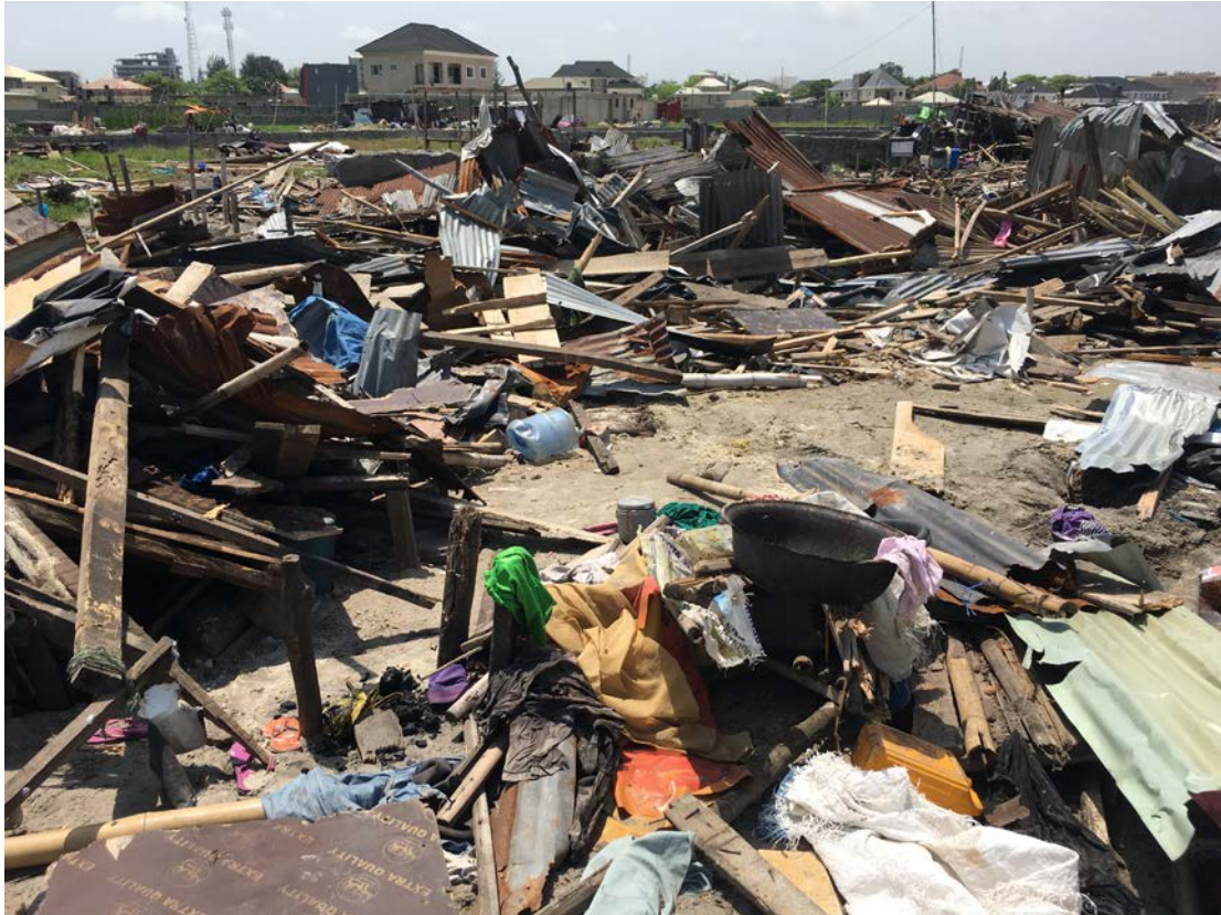
Aftermath of the forced eviction in Otodo-Gbame community, on 17 March 2017.

Four months later, without any prior notice or consultation, on 17 March 2017, the Otodo-Gbame residents were again forcibly evicted. Amnesty International interviewed 18 evictees who all said that their homes were demolished with bulldozers accompanied by police, army and other men armed with machetes, axes and guns. They further said that the police were shooting live ammunition and teargas to chase residents away. 88