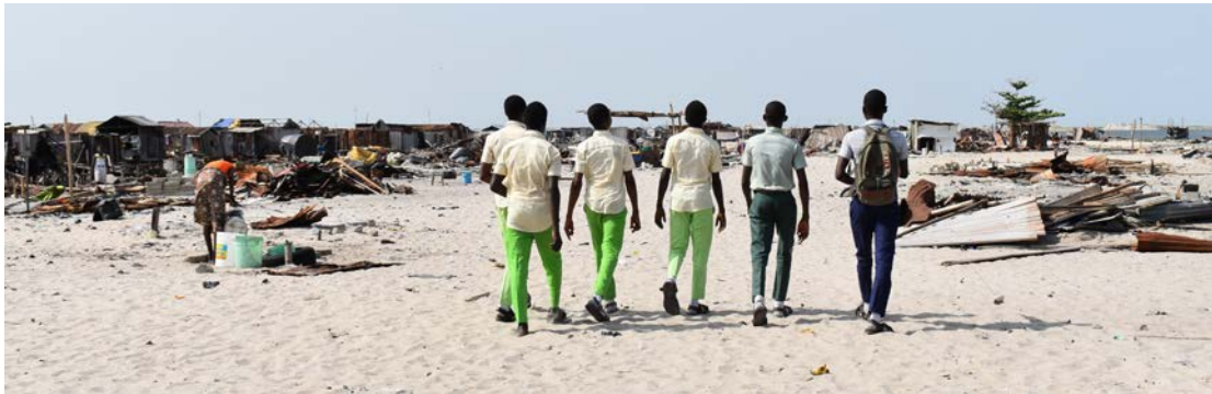
Students return from school to their demolished homes in Otodo-Gbame in Lekki area of Lagos. 27 March 2017

“I have not gone to school because of what happened, since about two weeks ago. My books, school uniforms, and stationery have been soaked by rain. Now that I don't have the opportunity to go to school, I always go with my daddy to fish... I worry that since I haven't been to school for these many days, I would be behind on my notes and lessons and that when I get to school and explain to my teacher [she or he] may not believe me, and will start beating me. When I think of this, and I cry and tell my daddy.”