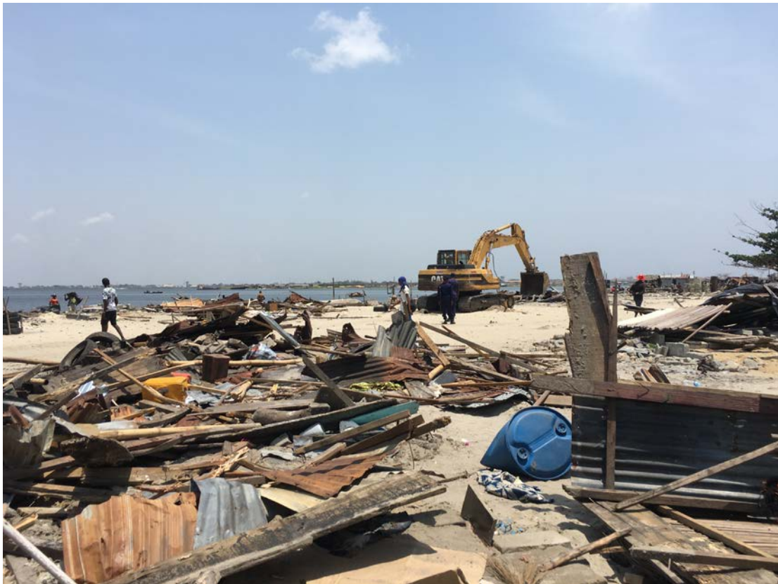
A bulldozer demolishing homes in Otodo-Gbame on 17 March 2017.

State Environmental Sanitation Enforcement Agency (Taskforce), army and other armed men, returned with a swamp buggy, to demolish more structures on the water. 93