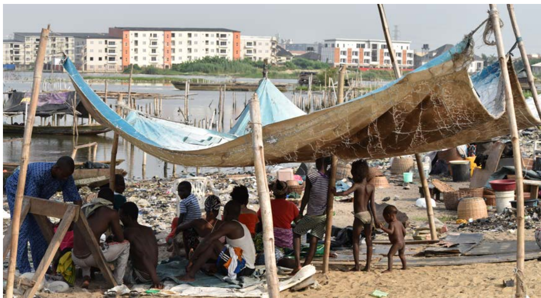
Ilubirin evictees sitting under a flimsy structure. They told Amnesty International that they also sleep here. 14 December 2016.