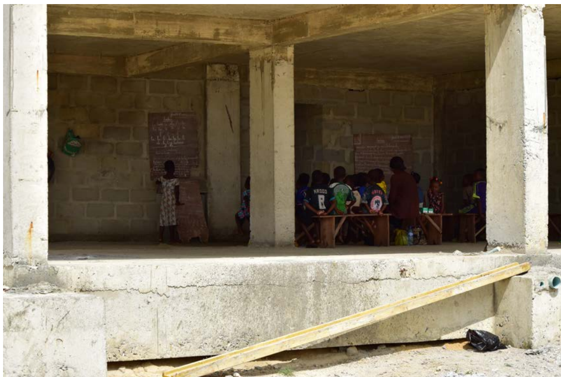
Ilubirin children taking lessons in one of the government's under-construction buildings. The classes moved here after the school it was demolished in November 2015. 19 May 2016