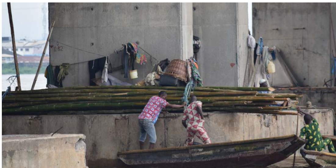
Ilubirin evictees living under a bridge in Lagos. 8 July 2017

“We are many living under the bridge, we are staying under five pillars, and there are about 20 people under each pillar. Women cannot stay here, that is why I asked my wives and children to go to Sabo Koji [Amuwo-Odofin Local Government Area of Lagos]”. 243