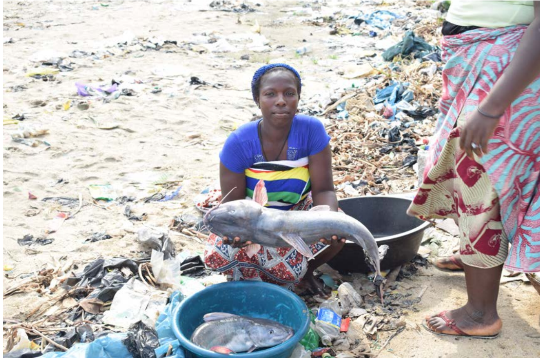
A woman forcibly evicted from Ilubirin displays her fish for sale. 26 October 2016

“...we would display the fish on land and people would buy, our wives would also start smoking the fish. When our wives are done smoking, people come from upland and faraway places to buy. But now, we don't have the space to do all that, because the police don't give us the chance. To be able to do our business [as usual], we need to have space to smoke the fish on land, we cannot smoke the fish in the canoes. Now, when we bring the fish, we sell them at giveaway prices, so we no longer make profit.” 253