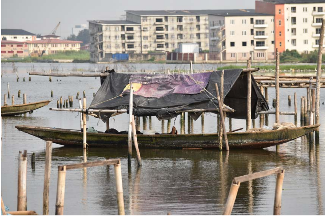
An Ilubirin evictee sleeping in a canoe with a tarpaulin roof. 14 December 2016

“Last night [25 October 2016], when we feared there might be a storm on the water, because of the very powerful wind, we had nowhere to run to, we were afraid the police would arrest us. The canoes we sleep in are small [and can easily capsize].” 242