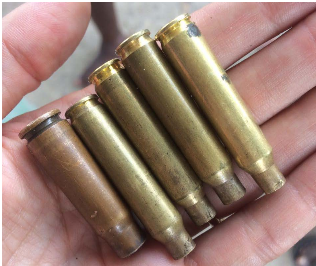
Bullet casings found in Otodo-Gbame on Sunday, 26 March 2017

Under the UN Code of Conduct for Law Enforcement Officials (Article 3) and the UN Basic Principles on the Use of Force and Firearms by Law Enforcement Officials (Basic Principles on Use of Force), police must seek to avoid the use of force, and far as possible apply non-violent means before resorting to the use of force, which they may use only if strictly necessary and to the extent required for the performance of their duty. Basic Principle 9, which reflects the international law obligation to respect and protect the right to life, provides that police must not use lethal force (firearms) unless it is strictly necessary to defend themselves or others against the imminent threat of death or serious injury or to prevent a grave threat to life. Firearms should never be used to disperse people and indiscriminate firing into a crowd is always unlawful. 183 Firearms must never be used as a tactical tool to chase people out of their houses during demolitions. They may only be used to save another life in line with Basic Principle 9. When policing crowds, teargas may only be used for the purpose of dispersing the crowd in a situation of more generalized violence.