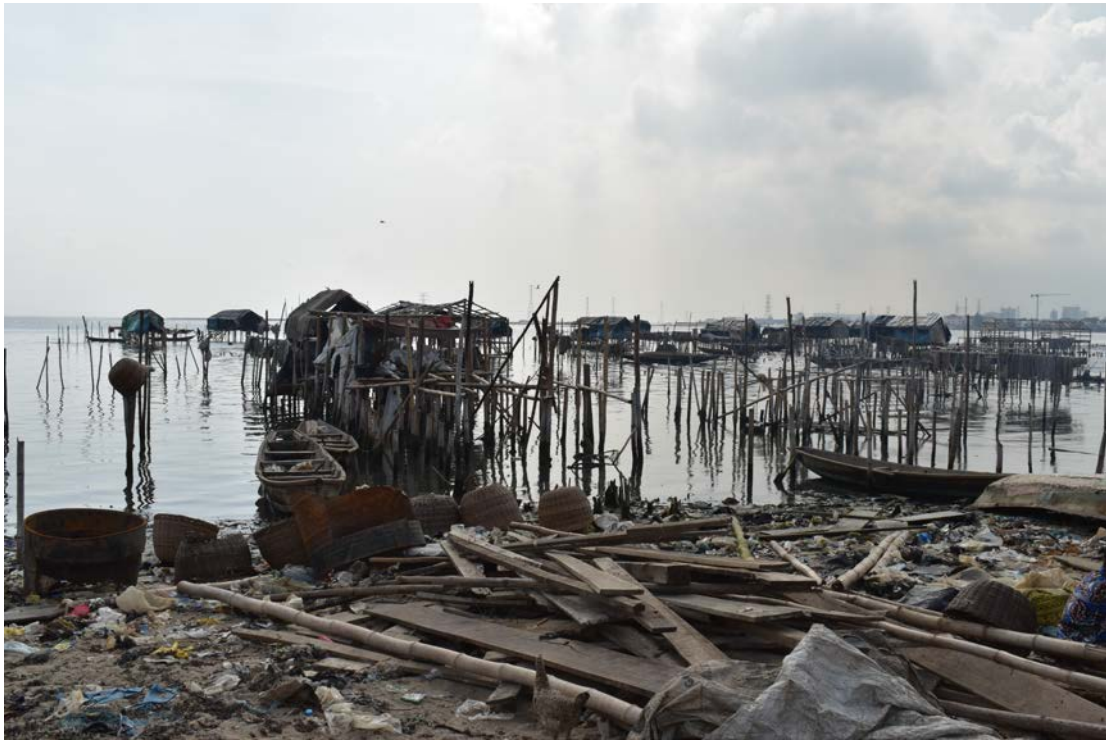
Some of the structures demolished during the forced eviction of 19 March 2016. 19 May 2016.