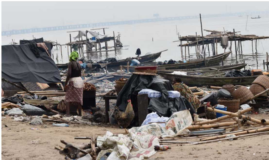
Ruins of demolished homes in Ilubirin, after the forced eviction of 26 September 2016. Evictees rebuilt some of their homes and continued to live in the area. 1 October 2016.

All five evictees interviewed by Amnesty International said that apart from this oral notice from KAI, no written notices were served. They further said that on eviction day, the Taskforce officials (another environmental agency, different agency for KAI) gave them one hour within which to move out their properties, and then demolished all their structures. 126 When Amnesty International visited the community on 1 October 2016, researchers, observed that, as previously, the evictees had returned and rebuilt their houses. There were still some demolished structures, which had not been reconstructed.