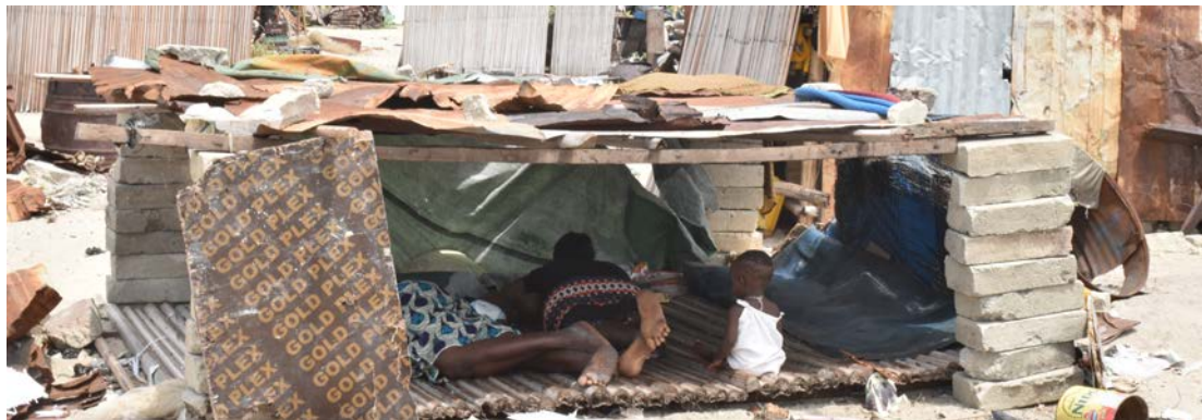
Two women and their two babies who lost their homes in Otodo-Gbame, during forced evictions in November 2016 and March 2017, take refuge under a makeshift structure. 5 April 2017