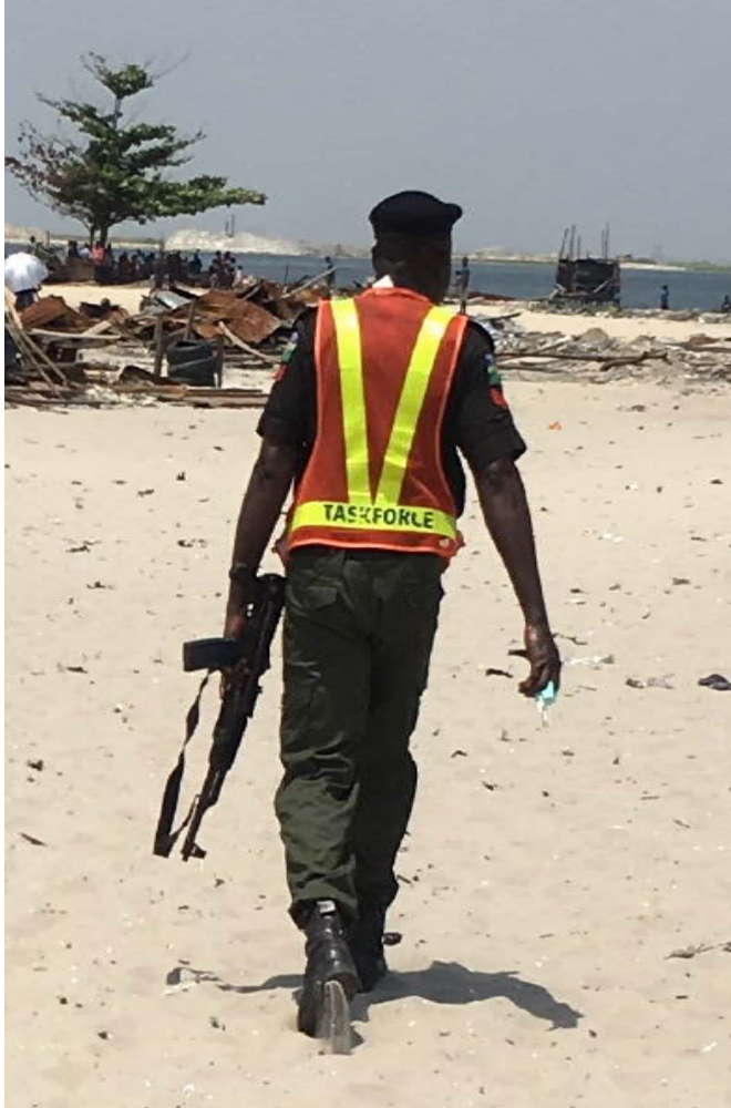
A Police officer wearing a Taskforce vest in Otodo-Gbame community, during the forced eviction of 17 March 2017

Some of the police officers who took part in those forced evictions arrived in the community as part of the Lagos State Taskforce team. 169 However, at an earlier meeting with Amnesty International on 17 February 2016, the Lagos State Commissioner of Police had told Amnesty International that the police do not carry out evictions. He stated that their duty was only to provide security and ensure that there was no breach of peace or violations of rights during evictions. 170