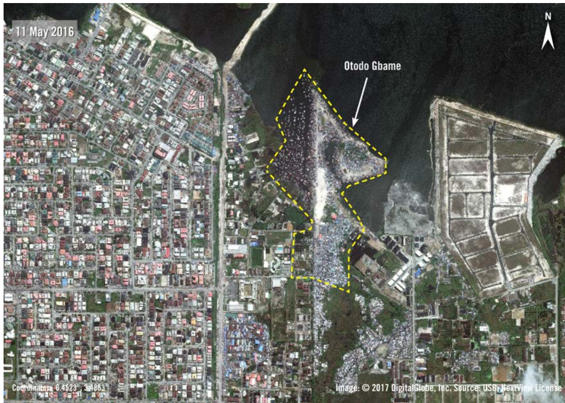
Satellite image of Otodo-Gbame taken on 11 May 2016.

The Otodo-Gbame community, home to at least 30,000 people, 59 was an informal settlement at the edge of the lagoon, in the Lekki area of Lagos. Evictees told Amnesty International that the community had existed for over a century. The oldest person interviewed by Amnesty International was 79 years old, and said she was born in the community. 60