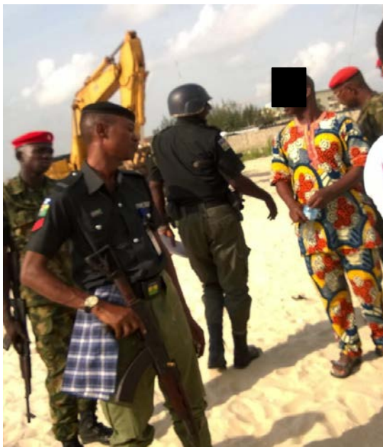
Armed officers of the Nigeria Police Force and the Nigerian Army in Otodo-Gbame during the forced eviction of 17 March 2017.

During the three forced evictions in Otodo-Gbame community on 9 to 11 November 2016, 17 and 21 March 2017, and 9 April 2017, the police appear to have played a leading role in chasing people out of their houses and in demolishing structures in the community, while also resorting to the unlawful use of force. Residents also reported that there were attacks on communities by armed men, with the police failing to intervene, and reports of armed men joining the police during forced evictions.