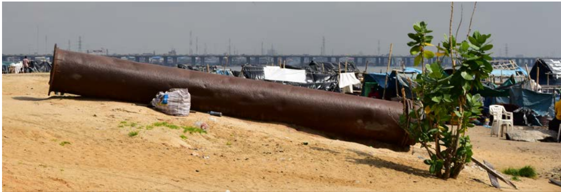
A pipe in Ilubirin community where evictees often sheltered their children during heavy rains. 19 May 2016.

“when this [forced eviction] happened, I put the children in this thing [a big pipe] when the heavy rain was falling, I stayed in the rain”. 298