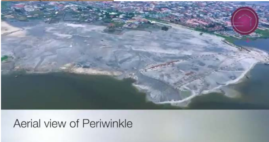
Aerial view of the Periwinkle estate project located on Otodo Gbame land. Screenshot from a project marketing video. 143