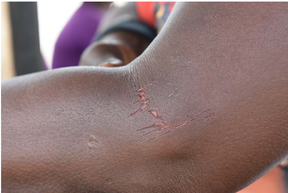
A woman's bruised elbow. She told Amnesty International that on 26 March 2017, she was beaten by police for protesting the demolition of her community. 28 March 2017.

“Police beat me with guns and sticks. There were many of them, one slapped me, another kicked me, another hit me with his gun butt. They tried to put me in their vehicle, and I resisted. They dragged me, I was crying, shouting, cursing them, so they finally left me. My whole body was aching, some parts were swollen.” 204