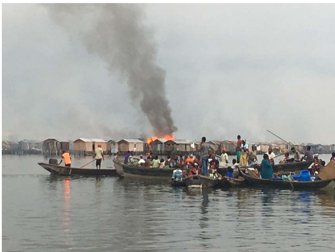
Otodo-Gbame evictees stranded on the Lagoon, watching their homes burn during the forced eviction on 9 April 2017.