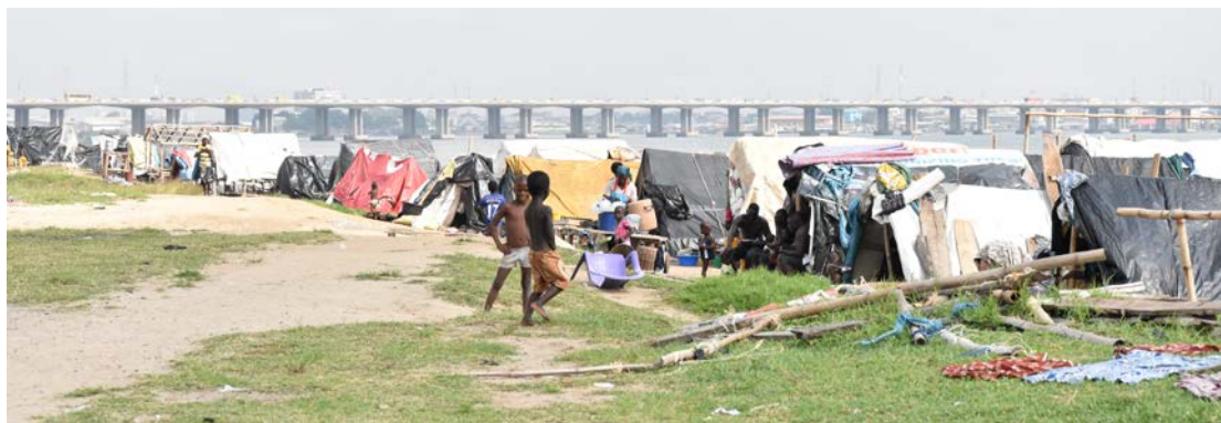
Some of the structures rebuilt by Ilubirin residents who continued to live in the area after the forced eviction of 19 March 2016. 19 May 2016.