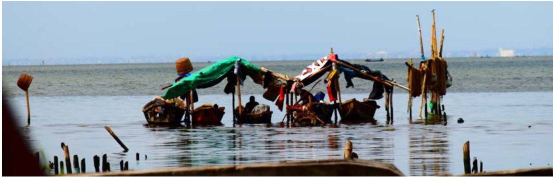
Canoes with makeshift roofs over them being used as shelter by evictees from Ilubirin community. 31 March 2017

one or more of the forced evictions. They were either sleeping in canoes, out in the open living with relatives and friends, or living under flimsy structures made of sticks and plastic sheets.