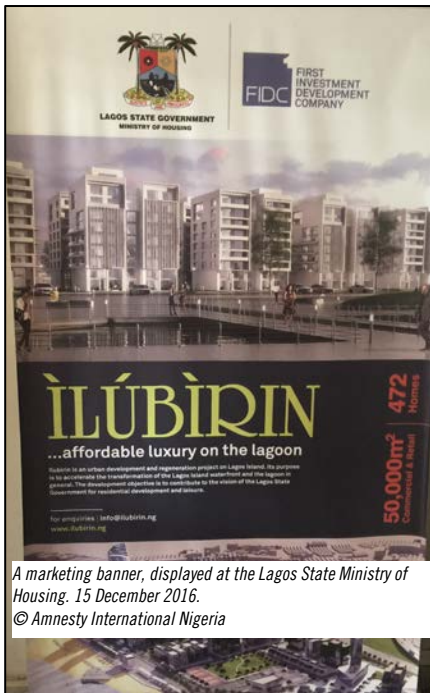
A marketing banner, displayed at the Lagos State Ministry of Housing, 15 December 2016.