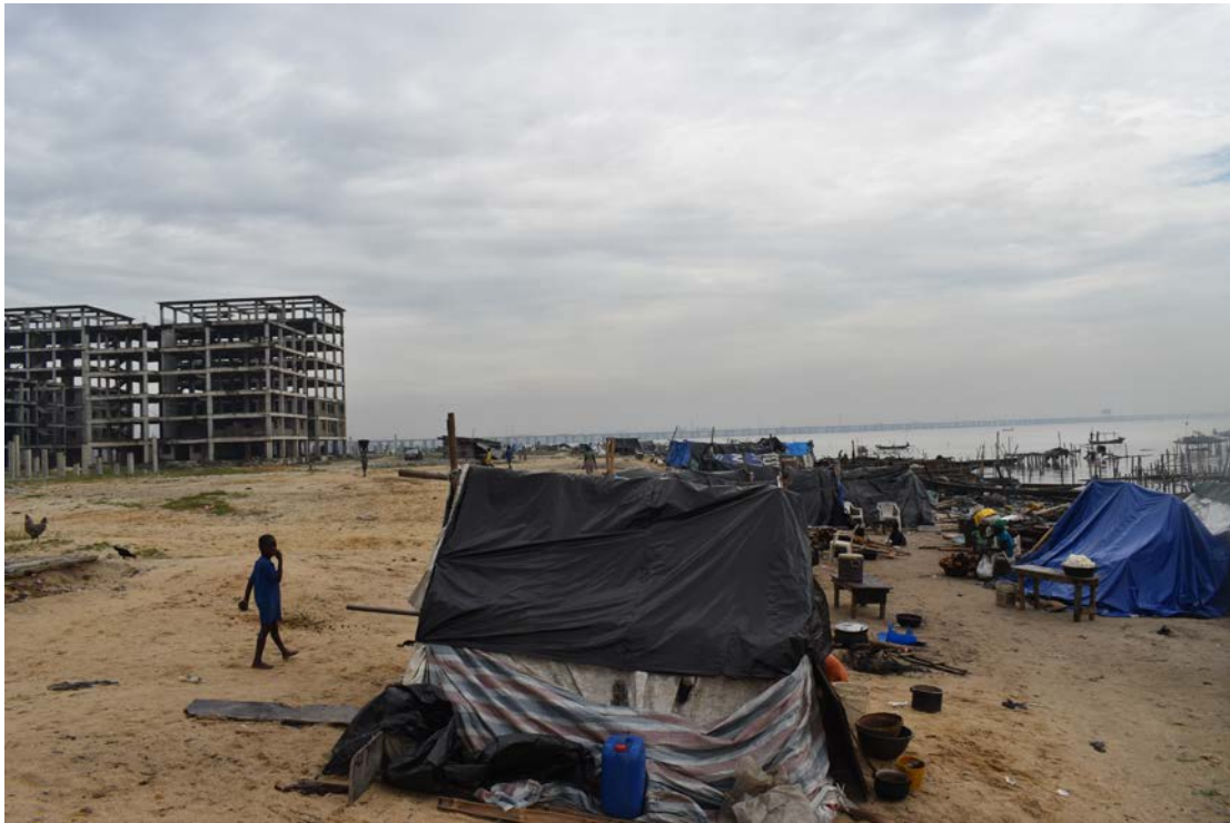
A section of Ilubirin community, with the under-construction government real estate project in the background. 1 October 2016.

The Ilubirin fishing community is home to hundreds of mainly fishers and their families. It is located at the edge of the Lagos lagoon near high-end business districts, in Lagos Island. Structures in the community were constructed mostly with plastic sheets and sticks. 107 The government did not provide any services or infrastructure, such as sewage disposal, potable drinking water and electricity, to Ilubirin. The residents provided electricity for themselves (using portable generators). They used the lagoon for sewage disposal and purchased drinking water. 108 By 17 November 2015, the community had an estimated 823 residents 109 and 222 structures (168 residences, 41 businesses, 10 bath houses, 1 school and 2 churches). 110