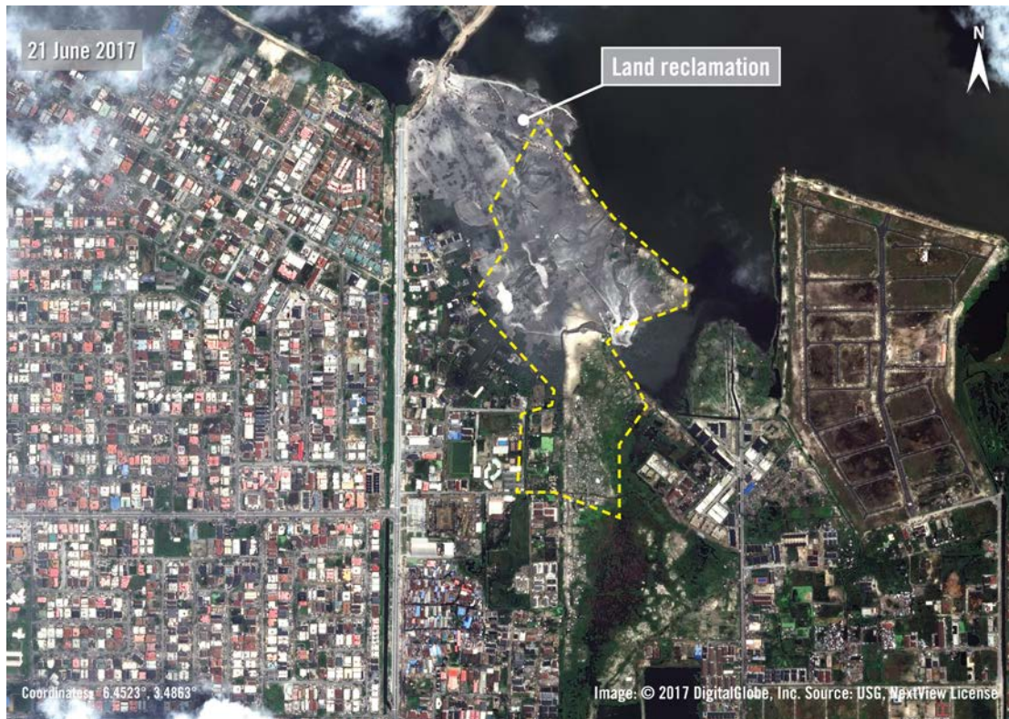
Satellite image of Otodo-Gbame after land reclamation exercise to expand the area for high-end real estate projects.