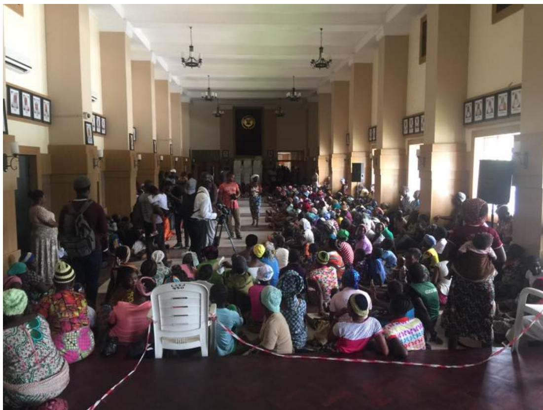
Some Otodo-Gbame evictees awaiting the court decision on the contempt proceedings filed against Lagos state authorities. 12 April 2017

On 21 June 2017, the Court found in favour of the applicants and held that evictions without resettlement are unconstitutional, while also restraining the government from further forced evictions and ordering it to consult with affected residents and evictees with a view to resettling them within the state. 156 On 28 June 2017, Lagos State announced that it had filed an appeal against this decision which at the time of writing is still pending. 157