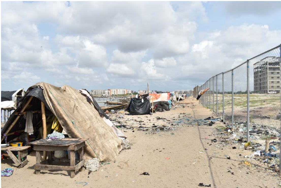
Five months after the October forced eviction, several Ilubirin evictees resettled at the edge of the lagoon, and just outside the fence constructed to keep them away from the land they occupied. 31 March 2017

On 31 March 2017, three residents told Amnesty International that those who returned to live near the shoreline had not been disturbed since the last eviction. But as the returned residents feared further evictions, they only built temporary structures.