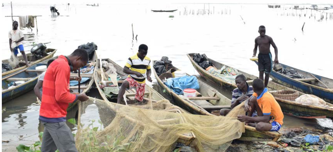
Fisher people evicted from Ilubirin. 26 October 2016

The CESCR has noted that the right to work