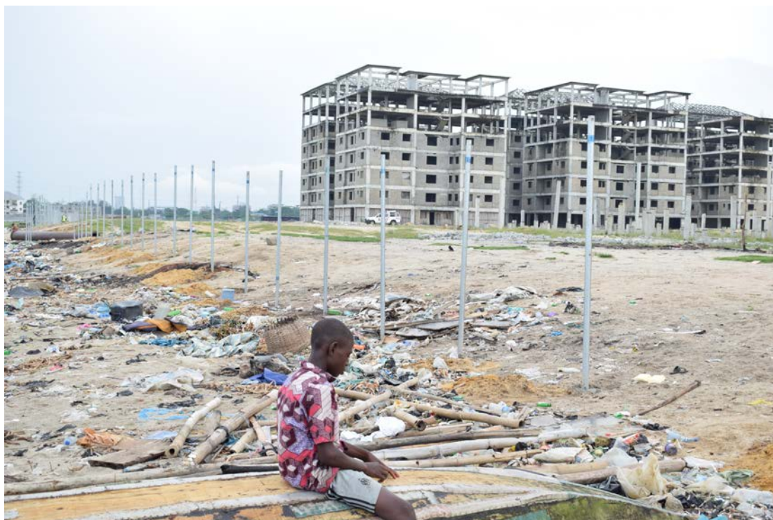
A boy sits on a canoe in the place where his home used to be in Ilubirin community. All the structures in this community were demolished on 15 October 2016. 26 October 2016