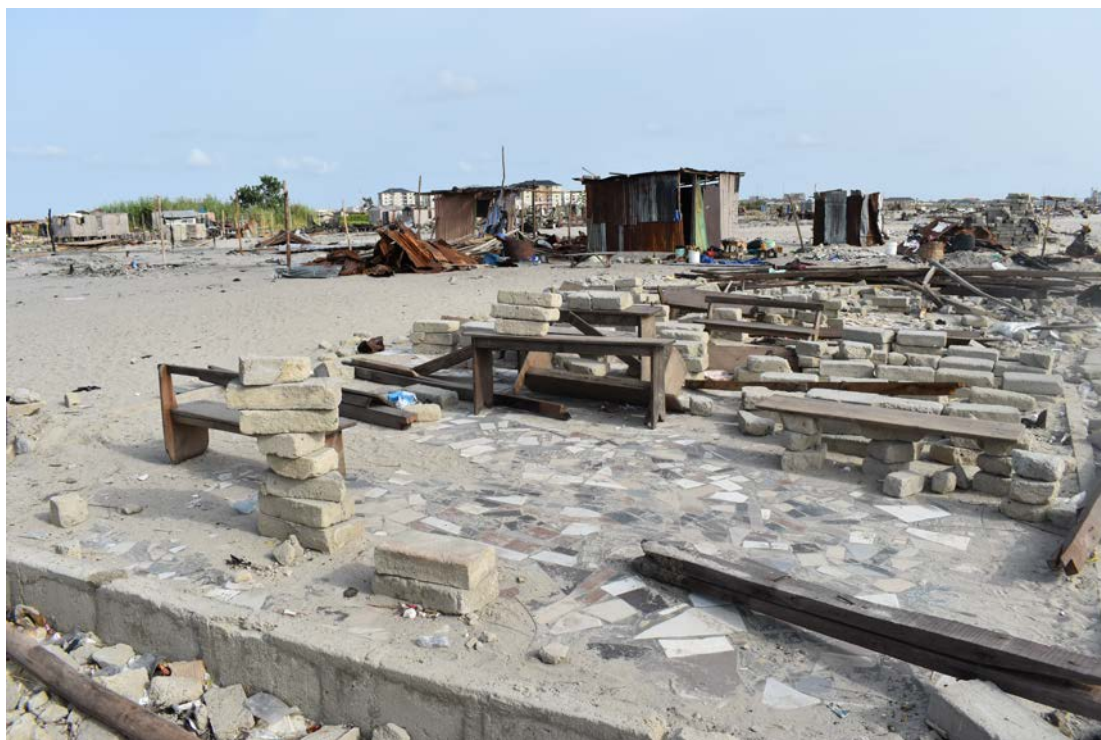
The ruins of a demolished school in Otodo-Gbame community. 27 March 2017