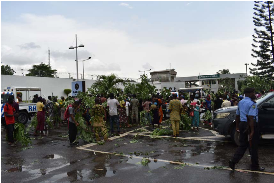
Some Otodo-Gbame evictees protesting against the forced evictions at the Governor’s office, Ikeja, on 12 April 2017.

Again, on 12 April 2017, evictees staged a peaceful protest at the office of the Governor, demanding to be returned to their land. 284 They were met by the Commissioner for Special Duties and the Commissioner for Home Affairs, as well as the Special Adviser to the Governor on Civic Engagement, who promised to relay their message to the Governor and scheduled a subsequent meeting with community representatives for 18 April 2017. At the meeting, government representatives 285 requested that the community representatives should provide a list of all affected residents in order to enable the government to provide “ special assistance ” to them. When asked what this assistance would entail, government representative refrained from defining it, but specified that it was not in relation to resettlement or compensation, since there was a case pending in court. Being unsatisfied with the lack of clear commitments from the government, evictees embarked on another peaceful protest at the Governor’s office on 19 April 2017. 286