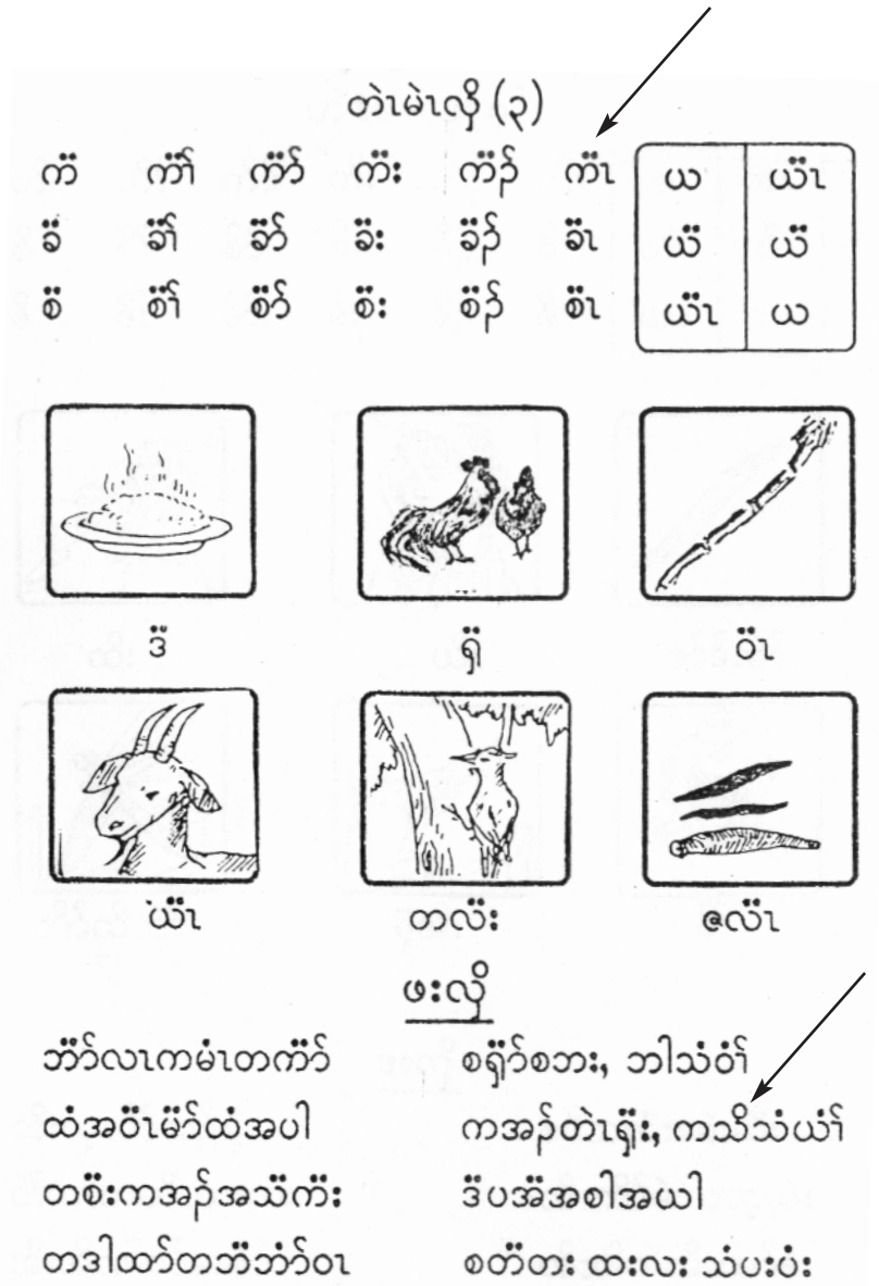
Figure 9. Sample from a Geba Karen primer published in 2005, showing VOWEL SIGN GEBA KAREN I alongside VOWEL SIGN I.