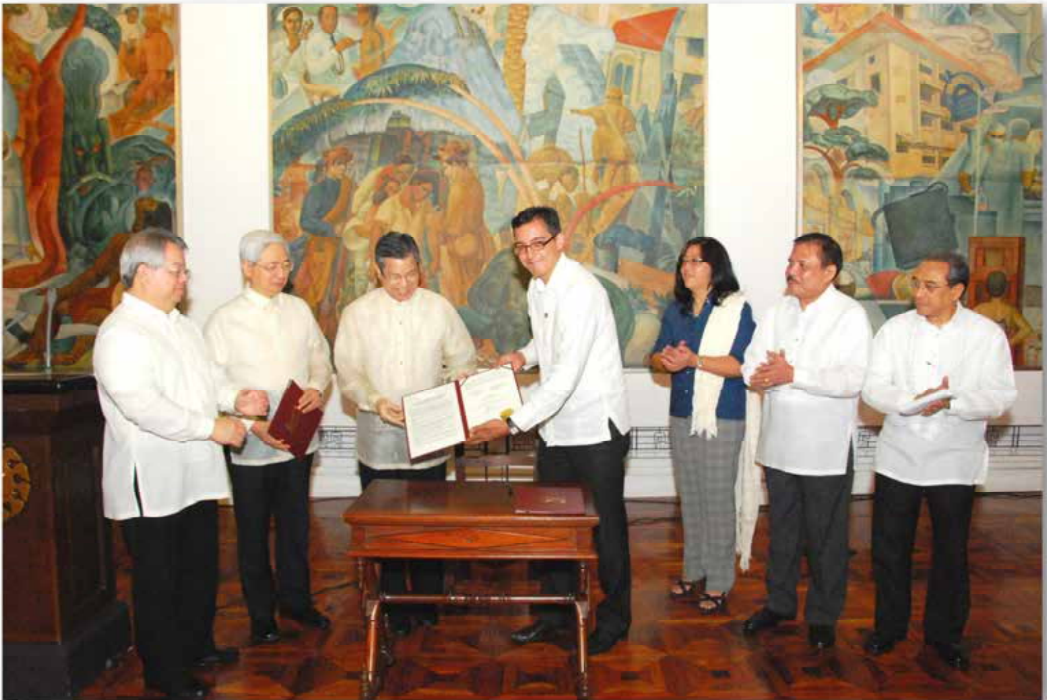
The Carlos "Botong" Francisco painting "Progress of Medicine" declared as a National Cultural Treasure, September 21, 2011 at the Museum Foundation Hall, National Art Gallery Building, National Museum