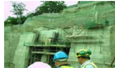
Site Inspection of development of Ambuklao Dam, Benguet