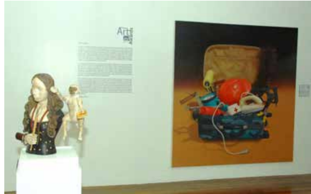
The Philippine Art Awards at the 4th Floor South Wing Gallery of the Museum of the Filipino People