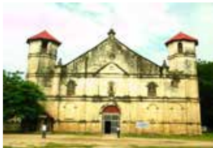
Dimiao Church – Dimiao, Bohol