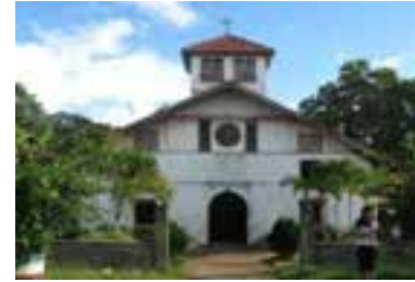
Caraga Church – Caraga, Davao, Oriental