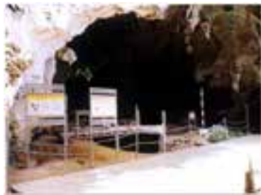
Tabon Cave – Quezon, Palawan