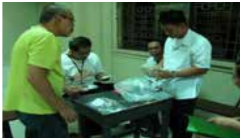
Assessment of illegally transported cultural properties