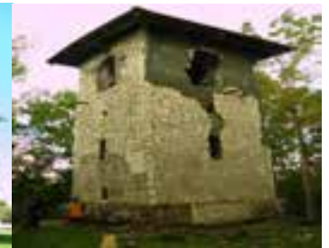
Balilihan Bohol Watchtowers