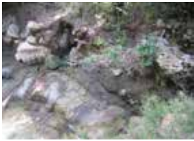
Fossil Site at Sinai, Laguindingan