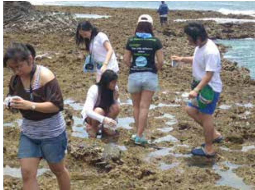
The National Museum, Museum Education Division program-Nature Walk in Baler, May 3-6, 2012