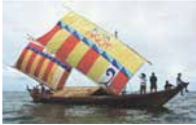
Diwata ng Lahi