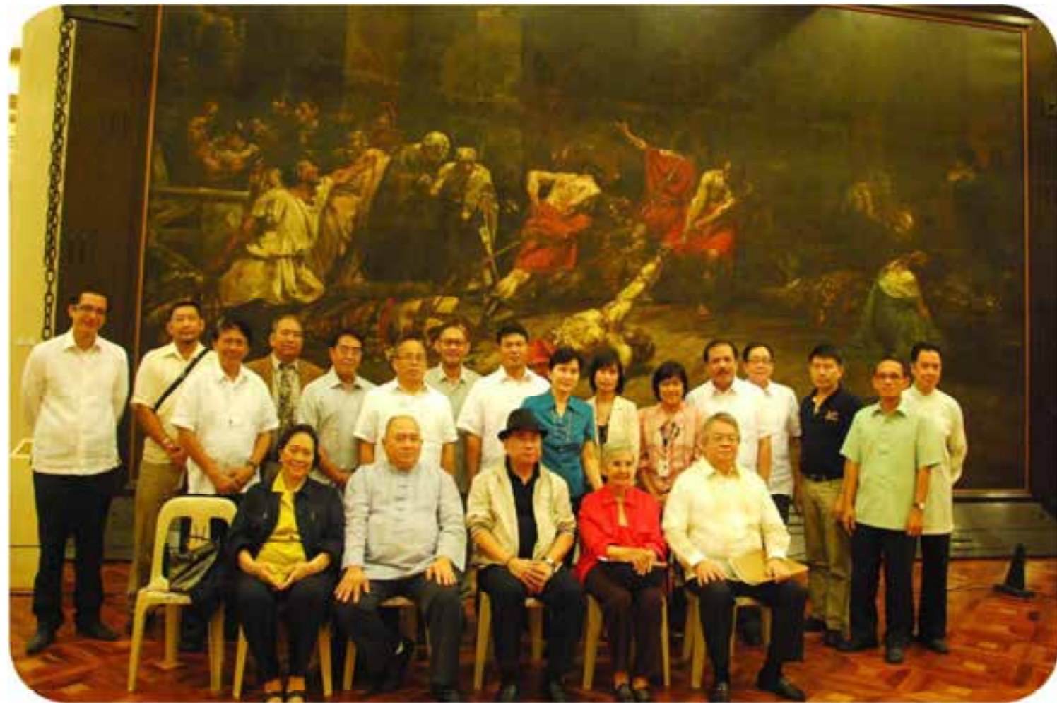
The National Museum Board of Trustees with the Director and the Curators at the Master's Hall.