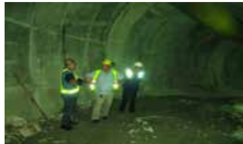
Monitoring of earthmoving activities in Ambuklao dam, Benguet