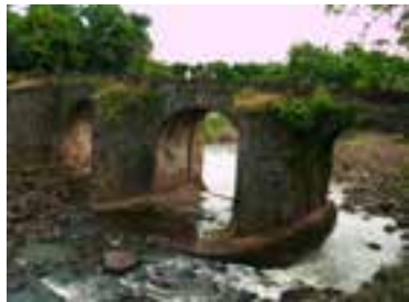
Tayabas Colonial Bridges - Tayabas, Quezon