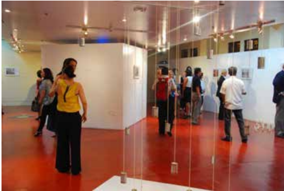
Exhibit sponsored by The Embassy of Mexico titled “Ovo Habitante” at the Museum of the Filipino People