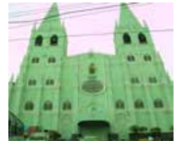
San Sebastian Church - Quiapo, Manila