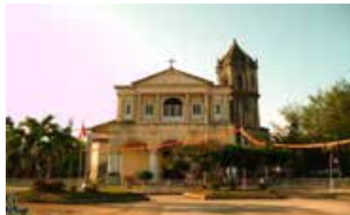
Daus Church – Daus, Bohol