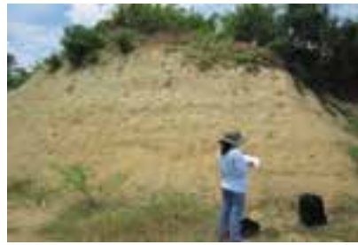
Pleistocene Rock exposure