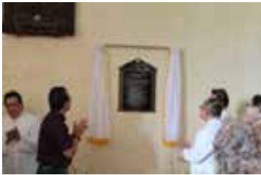
Unveiling of National Cultural Marker