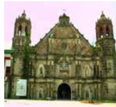
Minalin Church – Minalin, Pampanga