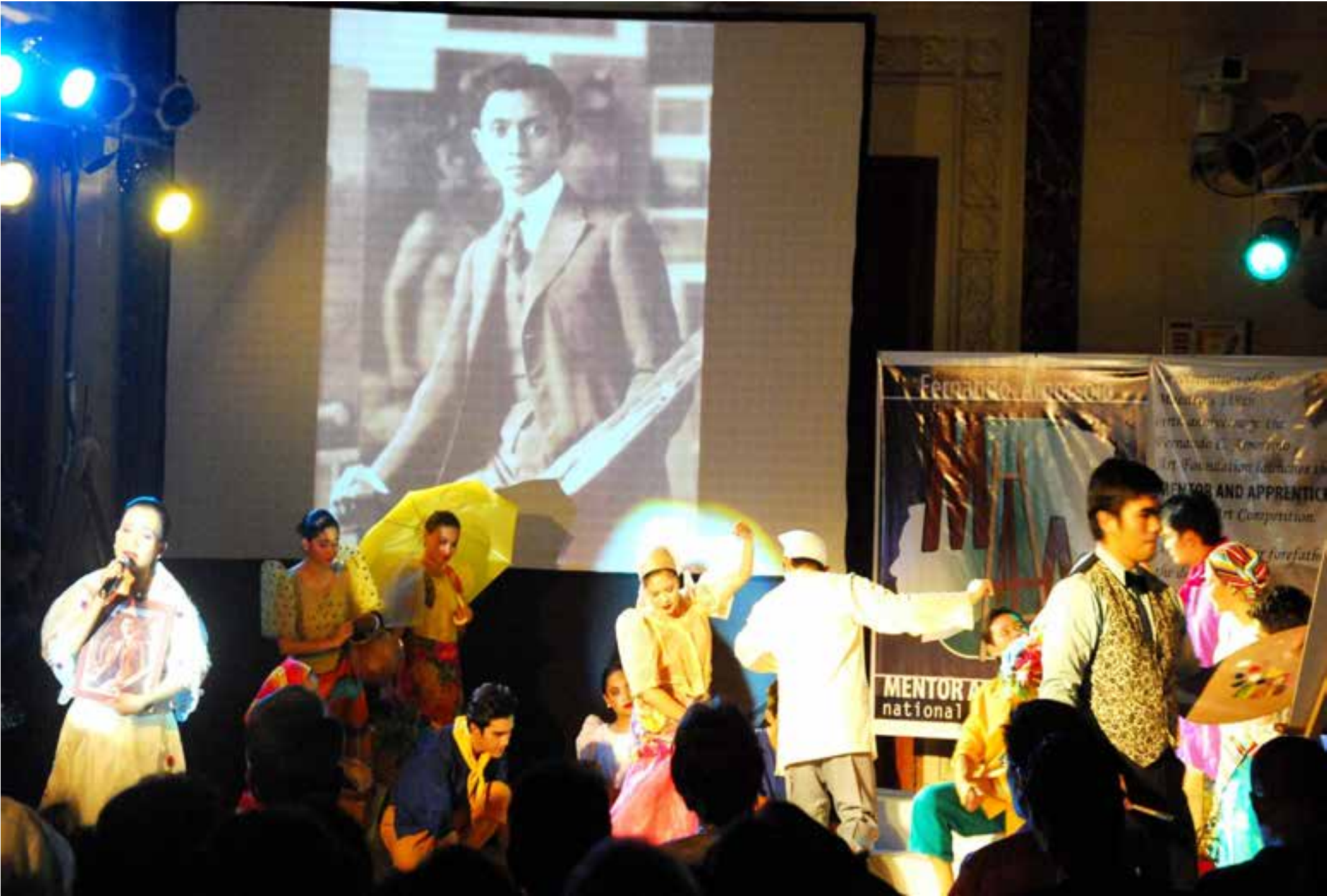
Fernando Amorsolo Art Competition (“Mentor and Apprentice National Art Competition”) launching, May 31, 2011 at the Marble Hall, Museum of the Filipino People, National Museum.