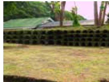
Dimiao, Ermita Ruins - Bohol