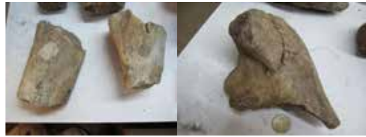
Fragments of fossilized elephant bones from Laguindingan, Misamis, Oriental