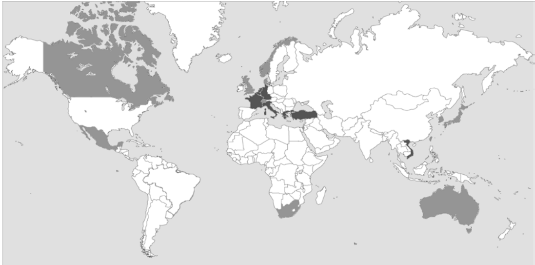
Chart 2: The Comité international Paix et Liberté network around 1954:

Member organizations (black): Paix et Liberté (France), Volksbund für Frieden und Freiheit (FRG), Pace e Libertà (Italy), Paix et Liberté (Belgium), Vrede en Vrijheid (the Netherlands), Eirene kai Eleutheria (Greece), probably an institution of the state (Turkey), probably an institution of the state (Vietnam).