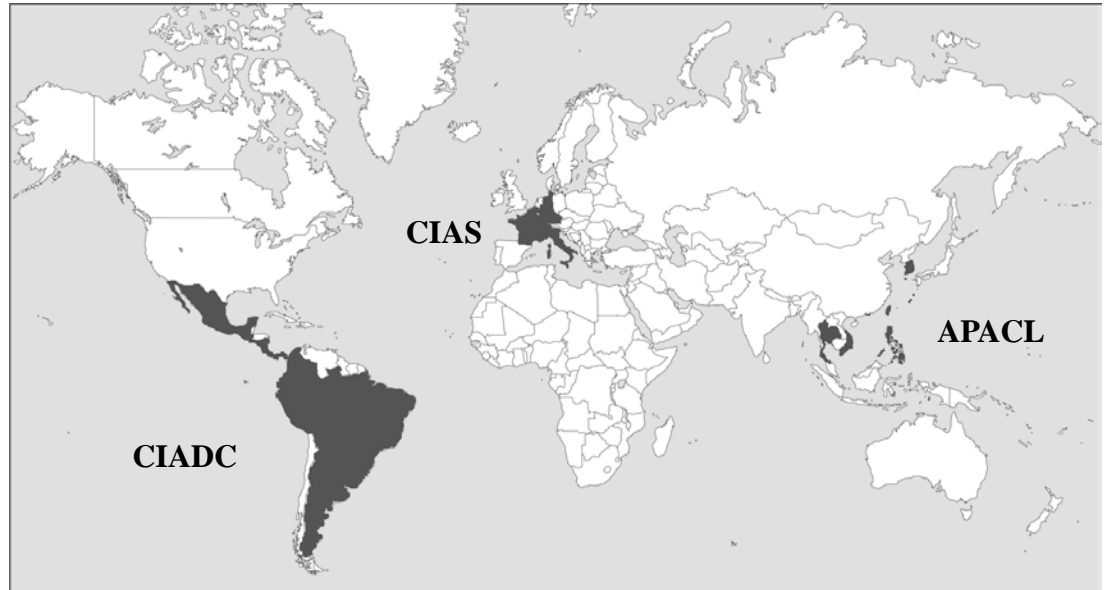
Chart 1: states with founding members of the three anti-communist networks (dark gray).

APACL organizations (1954): South Korea, Taiwan, Thailand, the Philippines, South Vietnam, Hong Kong, Macao, and the Ryukyu Islands. 111