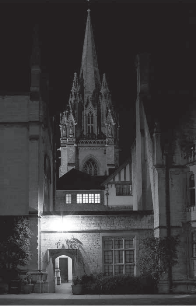
New Quad at night