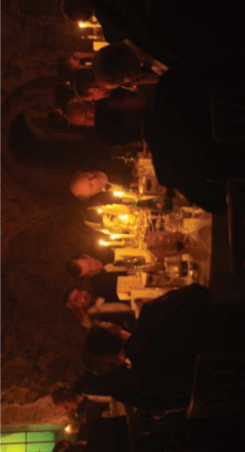
The Phoenix Common Room at the Hellfire Caves