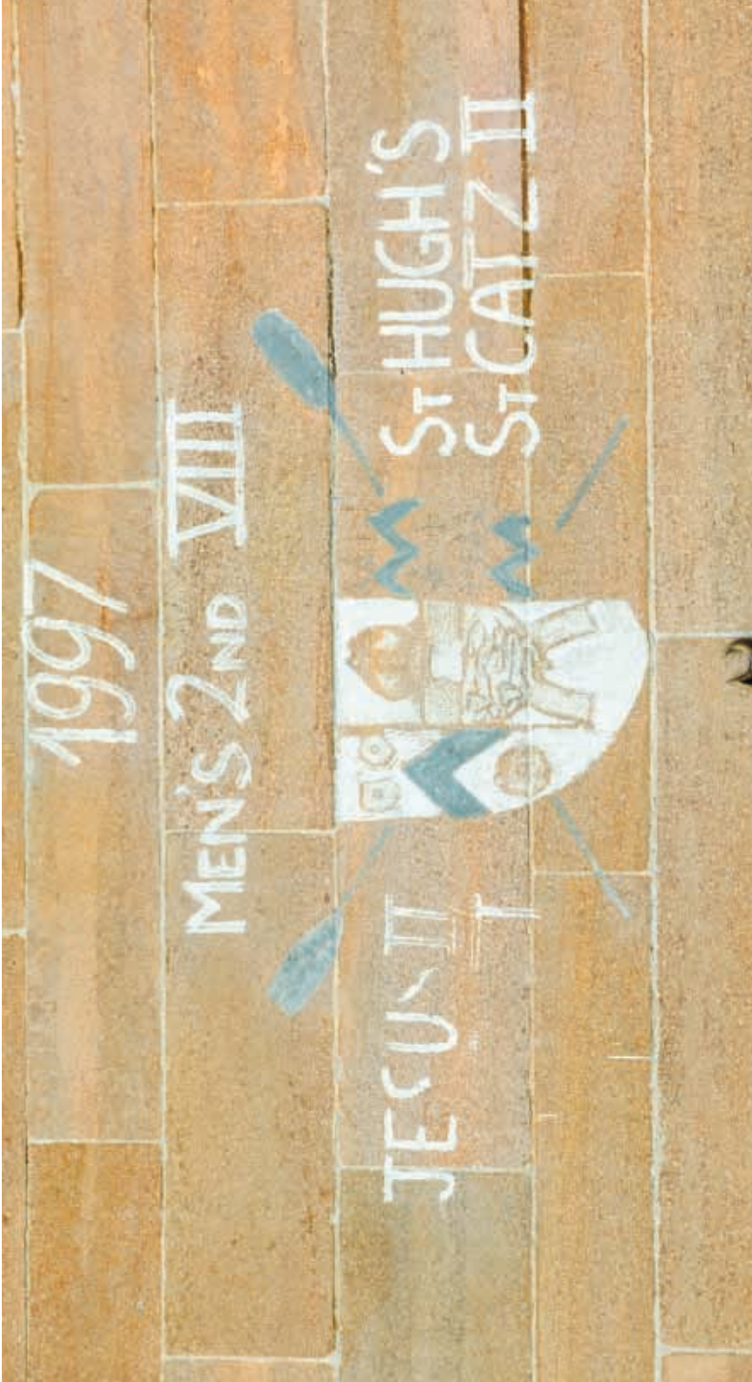
Boat Club mural in Old Quad