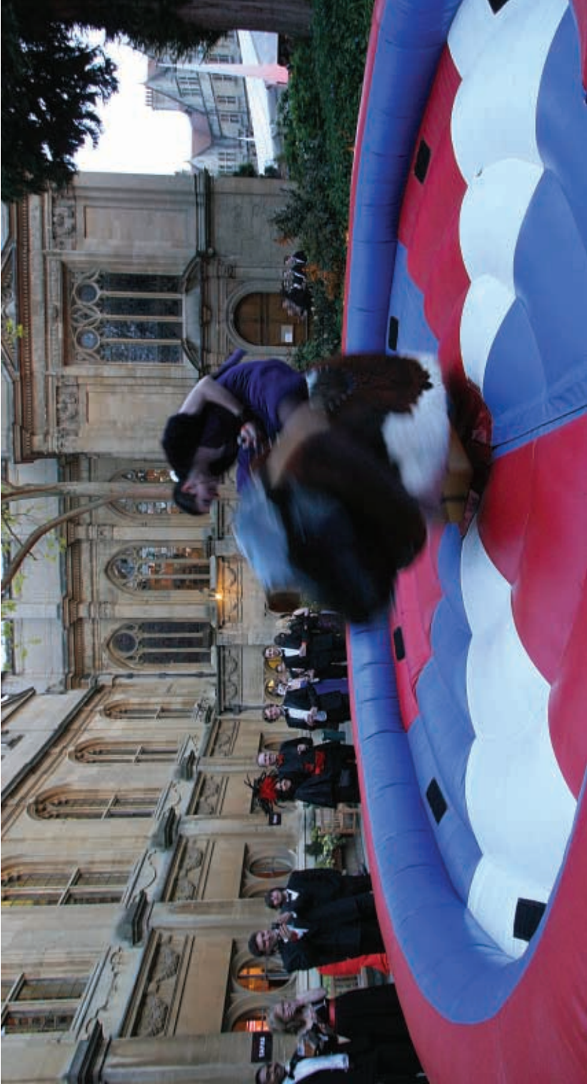
Bucking Bronco at Matador Ball