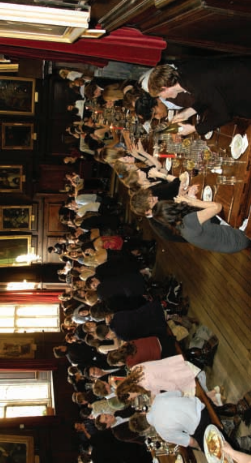
Students dine in Hall