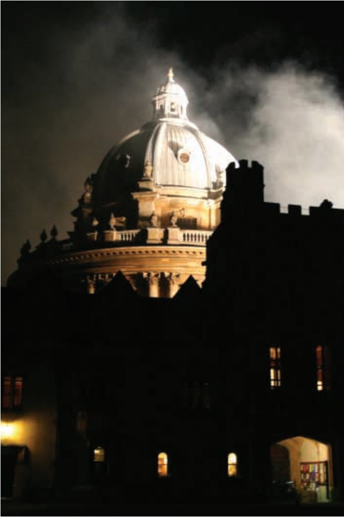
Night-time shot captured during the filming of The Golden Compass