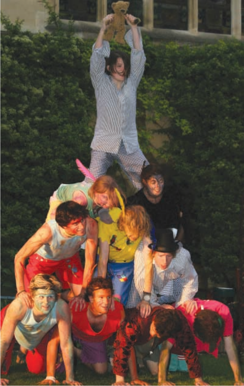
Students perform Peter Pan at Arts Week 2007