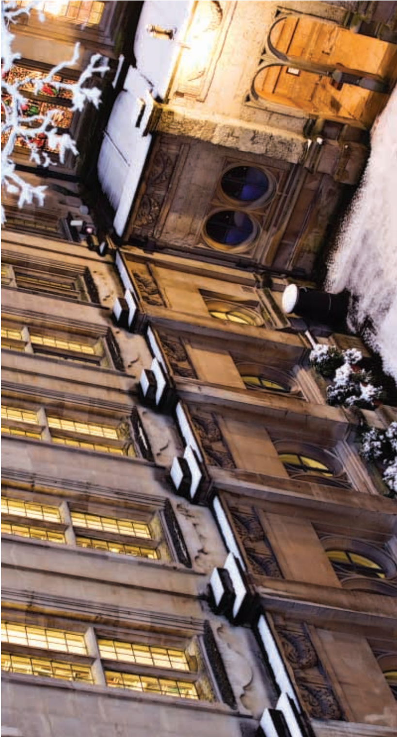
Snow at BNC