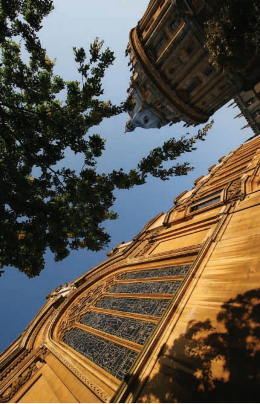
Brasenose College, as seen from Radcliffe Square