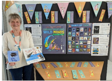
Bairnsdale Regional Hospital

Book Week Displays included the following: