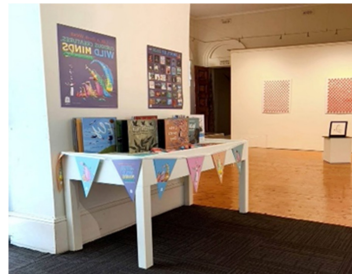
East Gippsland Art Gallery