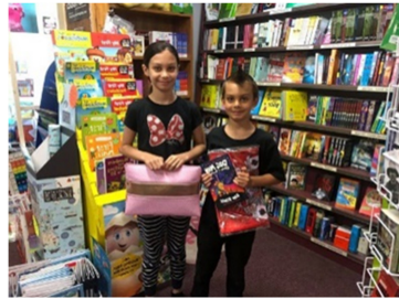
Winners collecting prizes from SchoolWorks Supplies