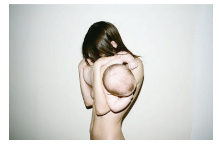
Hanna Putz Untitled, (Nave 2), 2012

Hanna Putz 's (Austrian, b. 1987) photographs raise questions about today's excess of images and the need to perform for the camera in an age of social networking and permanent surveillance. By photographing young mothers and their babies she aims to create a feeling of intimacy and closeness, but without exposing anyone. The mother, solely focused on her child, is oblivious to the camera's presence and unconcerned about 'posing' for it. Composition and color are of great importance to Putz, adding a layer of anonymity to her subjects by transforming them into sculptural forms.