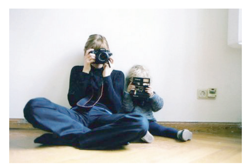
Fred Hüning Untitled , (2 photographers), 2008