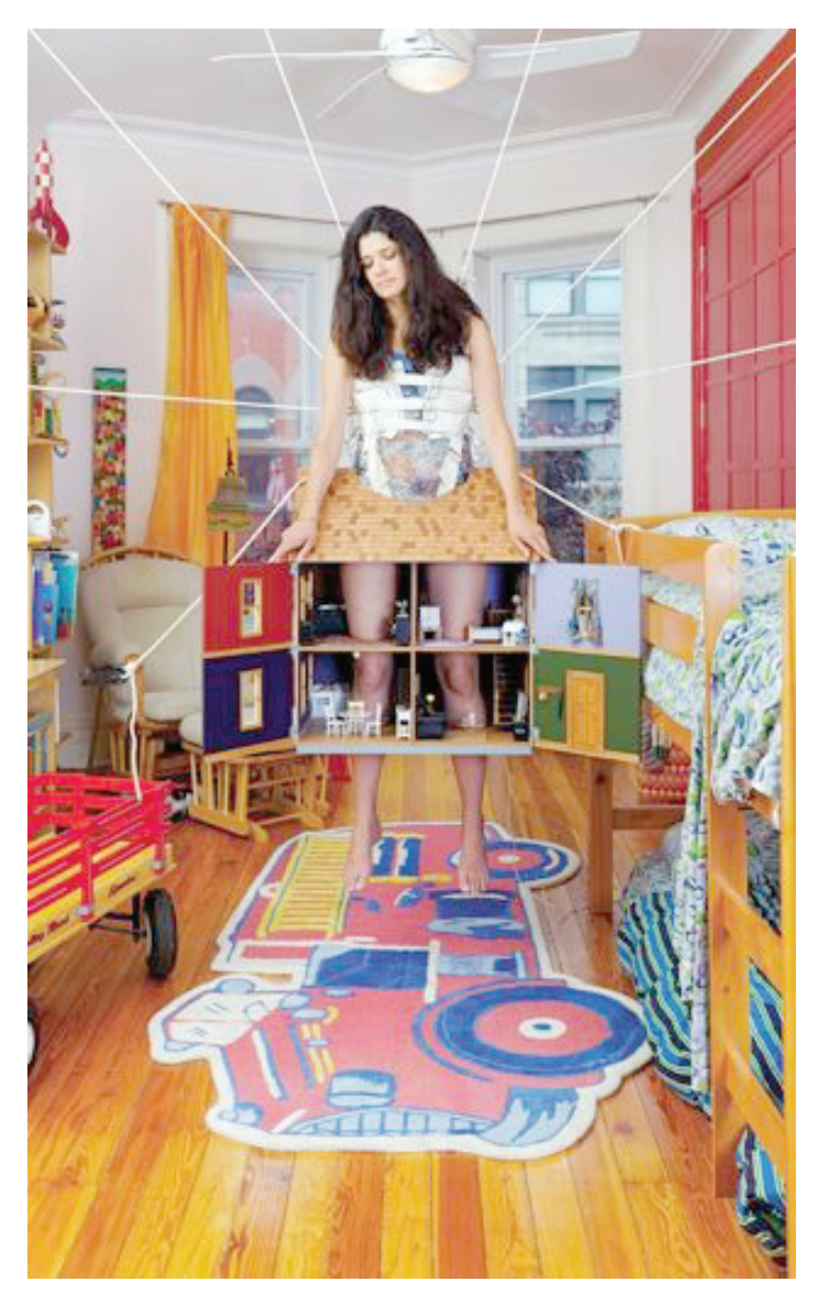
Janine Antoni Inhabit, 2009