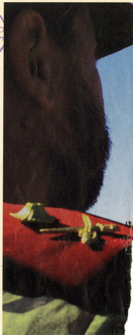
In late April, in a military parade in Kab.