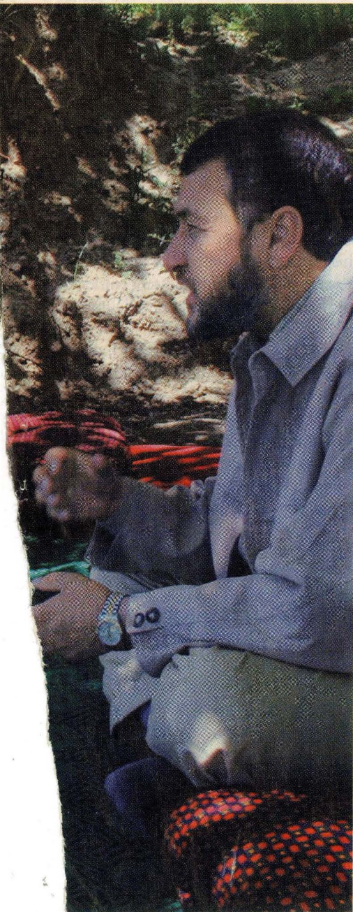
ound the Panjshir Valley.

Patriotic music began blaring from loudspeakers, and Karzai and Fahim left the viewing stand and got into two convertible Russian military jeeps. The jeeps were driven past squads of soldiers who stood at attention in the great plaza in front of the mosque. Karzai waved at the soldiers and Fahim saluted stiffly, the tips