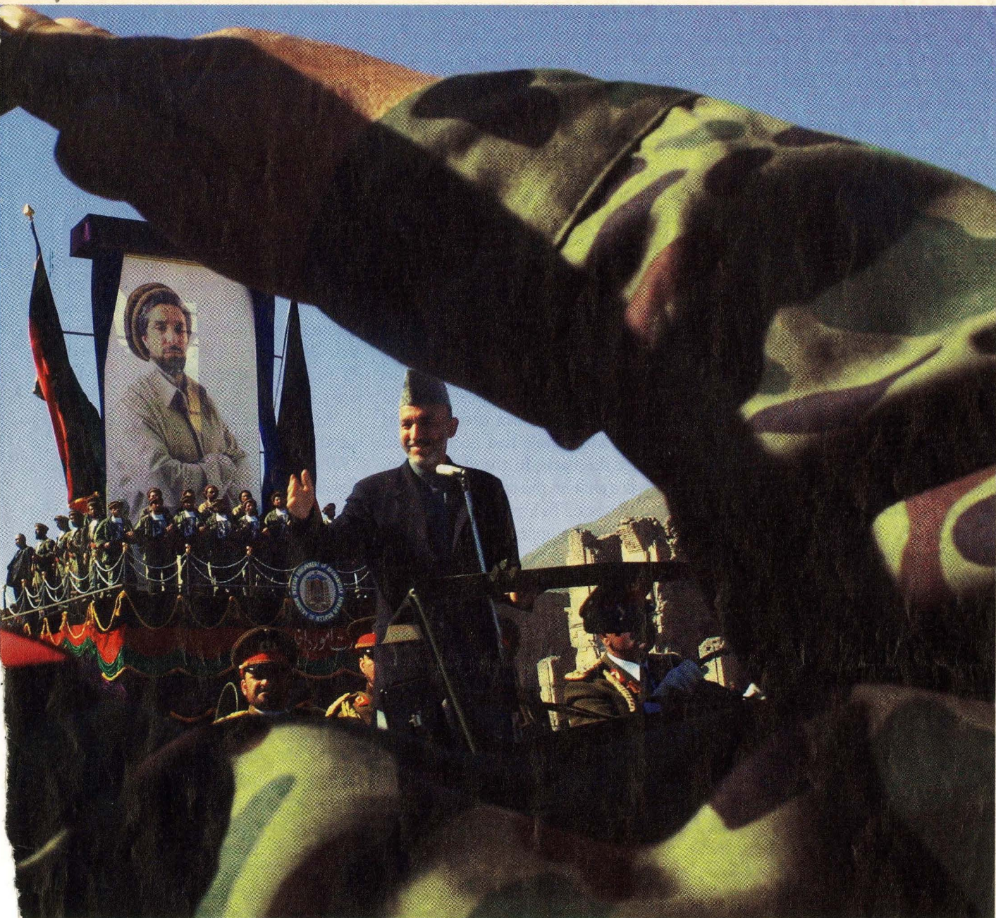
Ahmed Shah Massoud's image loomed over Hamid Karzai, the interim President of Afghanistan.

wore a burkha. But he was a Sunni Muslim at war with other Sunni Muslims—the Taliban—and they professed to be righteous and incorruptible, while he had accepted support from Iranian Shiites and from non-Muslim governments.