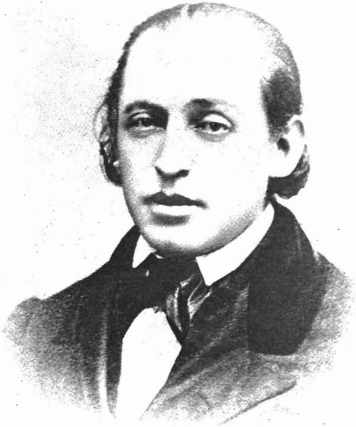
Isaac Mayer Wise As a young rabbi