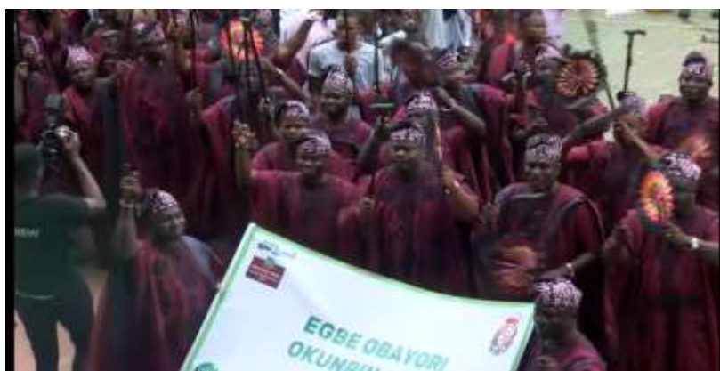
FIGURE 2 SHOWING EGBE OBAYORI OKUNRIN DURING OJUDE-ObA 2019

Traditionally, the favorite colors of the Yoruba are tan, the rich natural tone of the silk known as sanyan, and blue, ranging from the palest to the deepest blue black obtainable from the indigo dye pots. Reds and an occasional yellow are also traditional preferences. More recently, however, innovations in pattern and hue have come to be prized, so that there is a more varied palette and an increased reliance on commercially manufactured yarns rather than dependence on handspun and locally dyed weaves. This is why today, some age grades would wear agbada [big overall cloth for men], laced with green damask. In one of the previous Ojude Oba festivals, all the age grades wore the same pattern of cloth; the only difference.