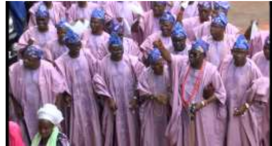
FIGURE 3 SECTIONAL PICTURES OF DIFFERENT AGE GROUPS IN OJUDE-OBA FESTIVAL IN 2019