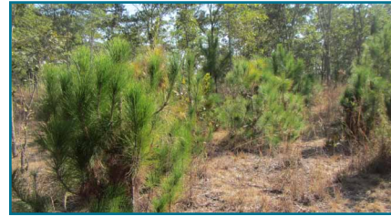
Exotic conifers with indigenous woodland behind

The woodland was once cut for firewood and cleared for agricultural land by residents from neighboring suburbs of Mabvuku and Tafara. It has now regenerated itself since the park gained official protection. However urban settlement and increasing agriculture could become more of a threat to the site's catchment area in the future. Downstream, industries are drawing water from the dam for industrial use.