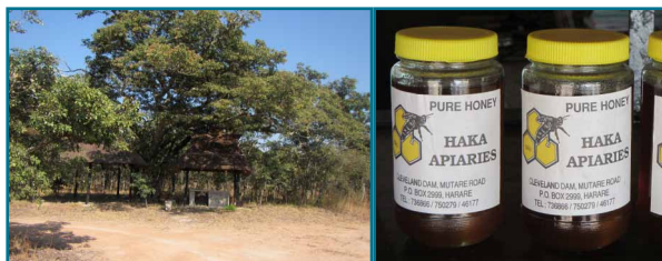
Left: A picnic spot in Haka game park. Right Honey - a forest product that Haka Camp are producing at the site

The catchment is used for recreational purposes such as bird watching, fishing canoeing, game viewing, walking safaris, horse riding and regularly wedding functions and camps to the public around the city and beyond. Birdlife Zimbabwe utilises the area for bird walks at least once a month. The Tree Society of Zimbabwe utilises the area for tree outings and identification.