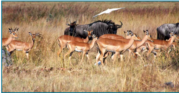
Impala and Blue Wildebeest grazing on the grasslands around Cleveland Dam

The site acts an important refuge for breeding stocks of fish, which re-colonise the floodplain by migrating upstream during flooding events. Therefore the stock for the entire floodplain is protected within the park.