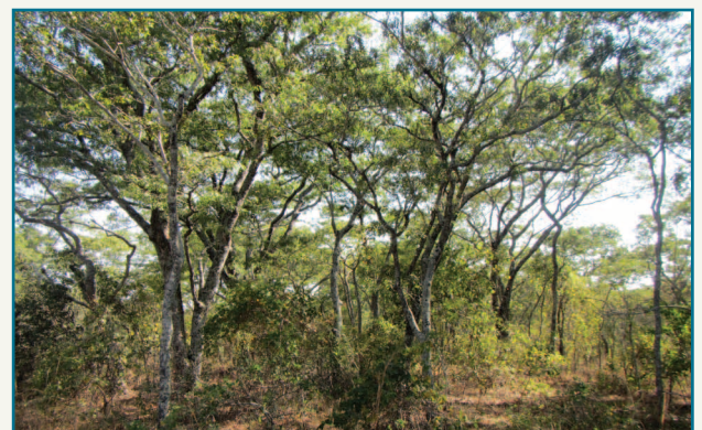
Miombo woodland at Haka Camp