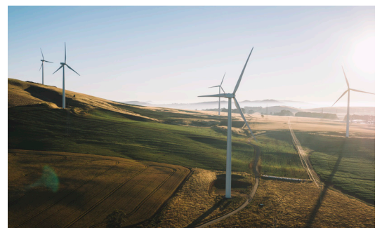
Waubra Wind Farm ▲