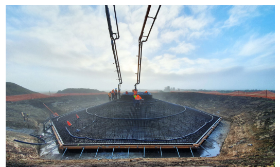
Mortlake South Wind Farm ▲ (under construction)