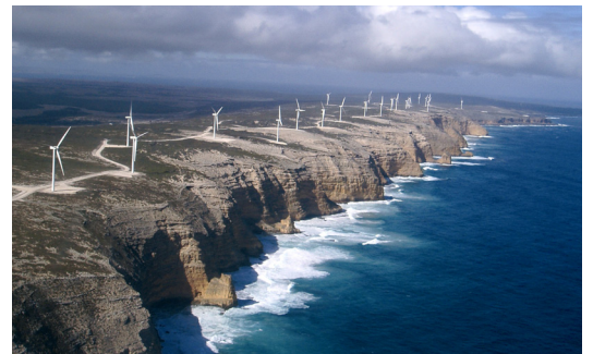
Cathedral Rocks Wind Farm ▲