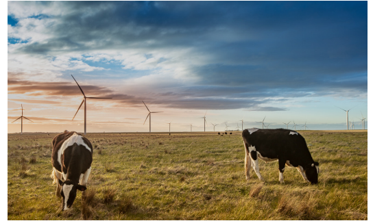
Mt Gellibrand Wind Farm ▲