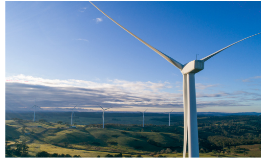
Gunning Wind Farm ▲

You can also visit our website at: http://www.acciona.com.au/waubra