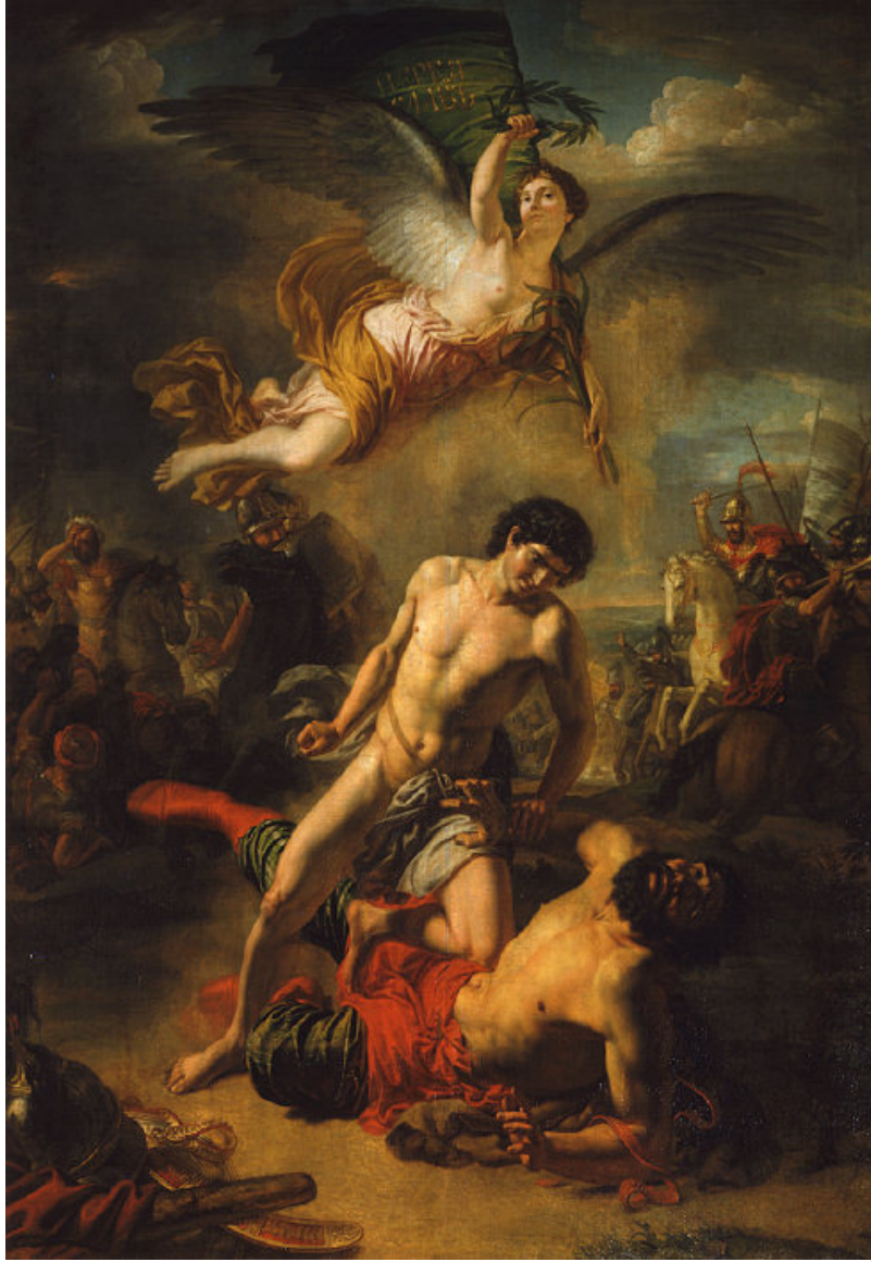
Clash of the Titans.

(Russian) portrayal of the epic combat of the Russian Prince Mstislav Vladimirovich the Bold (of Tmutarakan) with the Kassog Prince Rededya (Reidade) in 1022 AD.