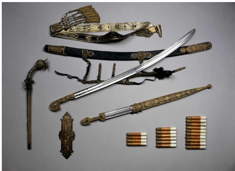
Full weapon set of Kabardian warrior (sword with sword-belt, dagger, pistol, cartridge cases). The set was presented to Tzarevich Nikolai Alexandrovich (future emperor Nicholas II) in 1888 by a North Caucasian deputation.

The last Kabardian Prince of Princes was Kwshikw Zhanx'wet (Жанхъуэт и къуэ Кушыку), who ruled Kabarda in the period 1809-1822. By his death in 1830, a dynasty that went back to the 14th century AD came to an end.