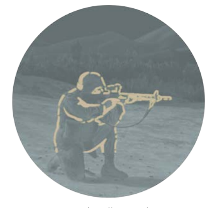
Fused outline mode