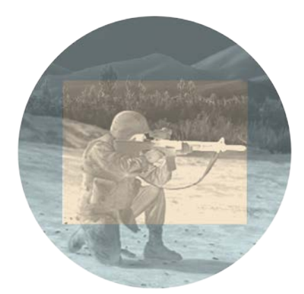
White-hot fused overlay view