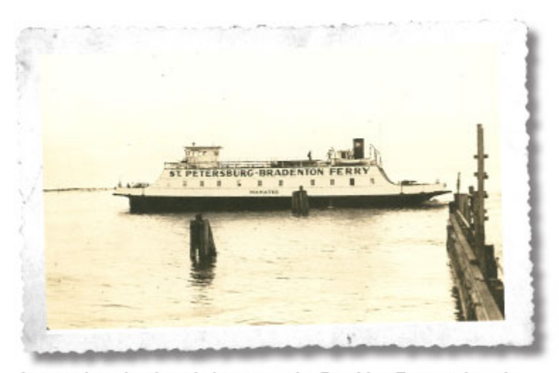
In a society that loved shortcuts, the Bee Line Ferry reduced a 69-mile trip from Manatee to Pinellas County to just 22 miles. Introduced in 1926, experts hailed it as a transportation breakthrough, second only to the Gandy Bridge linking Tampa and St. Petersburg. The ferry crossed Tampa Bay in just an hour and round-trip passage for a car and passengers was $3.00.