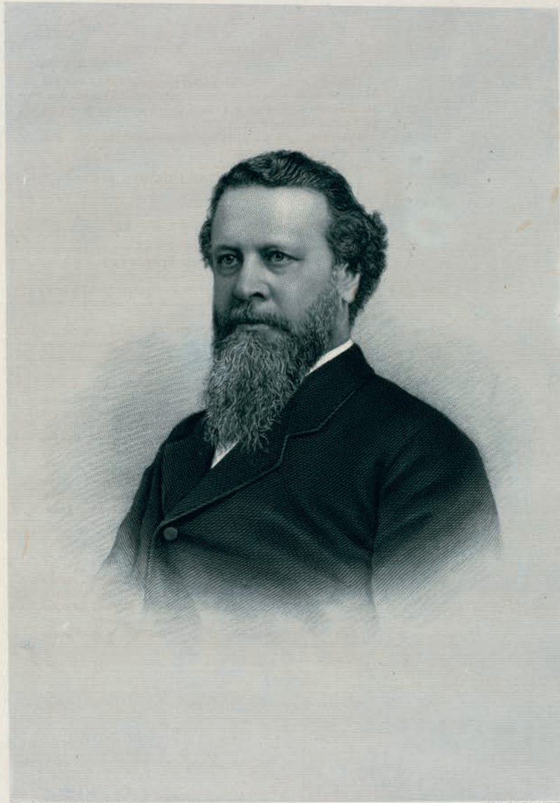
Illustration published by Knickerbocker Co. New York.