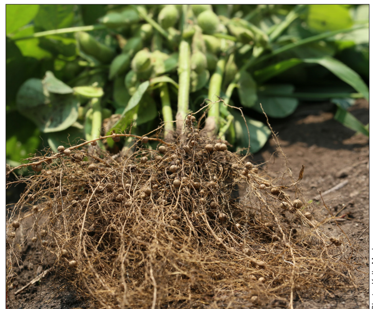
N-fixing nodules on plant roots

Earthworms , vital for healthy soil structure and fertility, are key bioindicators of chemical contamination. Multiple studies have demonstrated that pesticides (including glyphosate and parathion) decrease reproductive success, juvenile survival, and overall development in earthworms. 6