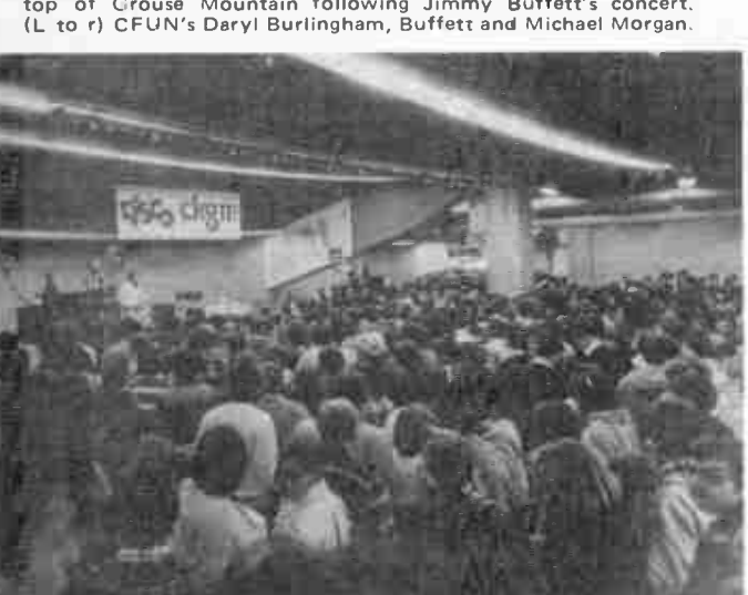
Thousands crowd the CKGM stage to take part in the wildest party ever held in Canada's Olympic Stadium as the station presents the first of five summer disco parties.