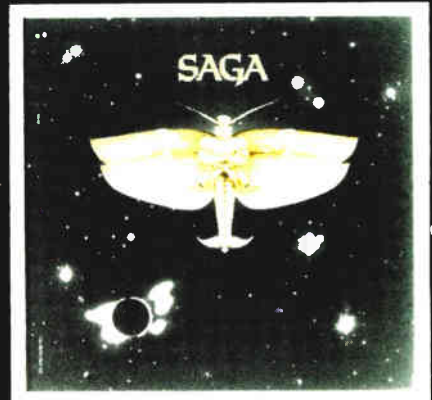
POLYDOR 2424 175

SAGA: Discover the answers on Polydor Records and Tapes