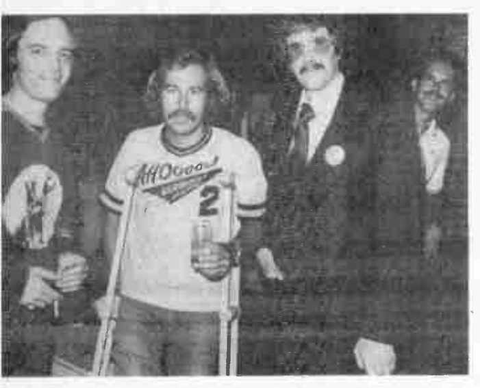
CFUN Vancouver scores another first - a live broadcast from the top of Grouse Mountain following Jimmy Buffett's concert.