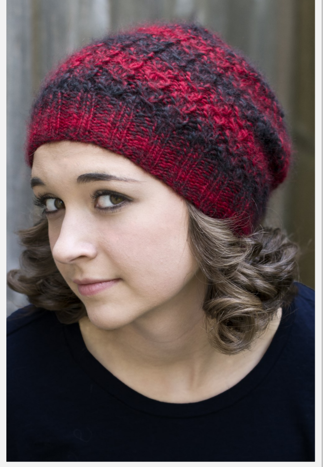
Designed by Carly Waterman