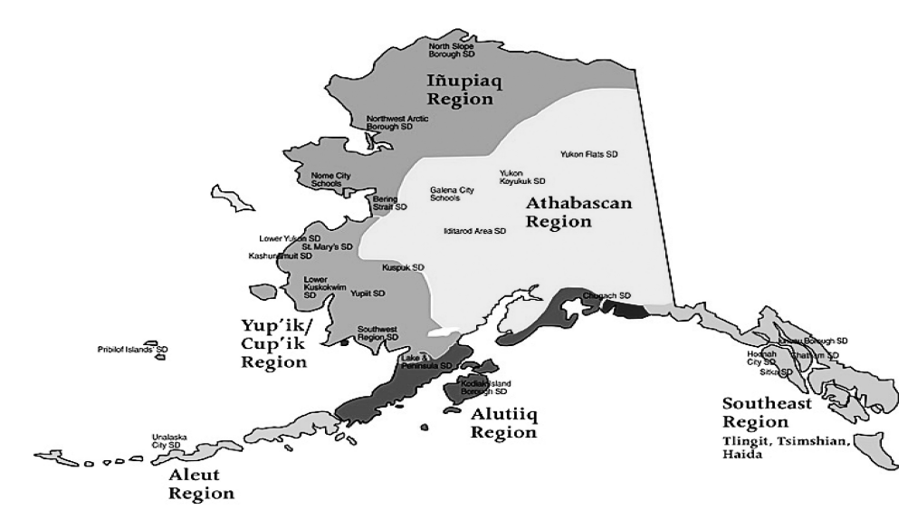
Figure 1. Alaska Rural Systemic Initiative: Cultural regions and participating school districts.

Science Commission, and the First Alaskans Institute) to address some of these same issues through an Indigenous lens.