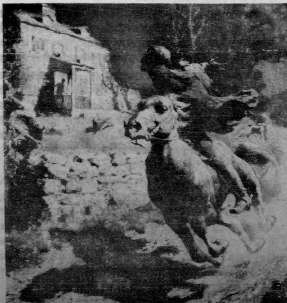
Paul Revere sounded the alarm in 1775.

Col. Charles A. Lindbergh said without mincing words, that they'd better think twice about such policy if it means America's involvement, and they screech at him: "We've got nothing to do with it!" Fiddle-faddle!