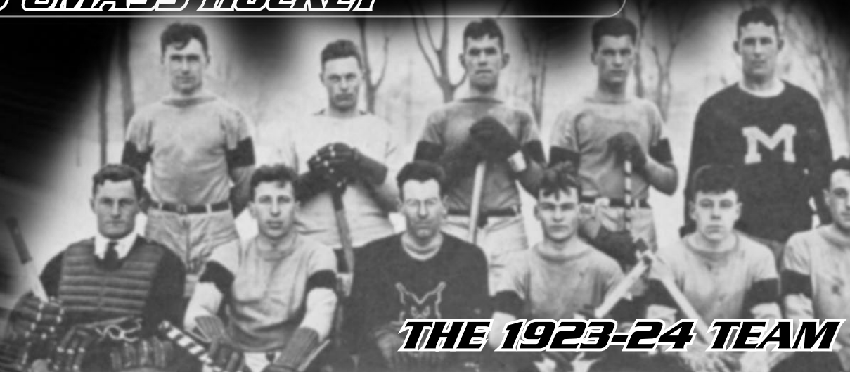
THE 1923-24 TEAM