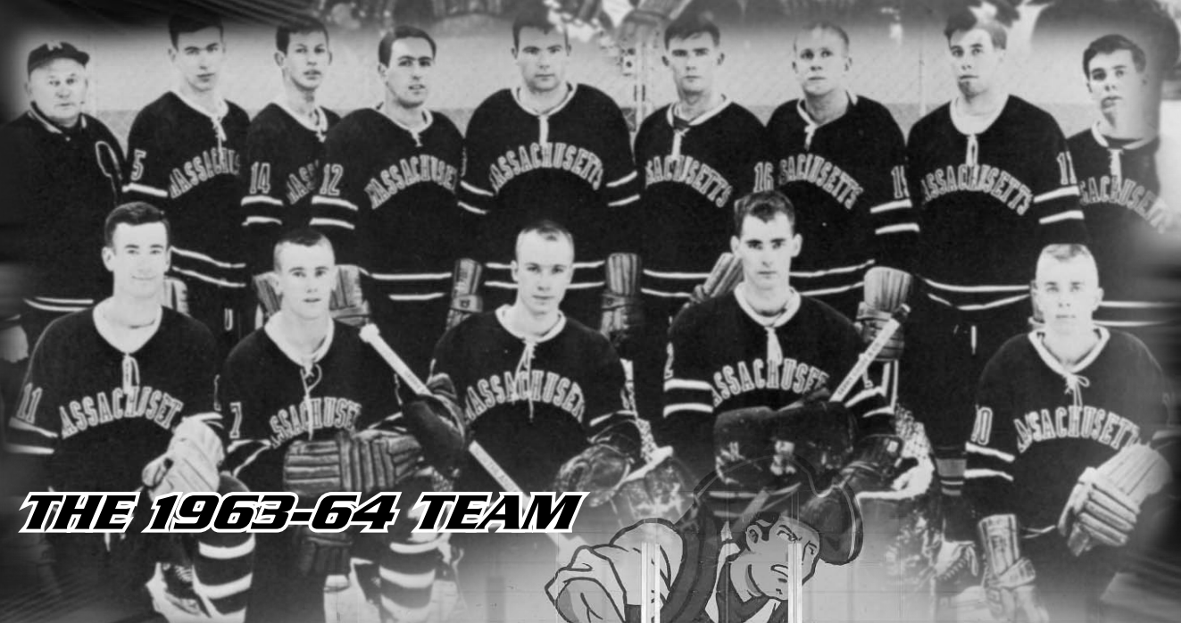
THE 1963-64 TEAM