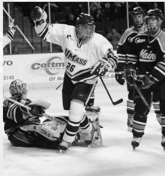
The triple-overtime thriller against Maine in the 2004 Hockey East Championship game is the only three-overtime game in UMass history.

OVERTIME GAMES RECAP (141): Overall record: 26-42-73 At home all-time: 13-26-48 On road all-time: 11-18-18 At neutral sites: 3-2-3 Since 1993-94: 14-27-43 At Mullins Center: 5-14-25 On the road since 1993-94: 7-11-15 Neutral sites since 1993-94: 3-2-3 vs. Hockey East teams: 8-18-30