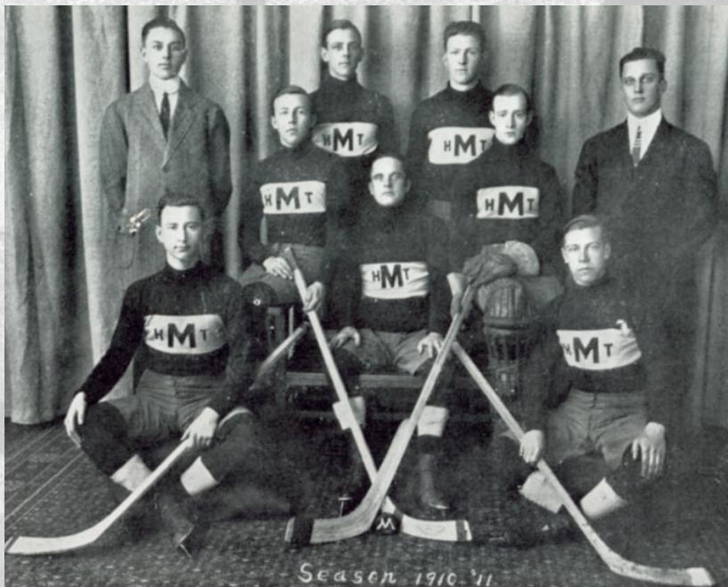
The 1911 Mass Aggies were 7-2-0.