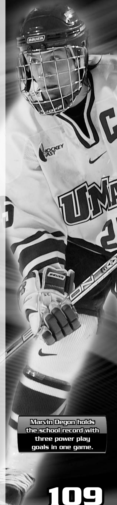
Marvin Degon holds the school record with three power play goals in one game.