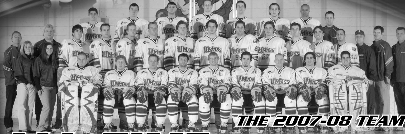
THE 2007-08 TEAM