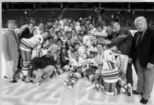
In 2007-08, UMass beat No. 6 Notre Dame and No. 4 Colorado College to win the Lightning College Hockey Classic.