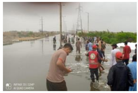
PRCS Volunteers helping People Evacuation in Sindh.

Dadu district is located at the border between Baluchistan and Sindh. It is the worst hit area in recent monsoon floods. Multiple breaches reported in 'Flood Protection Embankment' on Saturday, 8 August 2020, evening local time which triggered flooding in at least 200 villages in Johi Taluka (Tehsil), Dadu district. Most of the resident of the affected villages spent the night under the open sky after being rendered homeless. Four breaches – one major and three minors had inundated almost whole Tehsil Johi, district Dadu, affecting most of the population residing in 200 villages. The breaches were caused by a hill torrent that overflowed due to heavy rainfall during the past few days at the catchment area in Baluchistan. Villages in Union Councils (UC) of Pat Gul Muhammad, Drig Bala, Wahi Pandhi, Rahim Khan, Sawro, Chini and Kamal Khan were badly affected.