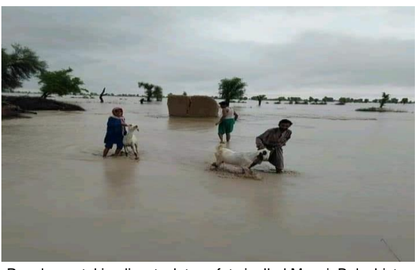
People are taking livestock to safety in Jhal Magsi, Baluchistan

Rapid needs assessment (RNA) in Dadu district was conducted from 10 to 13 August 2020 led by PRCS Sindh branch where Disaster Management Manager accompanied by Planning, Monitoring, Evaluation and Reporting (PMER), and District Disaster Management Team (DDRT) members. For assessment, the team used the pre-designed RNA format. A consultative process took place with different stakeholder including District Branch Dadu, Revenue Department, District Administration, Health Department and DDMA Dadu. The team visited the most affected Tehsil Johi and met different stakeholders and community members.