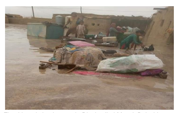
Flood inundating houses in District Jhal Magsi, Baluchistan.

Torrential rains that lashed 22 districts of Baluchistan province on Saturday 7 August 2020 caused flooding and damaged bridges and highways, cutting off highways Gwadar-Karachi, Quetta-Jacobabad from main cities. Several parts of the province were inundated with floodwaters and the paramilitary personnel were called in to evacuate people to safer areas. In Bolan area, flash floods swamped and damaged the main Quetta-Sibi highway at various points, cutting off the area with the provincial capital. A bridge on the Quetta-Sibi Highway, near Bibi Nani area of Bolan district, was badly damaged suspending all kinds of traffic. Hundreds of commuters were stuck in the floodwater. On the bridge along Makran coastal highway to Gawdar near Badok is destroyed in flood stream causing inaccessibility from Gawdar to Lasbela and Karachi is disconnected with many vehicles were stuck along the way.