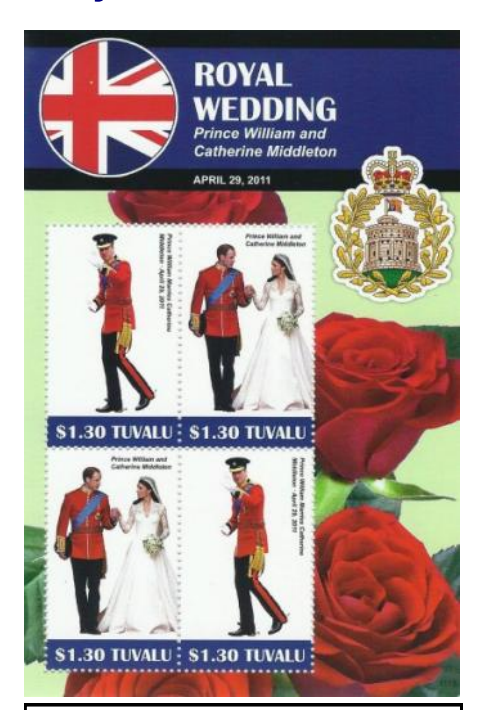
Above: Royal Wedding of Prince William and Catherine Middleton released in April 2011

Probably the most talked about event that everyone in Tuvalu is greatly anticipating is the royal visit of their Royal Highnesses, the Duke and Duchess of Cambridge.