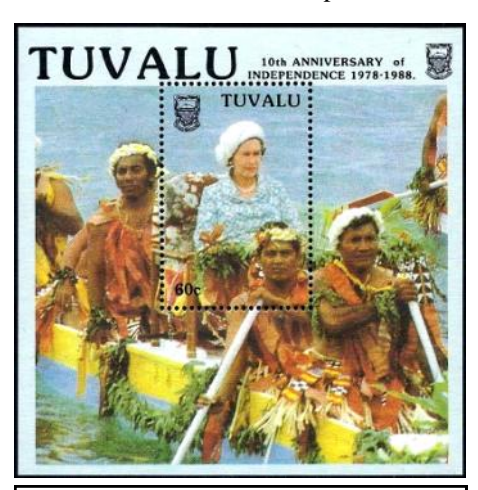
Above: Tenth Anniversary of Tuvalu's Independence released in 1988

Tuvalu was honoured by the royal visit of the reigning monarch, Queen Elizabeth II and Prince Philip in 1982