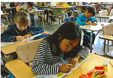
Japanese Language Class

Our students are expected to demonstrate the same kind of proficiency in Japanese that students in local schools demonstrate in English. Using Japanese, our students are tested in mathematics, science, and social studies according to the guideline established by the Japanese government. Student grades are based on test scores, attendance, and homework. By the time our students graduate, they have acquired Japanese language skills that, together with their English language skills, make them functionally bilingual.