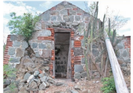
Powder house at Fort Gustav

well as traffic in the harbor of Gustavia, and a deterrent for the population de Gustavia. At the foot of the ramparts, a covered path, still visible, wound around the fort. A covered terrace with rotunda built of paving stones for the artillery, the main building, and the bakery were above. Even higher was the stone pillar erected in honor stele of lieutenant August Nyman. At the end of the path was one of the sentry boxes (there was a second one but it was destroyed when the weather station was built on the site in 1952). The cistern was built of vaulted stone. The redoubt (2) was built on the highest point of the site, where there was a second terrace. This elevated point was also where various lighthouses were located (the current one dates from 1961). The powder house (3) is still extant, but altered, and located between the redoubt and the artillery terrace. It has a thick roof with pointed exterior form to help reflect projectiles. The