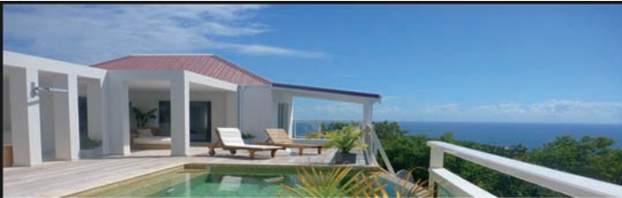
The Saint Barthélemy International Property Owners Association opened the 2017 season with a members-only cocktail party at the beautiful Camp David, with catering by Kiki è Mo.